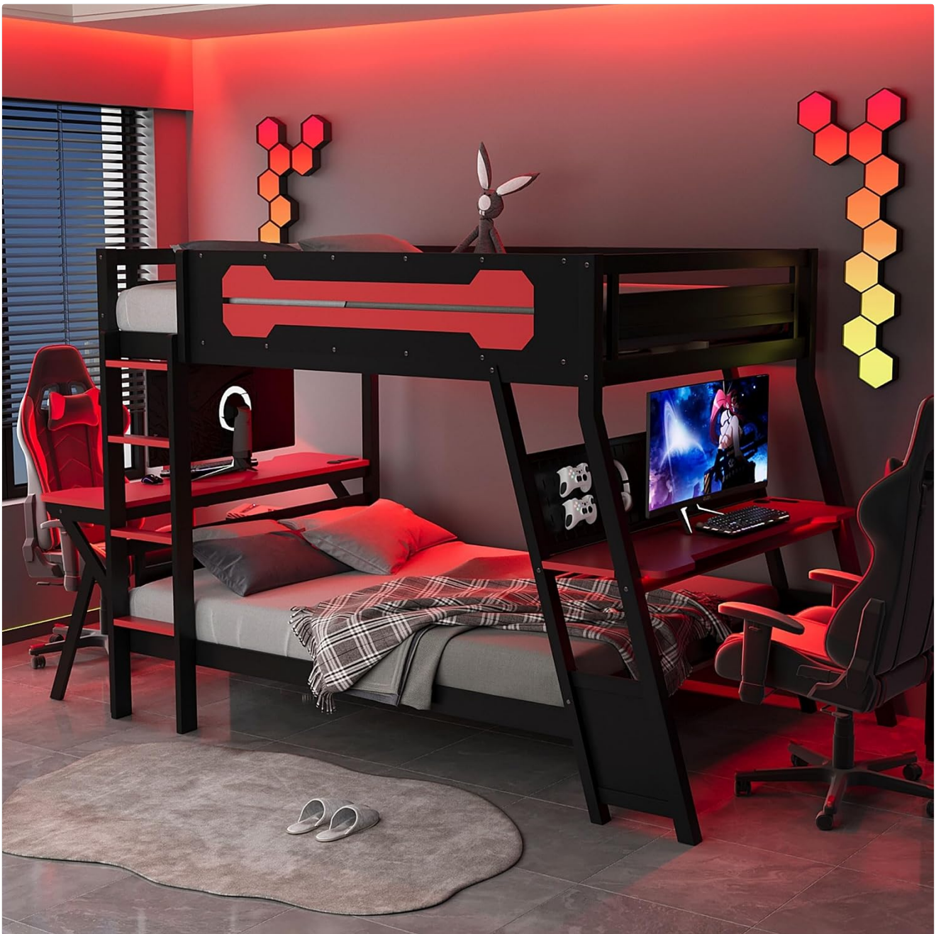
Image: The Polibi Full Over Full Bunk Bed in red, showcasing its dual sleeping areas and integrated gaming desks.