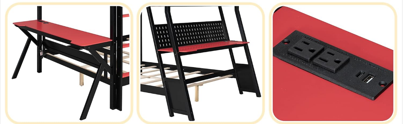
Image: The bunk bed integrated into a gaming room environment, demonstrating its functional use.