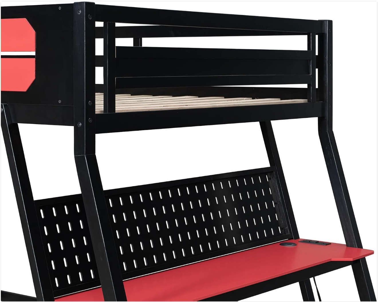
Image: A close-up view of one of the gaming desks, highlighting the integrated USB charging ports and the pegboard organizer.