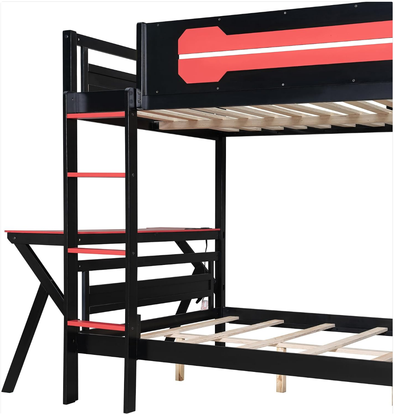
Image: Side view of the bunk bed, illustrating the integrated ladder and one of the gaming desks.