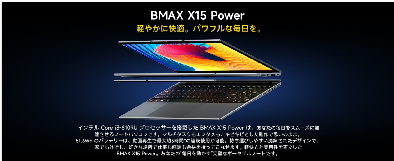
Figure 2.1: Overview of the BMAX X15POWER laptop, highlighting its core features like the Intel Core i3 processor, Iris Plus Graphics, 16GB DDR4 RAM, 512GB SSD, 15.6-inch IPS display, and various ports.

Familiarize yourself with the physical components of your BMAX X15POWER laptop.