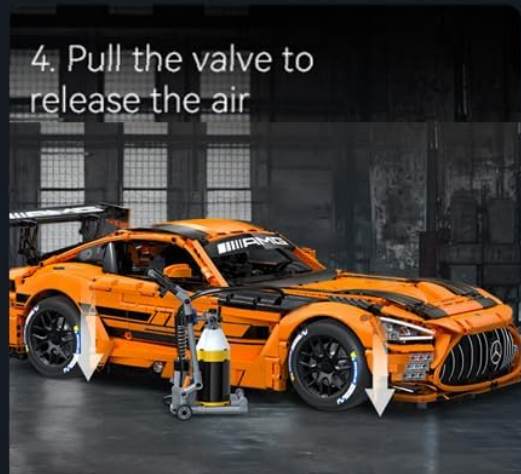
Image: Demonstration of the pneumatic air lifting system for tire changes on the CaDA Master C64008W model.