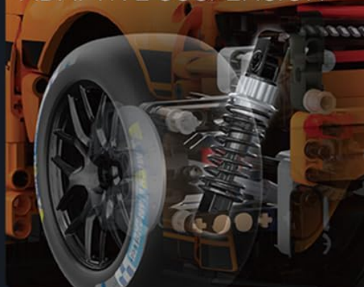
Image: Close-up view of the functional features of the CaDA Master C64008W, such as the 6-speed racing gearbox, steering column adjustment, USB lights, and adaptive suspension.