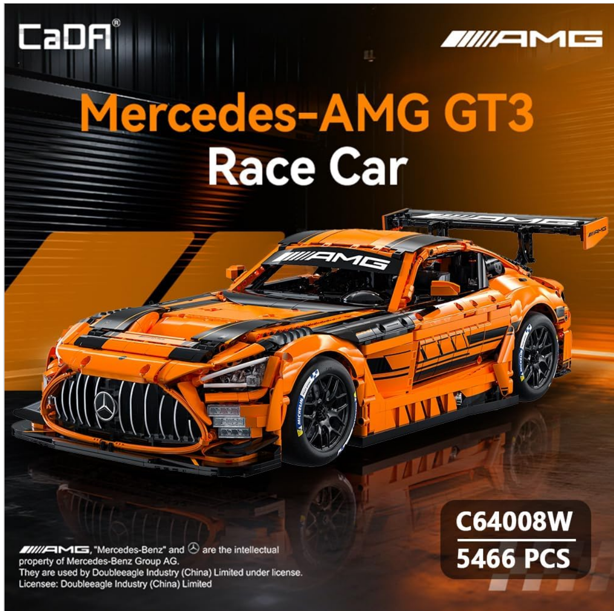
Image: The fully assembled CaDA Master C64008W Mercedes-AMG GT3 model, showcasing its detailed design.

For detailed visual guidance, refer to the included instruction manual.