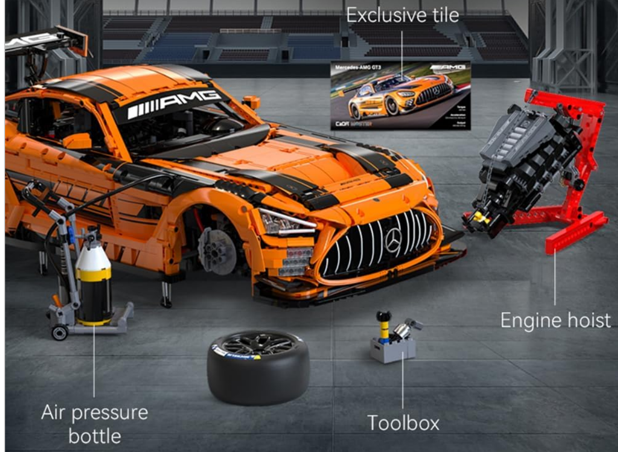
Image: The CaDA Master C64008W model displayed with its various accessories, including an engine hoist and toolbox.