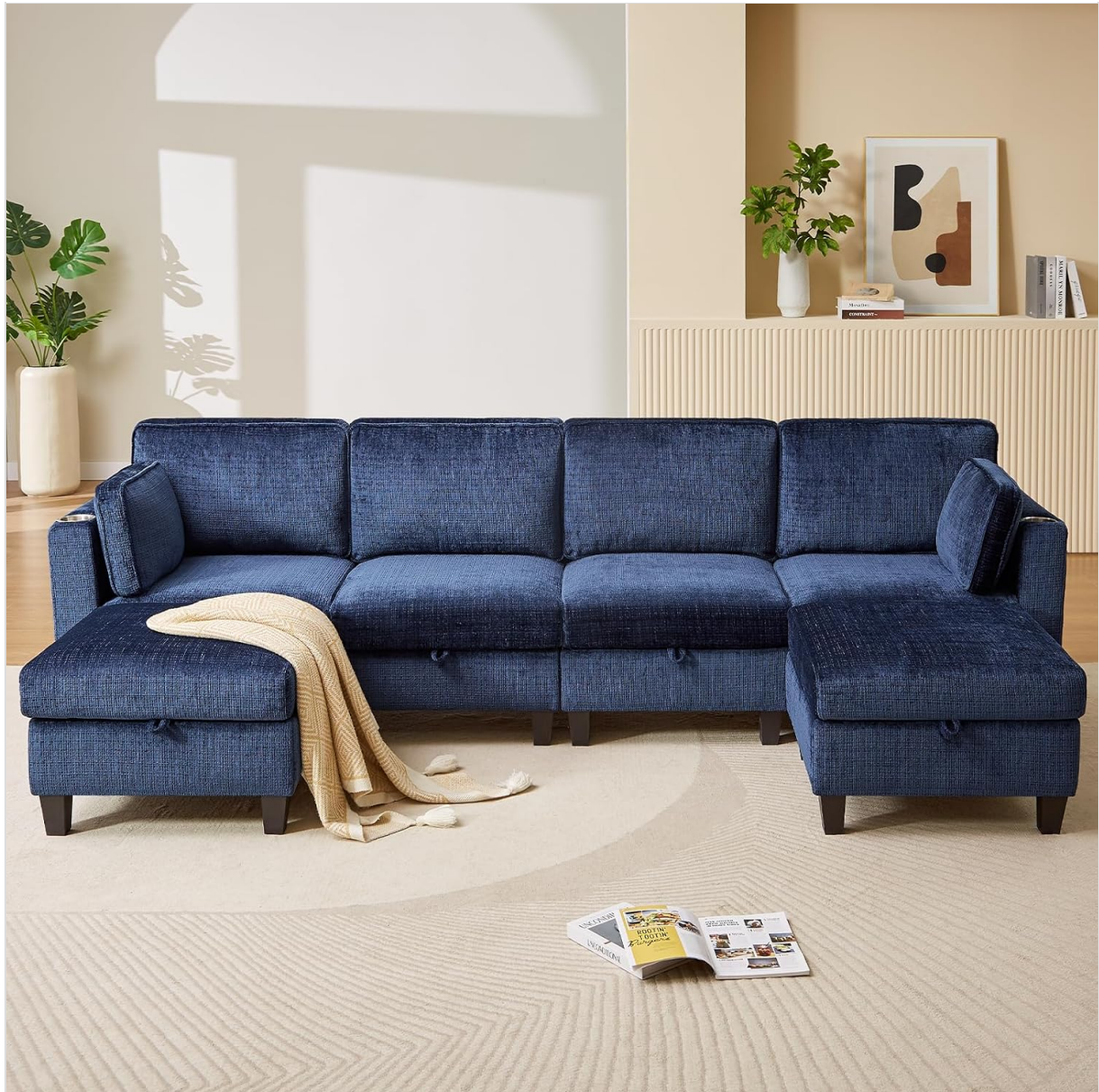
Image: The sofa configured in a U-shape, demonstrating its modularity.

Each piece of the ONBRILL modular sectional sofa is removable, allowing for flexible rearrangement. You can configure it into an L-shaped, U-shaped, or even separate individual seating units to suit your space and needs.