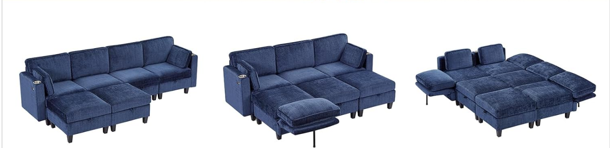
Image: The ONBRILL 110-inch U-Shaped Modular Sectional Sofa, showcasing its full configuration in blue chenille fabric.