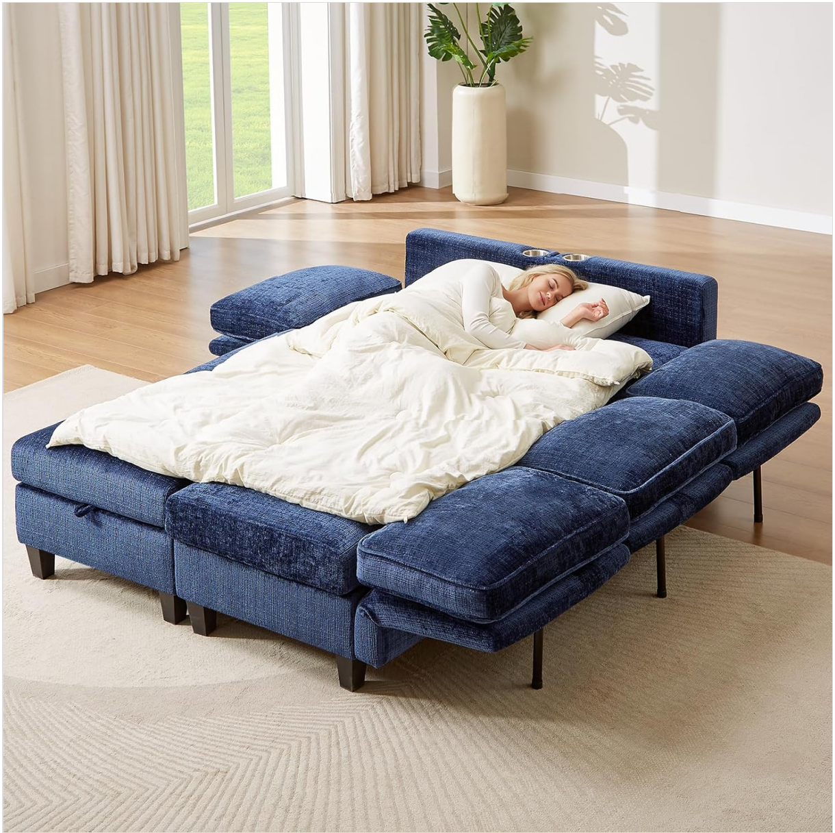
Image: The modular sofa fully extended into a sleeper bed, with a person resting on it.

Your browser does not support the video tag.