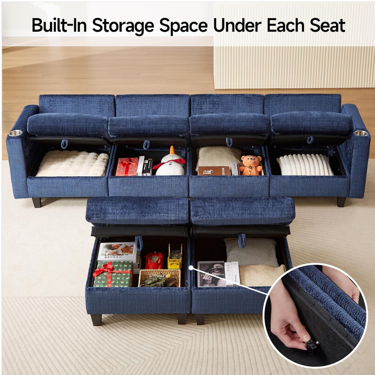
Image: View of the sofa with multiple seat cushions lifted, revealing the built-in storage space underneath each section.