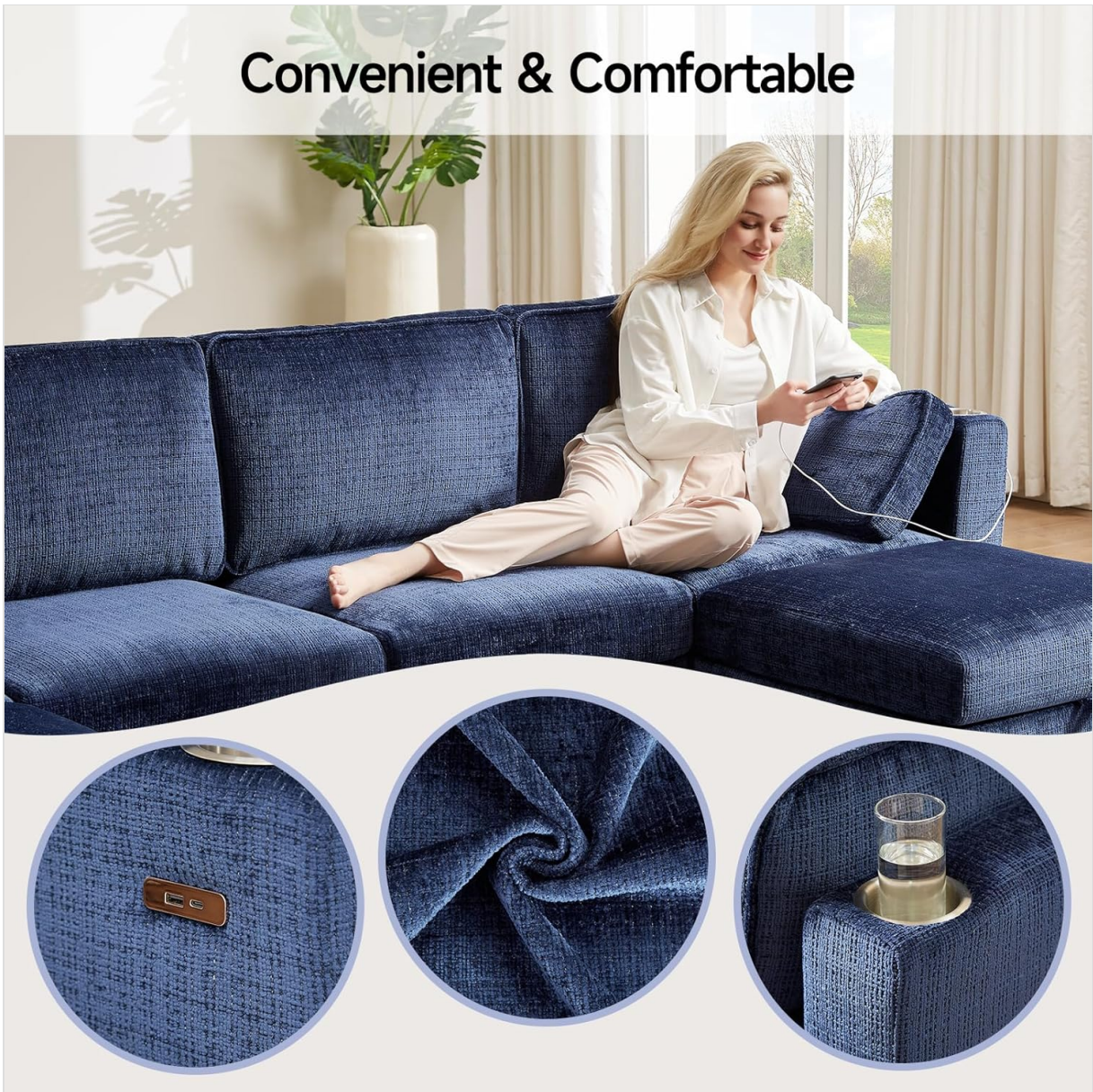
Image: Detailed view of the sofa's armrest, highlighting the integrated charging port and cup holder.