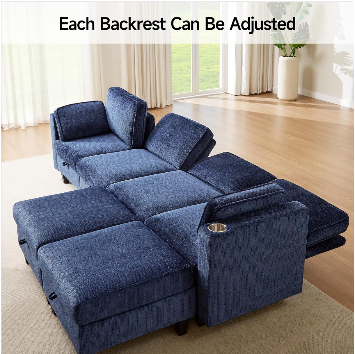
Image: Close-up view of a sofa backrest being adjusted, showing its multi-angle capability.