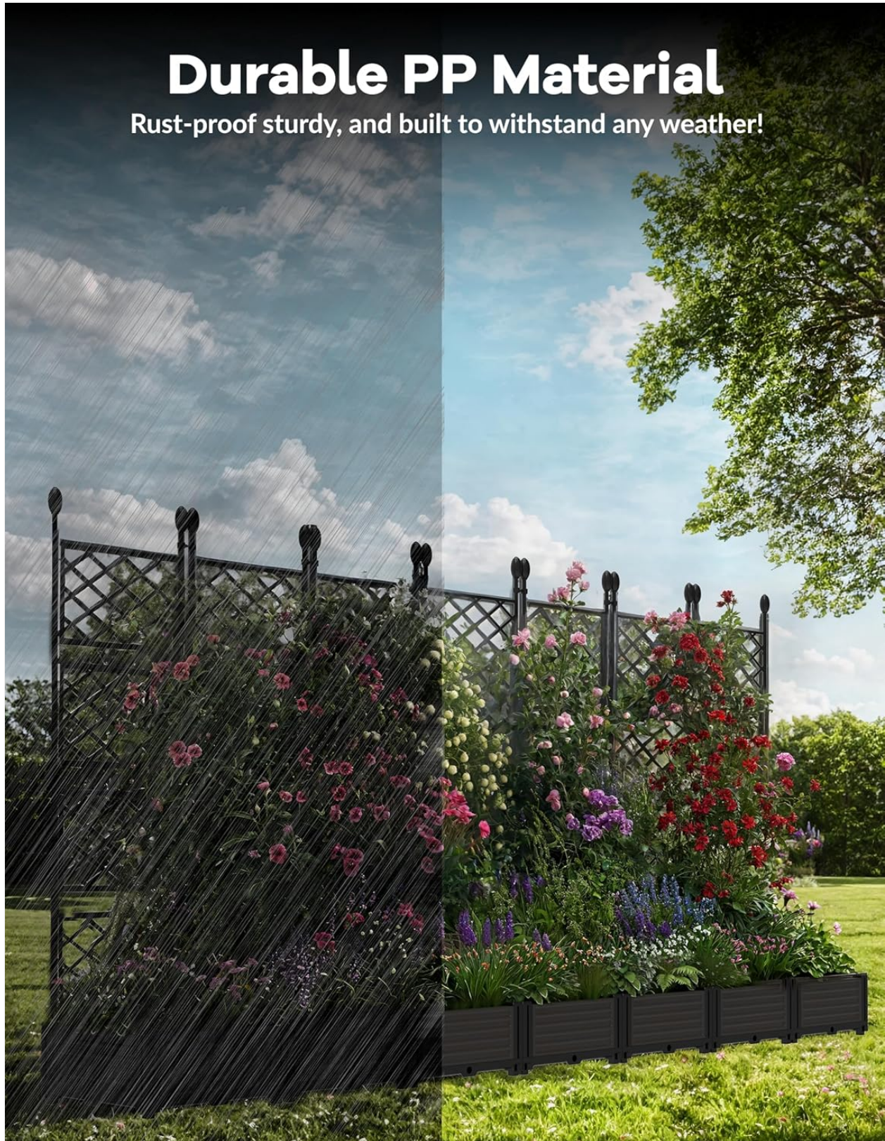
Image: Illustration of the durable PP material, showcasing its ability to withstand various weather conditions, from sunny to rainy.

The components are constructed from durable PP (Polypropylene) plastic, designed to be rust-proof, sturdy, and weather-resistant. This material ensures long-lasting performance in outdoor conditions without the maintenance associated with wood or iron.