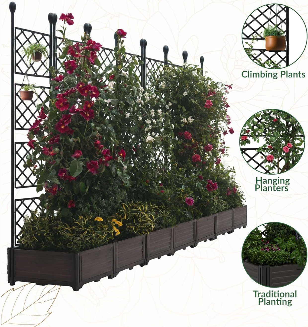
Image: The 3-in-1 multifunctional design, illustrating its use for climbing plants on the trellis, hanging planters, and traditional planting within the boxes.