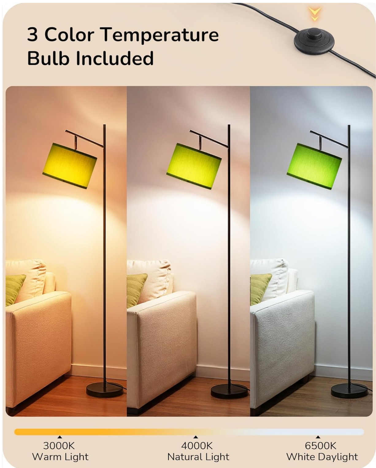
Figure 3: Demonstrating the 3 Color Temperature LED Bulb.

The lamp features a memory function that restores your last selected color temperature setting when turned back on.