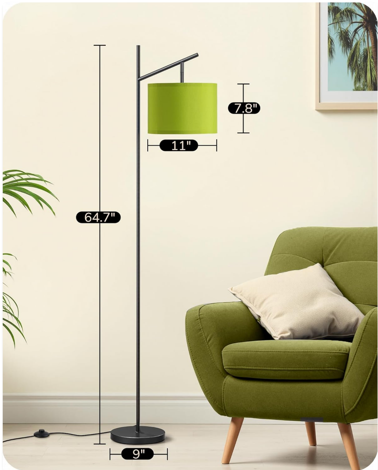
Figure 6: Product Dimensions.