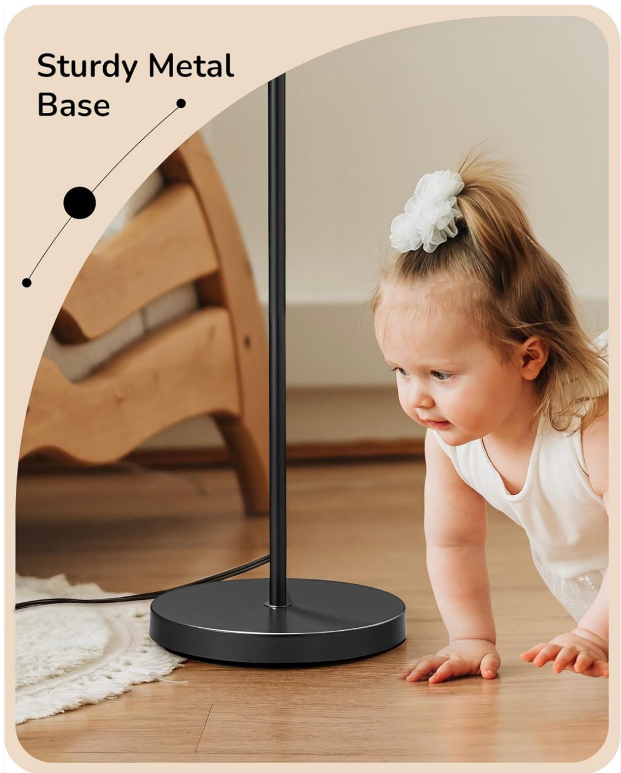
Figure 2: Sturdy Metal Base for enhanced stability.