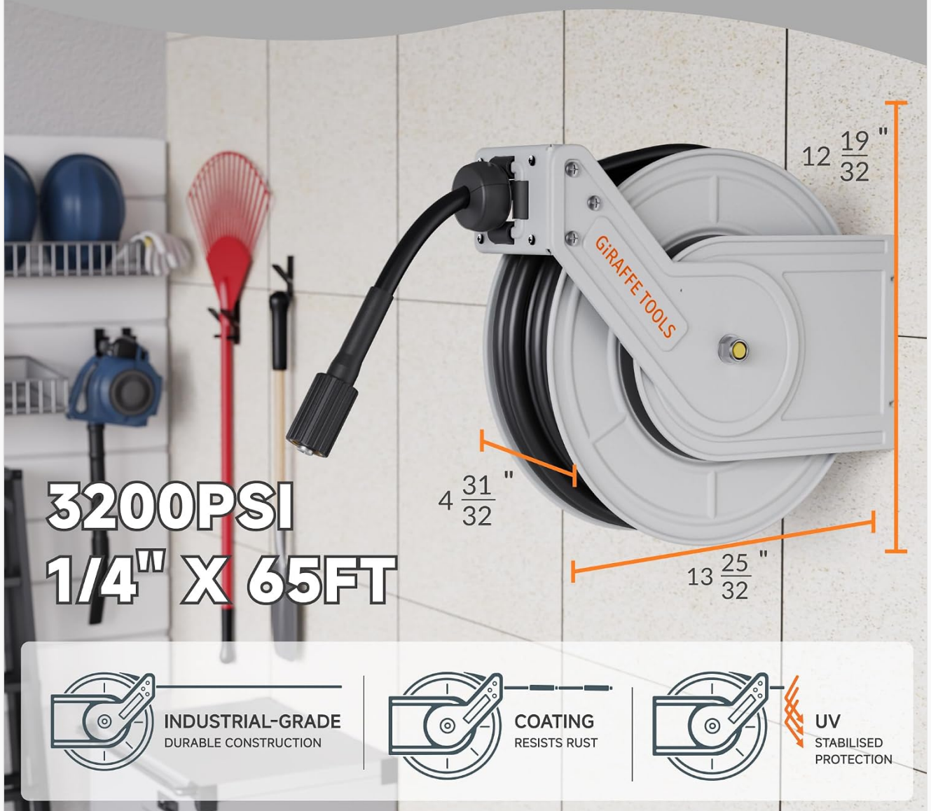
Image 5.2: The anti-abrasion design with non-sag rollers minimizes hose wear during retraction.