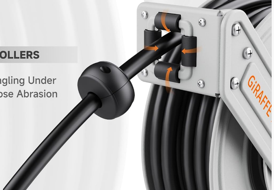
Image 5.3: The adjustable guide arm helps maintain proper hose alignment.

Resist Kinking And Tangling Under Pressure To Reduce Hose Abrasion