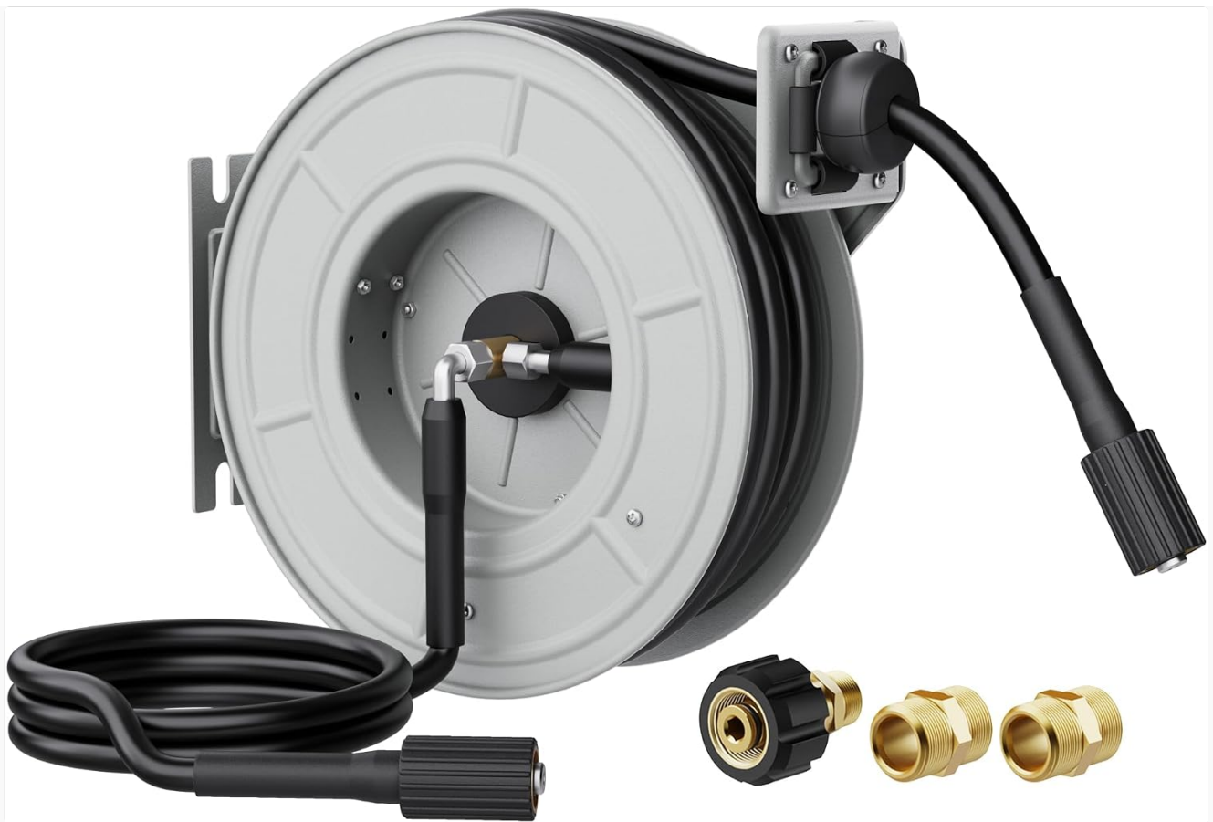
Image 1.1: The Giraffe Tools 65ft Pressure Washer Hose Reel, showcasing its compact design.