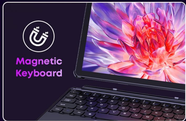
Image 2.1: Detachable accessories including the magnetic keyboard and adjustable stand case.