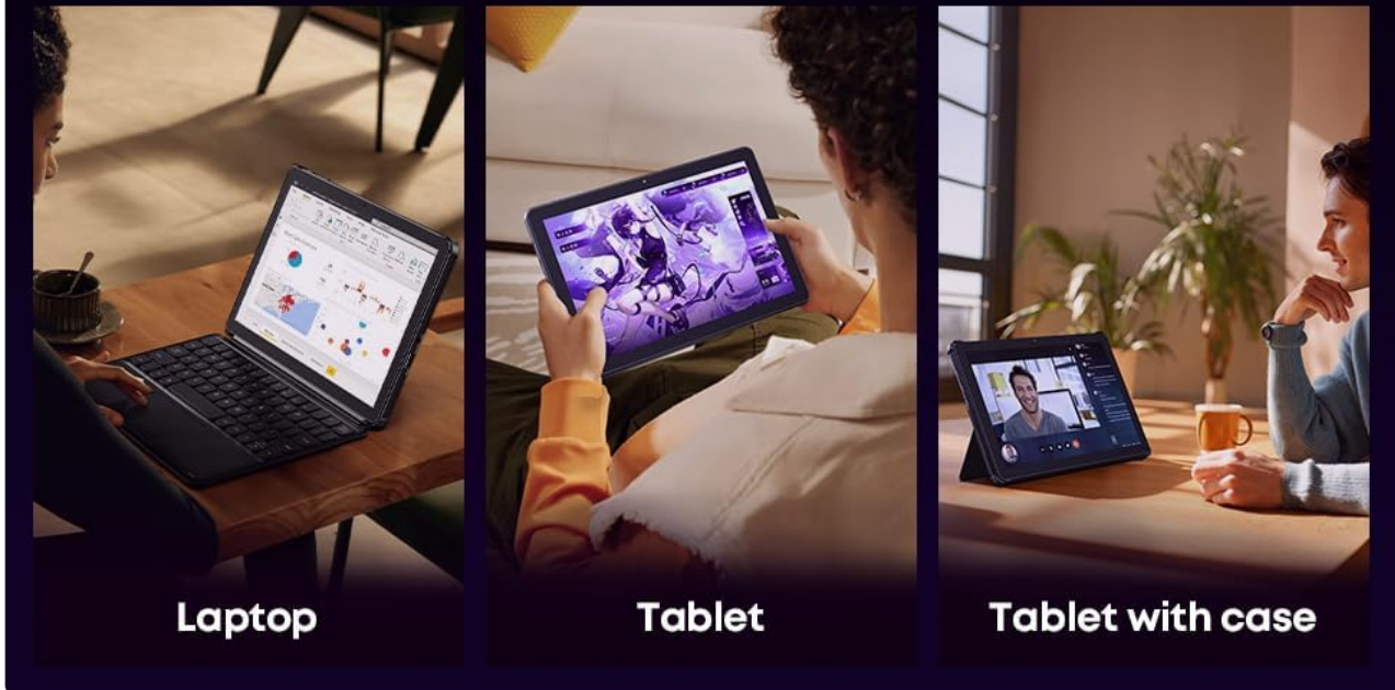
Image 3.2: Usage scenarios demonstrating laptop, tablet, and tablet with case modes.