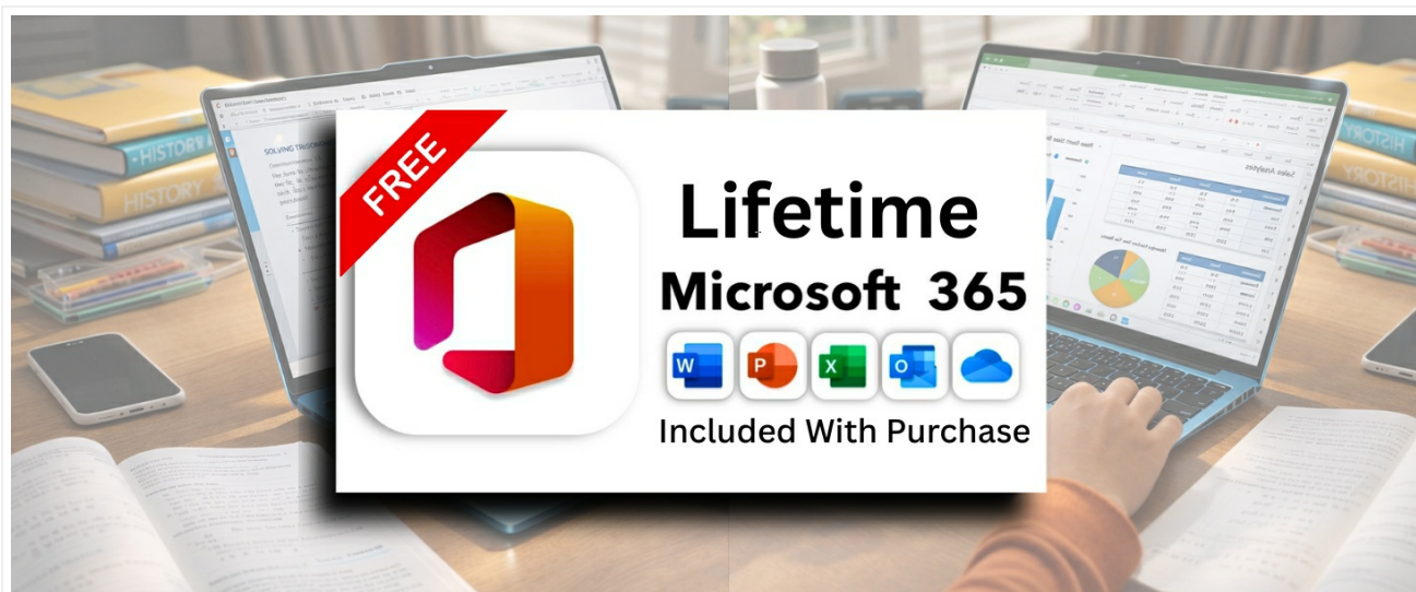
Figure 4.2: Microsoft 365 applications included with your laptop.