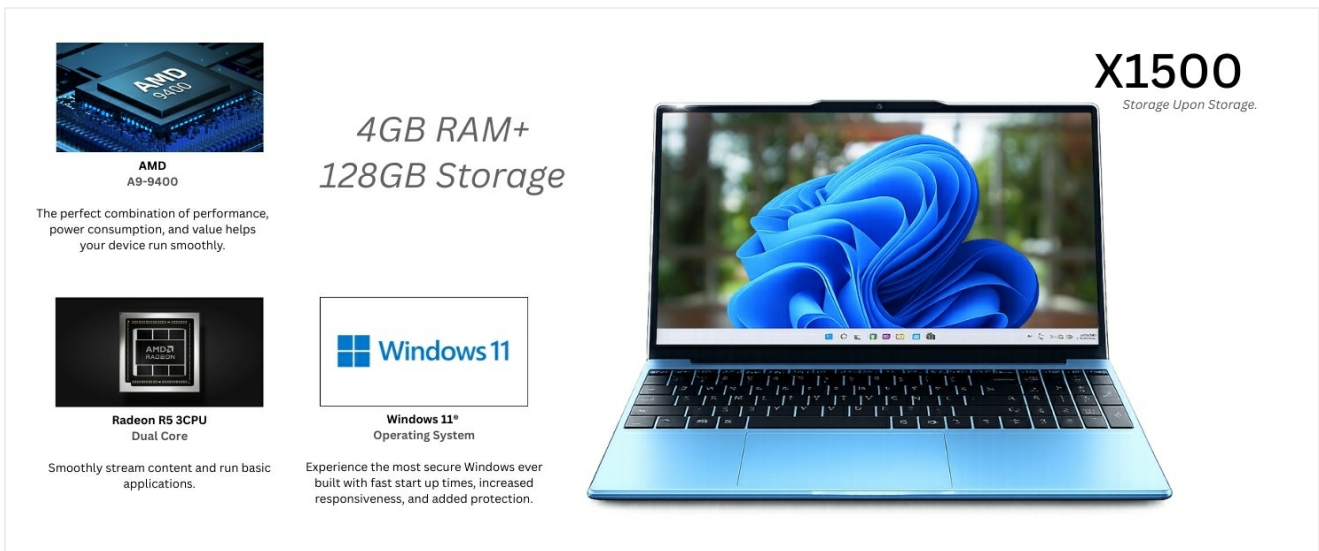
Figure 4.1: The Azpen X1500 running Windows 11.