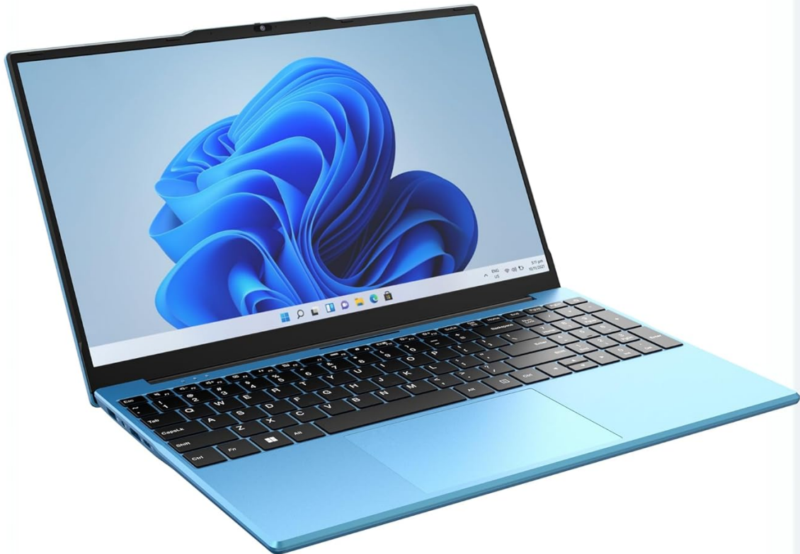
Figure 3.3: Right side of the laptop, featuring a headphone jack and an additional USB-A port.