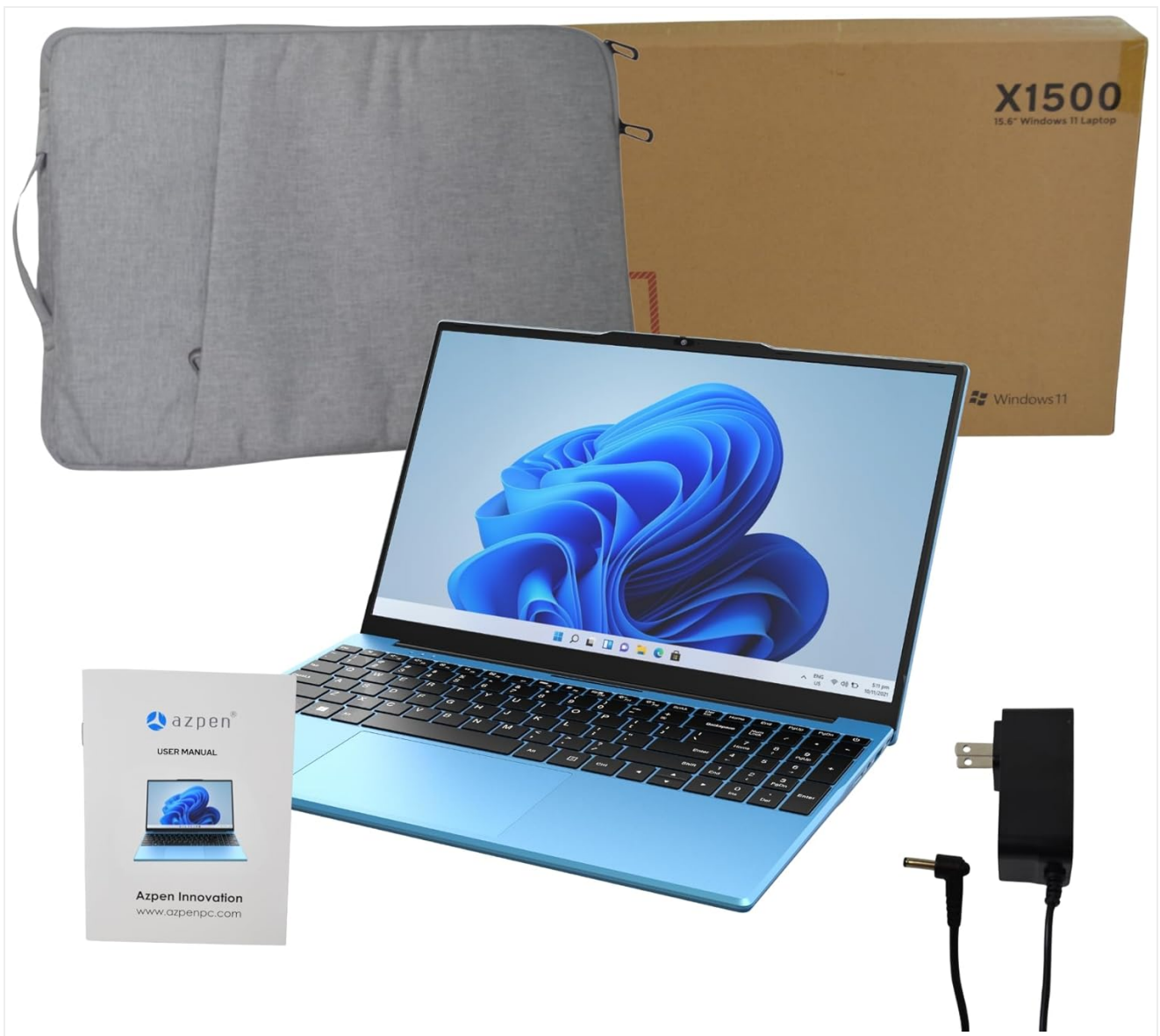
Figure 2.1: Contents of the Azpen X1500 package, including the laptop, power adapter, carrying case, and user manual.