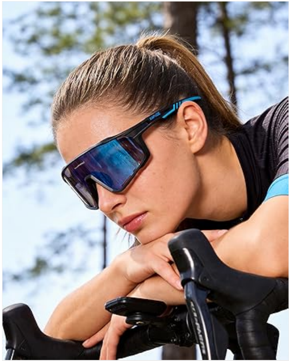
Image: Visual representation of photochromic lens adjusting its tint from light to dark based on UV exposure.

The photochromic lens automatically adjusts its tint based on the intensity of ultraviolet (UV) light. This means the lens will darken in bright sunlight (S4) and lighten in overcast conditions or at night (S1), providing optimal visibility without manual lens changes. This adaptation occurs seamlessly as light conditions change.