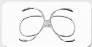
Image: Illustration of KAPVOE goggles designed to fit over prescription glasses (OTG compatible).