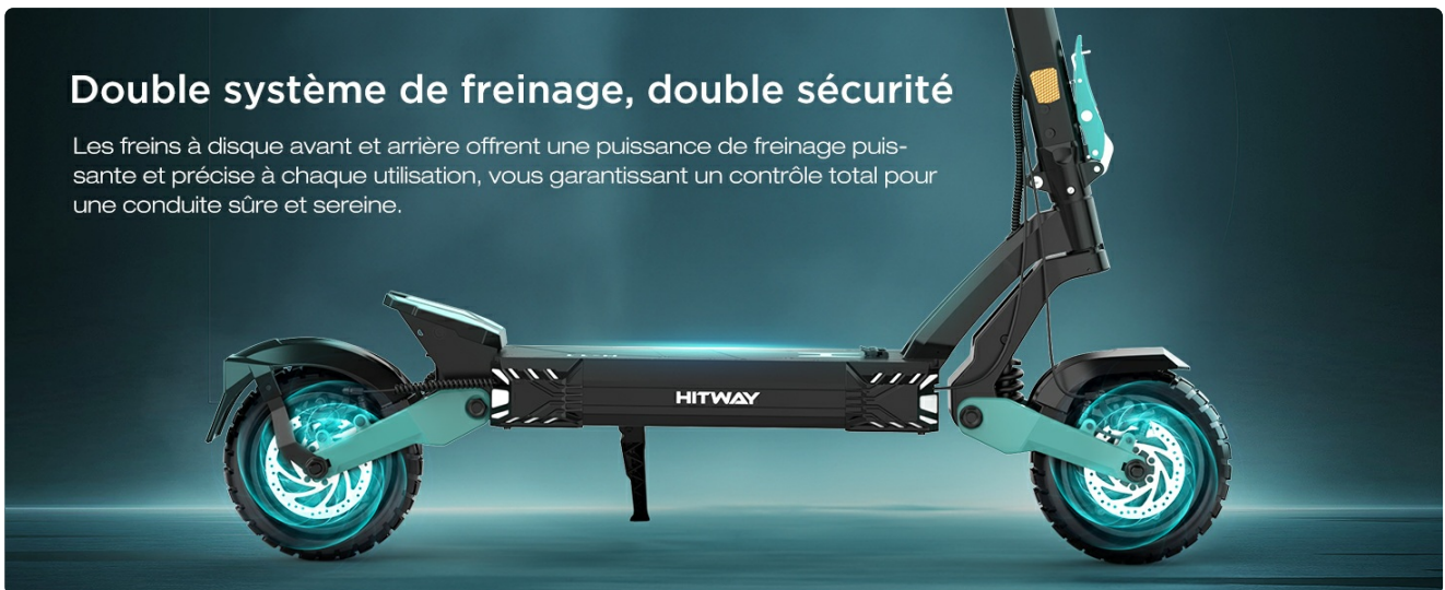
Image: This image highlights the dual disc braking system of the HITWAY H11, emphasizing its contribution to rider safety.

The HITWAY H11 features a dual disc braking system (front and rear) for responsive and reliable stopping power, ensuring total control and a safe ride.