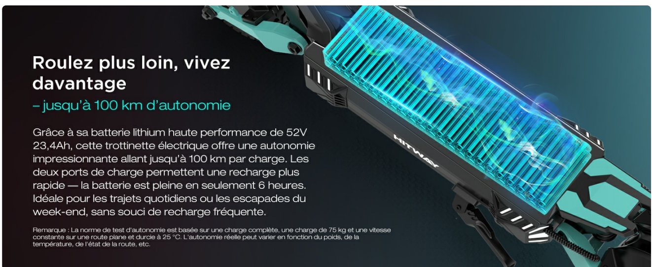
Image: This diagram shows the internal structure of the HITWAY H11's 52V 23.4Ah high-performance lithium battery, emphasizing its capacity for extended range.