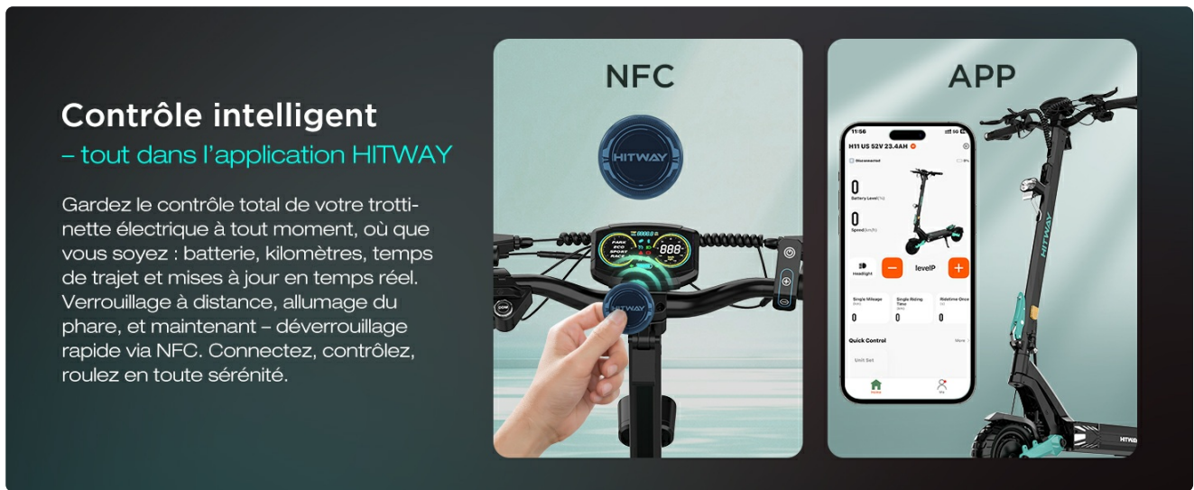
Image: This image displays the smart control interface, showing NFC unlock and mobile app connectivity options for the HITWAY H11 Electric Scooter.