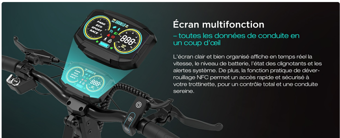
Image: A close-up of the HITWAY H11's multifunction display, showing speed, battery, mode, and other real-time riding data.