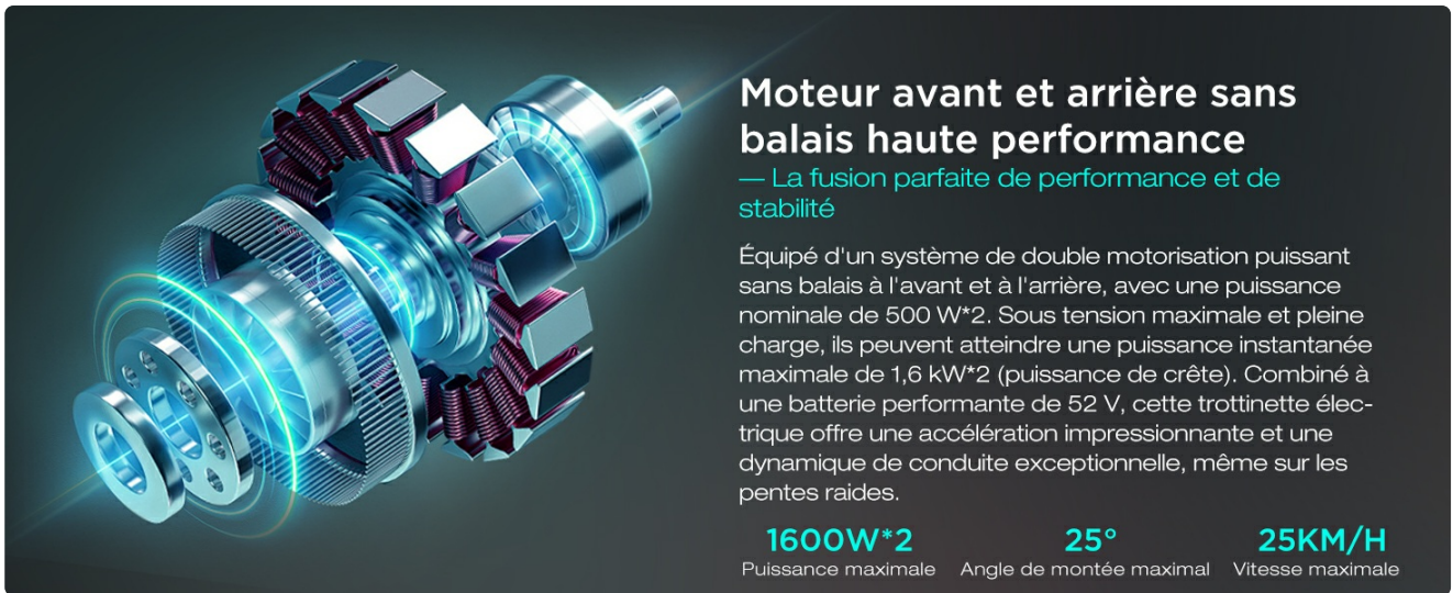
Image: Technical diagram illustrating the powerful dual 1600W motor system of the HITWAY H11, highlighting its performance capabilities.