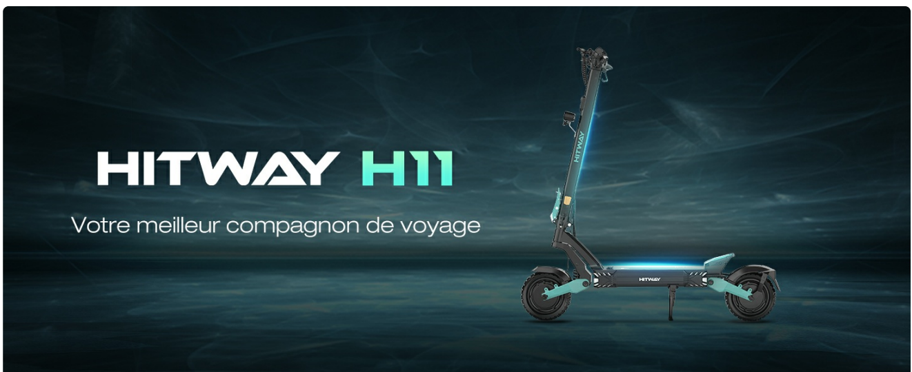
Image: HITWAY H11 Electric Scooter banner highlighting key features like speed, motor power, range, battery, load capacity, tire size, climbing angle, and IP rating.

The HITWAY H11 is a powerful electric scooter designed for both urban commuting and off-road adventures. It features dual 1600W motors, a 52V 23.4Ah battery offering up to 100 km of range, 10-inch tubeless all-terrain tires, dual disc brakes, and a dual suspension system for a comfortable ride. Smart features include NFC unlock and APP connectivity with a multifunction LED display.