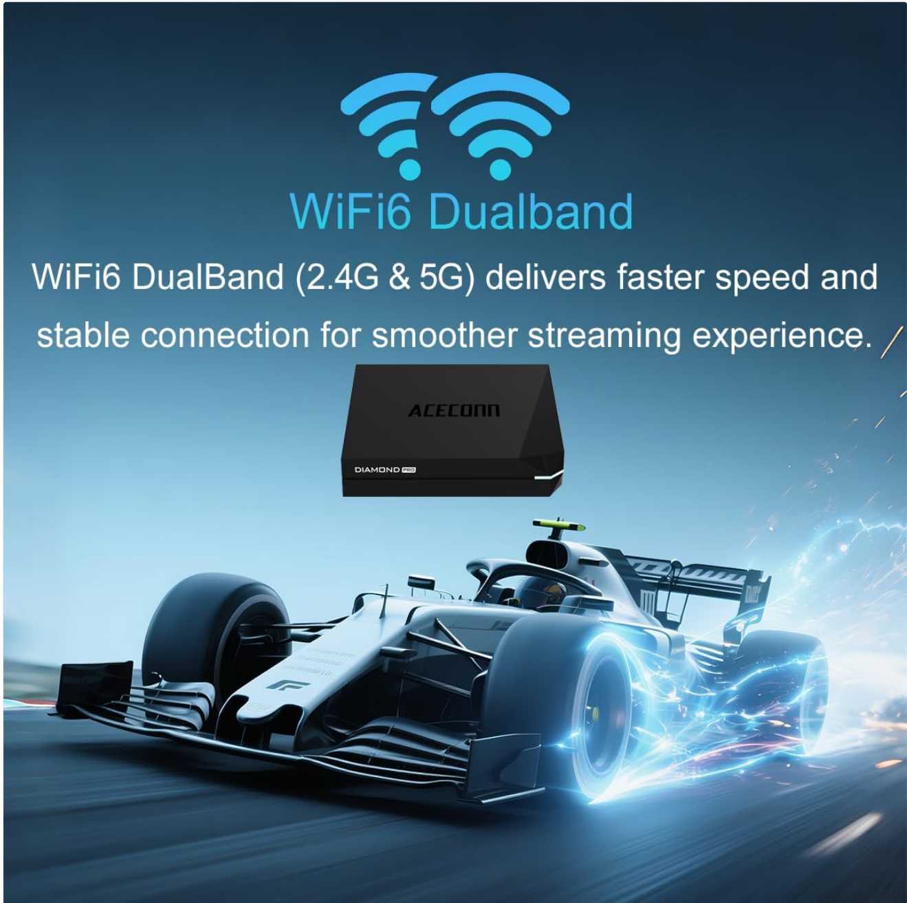
Image 8.1: Overview of key features and specifications for the ACECONN Diamond Pro TV Box, including Android 11 OS, 8K output, 2GB DDR4 RAM, 32GB EMMC Storage, HDR10+, Gigabit Ethernet, WiFi 6, AV1 Codec, and OTA updates.