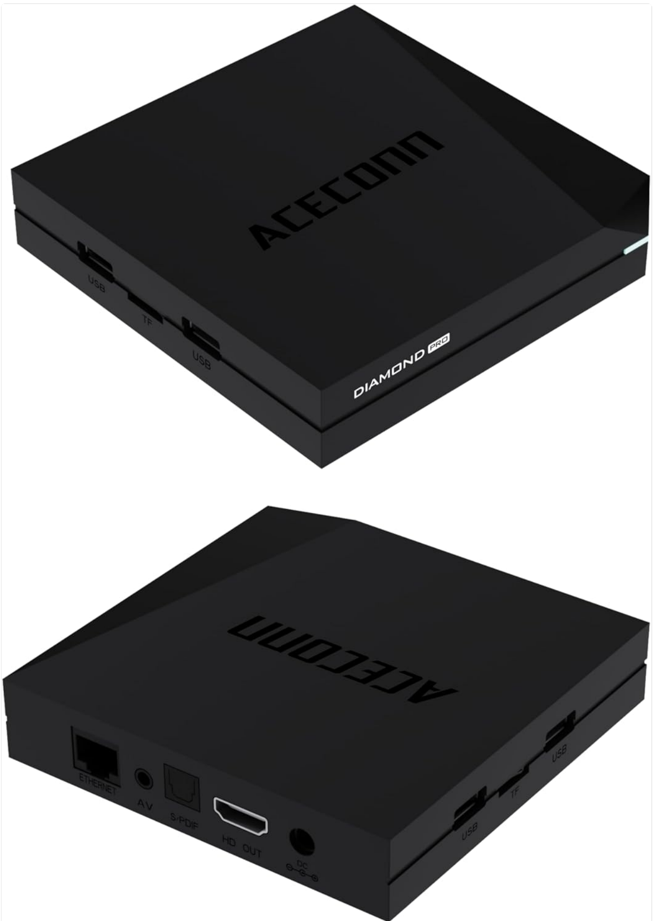
Image 1.1: Top view of the ACECONN Diamond Pro TV Box, showcasing its sleek design and branding.