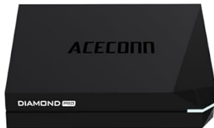
Diamond Pro TV Box