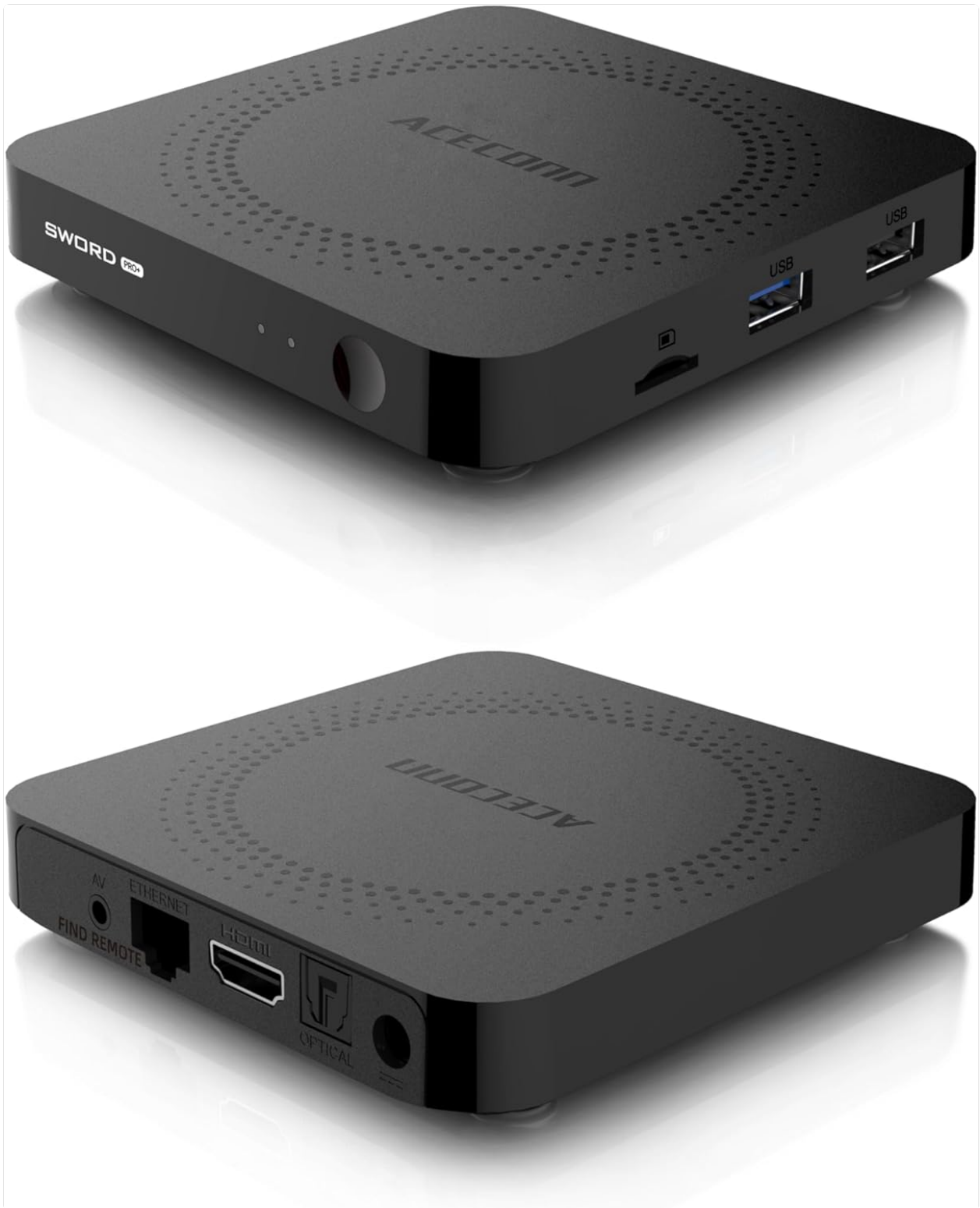
Figure 3.1: Front and Rear Views of the SWORD Pro+ TV Box. The front features an IR receiver and power indicator. The side includes USB 2.0, USB 3.0, and a MicroSD card slot. The rear panel provides AV, Ethernet, HDMI, Optical audio, DC power input, and a 'Find Remote' button.