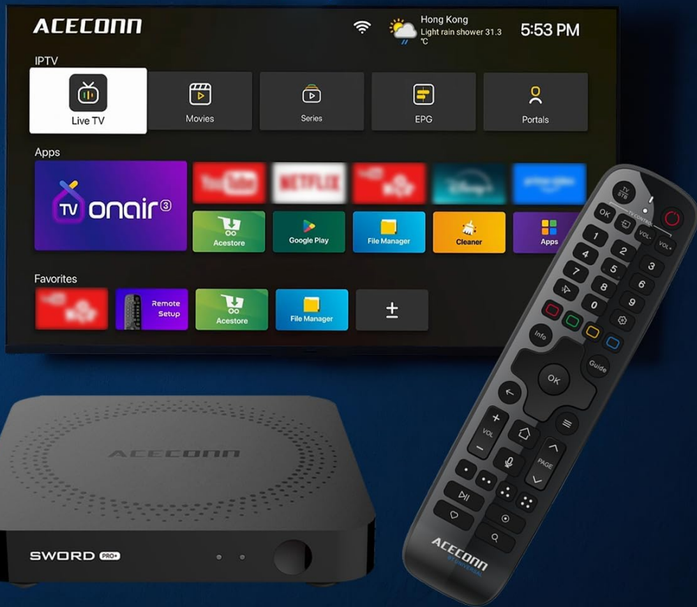
Figure 5.1: Dual-Band WiFi. The SWORD Pro+ supports both 2.4G and 5G WiFi for faster and more stable internet connectivity.