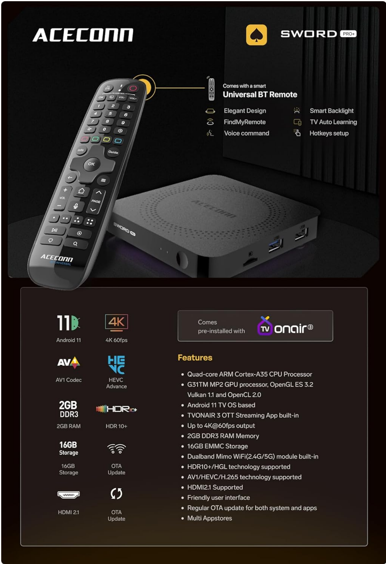
Figure 9.1: Key Features and Specifications. This image provides a visual summary of the device's capabilities, including Android 11, 4K 60fps, AV1 codec, 2GB DDR3 RAM, 16GB storage, HDMI 2.1, and the included smart Universal BT Remote with voice command and backlight.