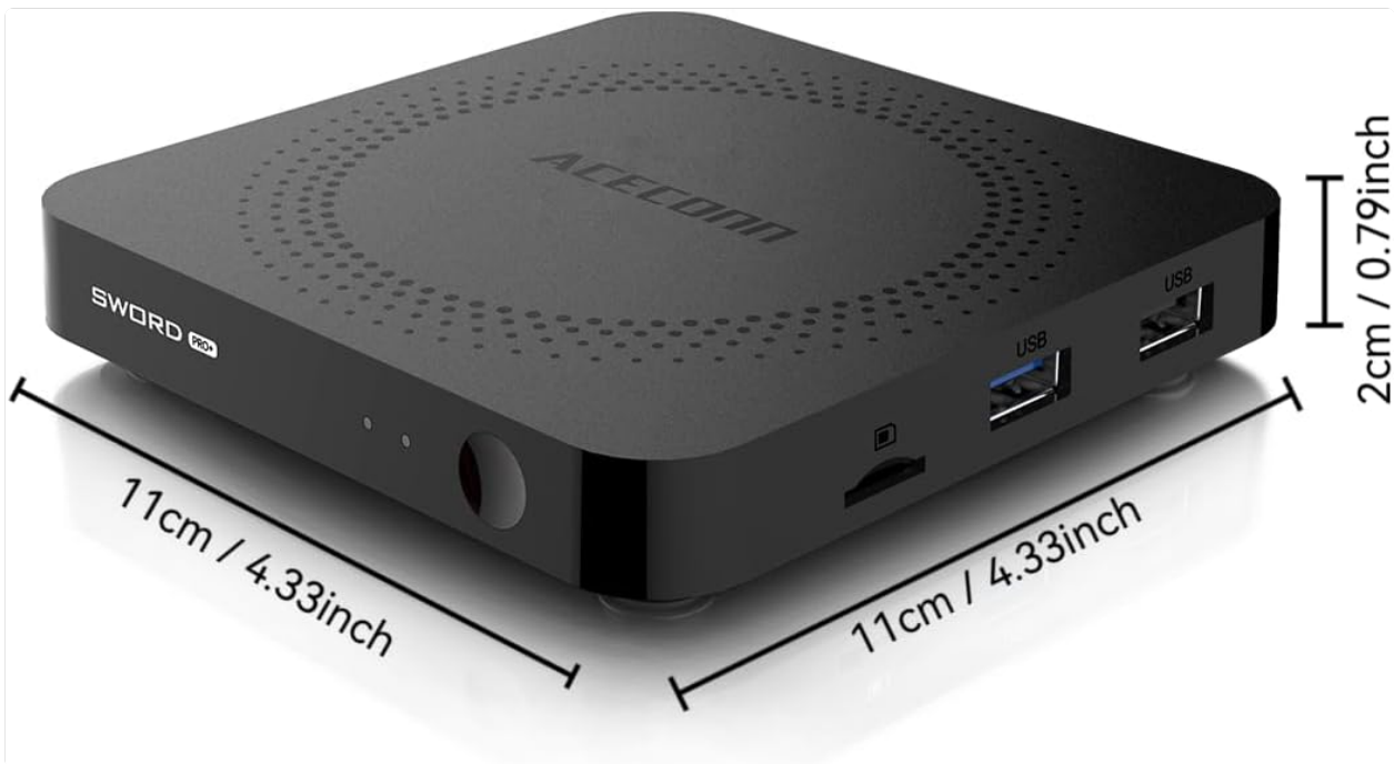
Figure 3.2: Device Dimensions. This image illustrates the length, width, and height of the SWORD Pro+ TV Box.