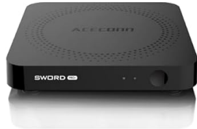
SWORD Pro+ TV Box