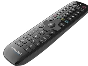
BT Voice Remote