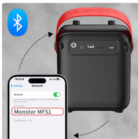
Image: Bluetooth pairing process on a smartphone.

Pair your speaker with a Bluetooth-enabled device to stream audio wirelessly.