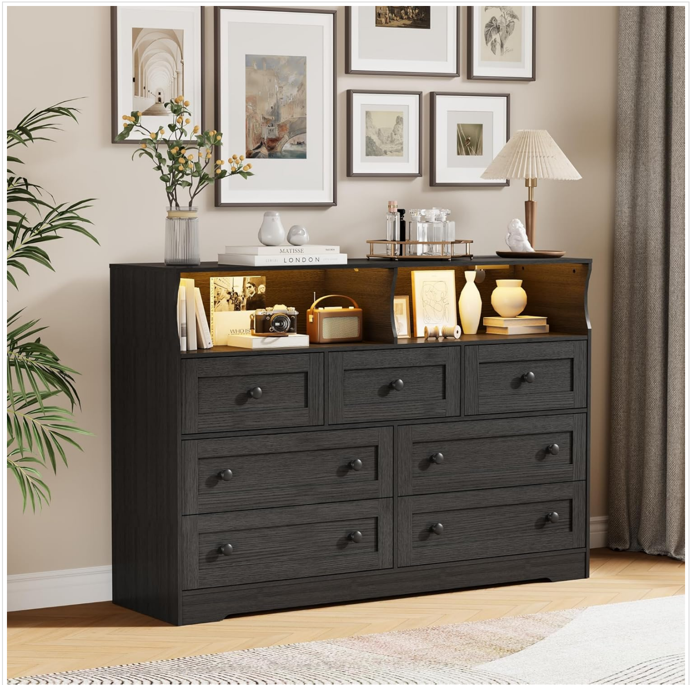
Figure 3: The LED lights provide functional brightness and decorative flair to the open storage areas.