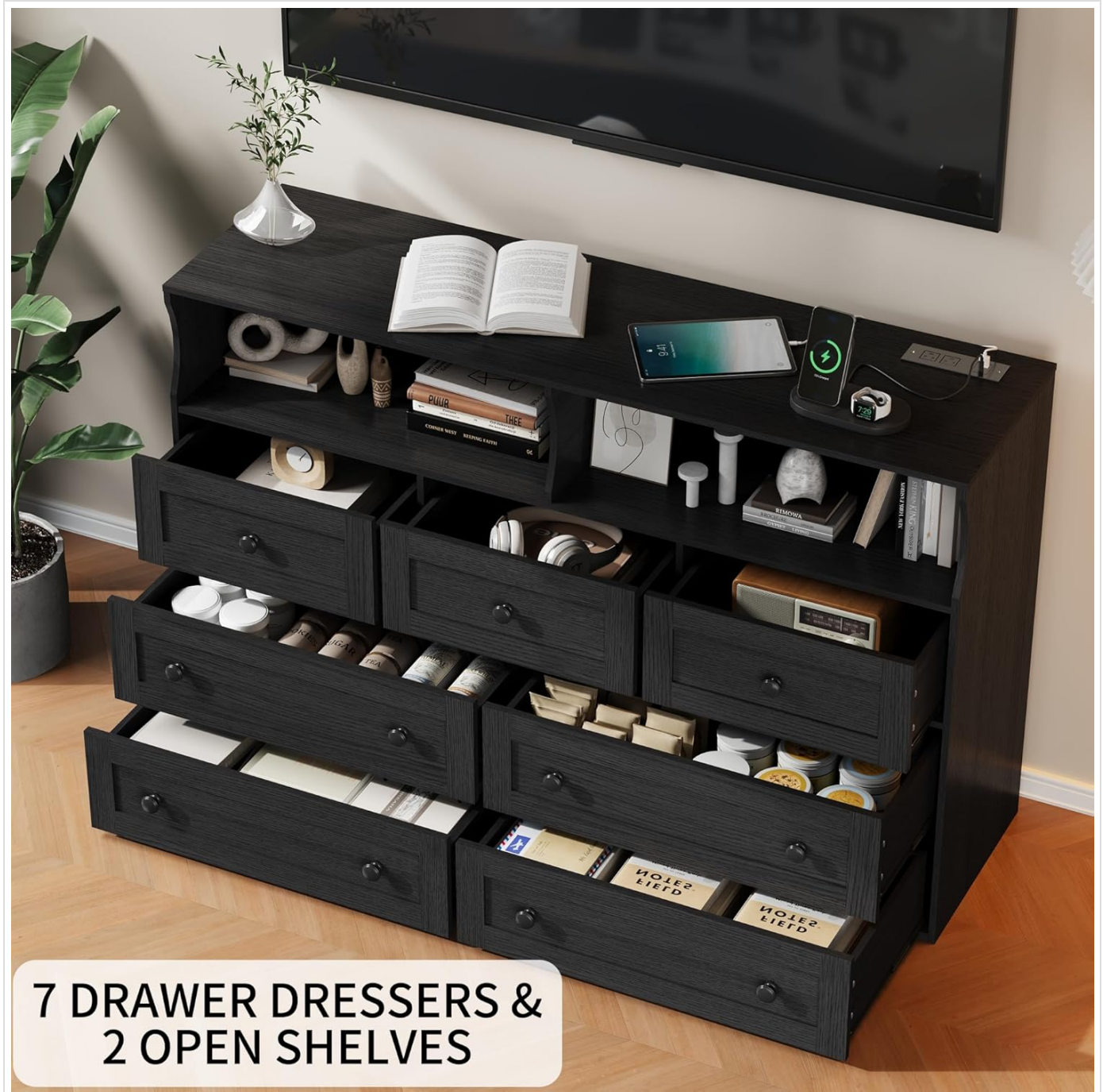
Figure 2: The dresser features seven drawers and two open compartments for versatile storage.