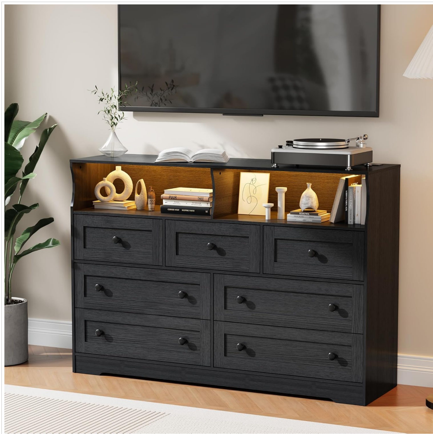
Figure 5: The integrated charging station provides convenient power for your devices.