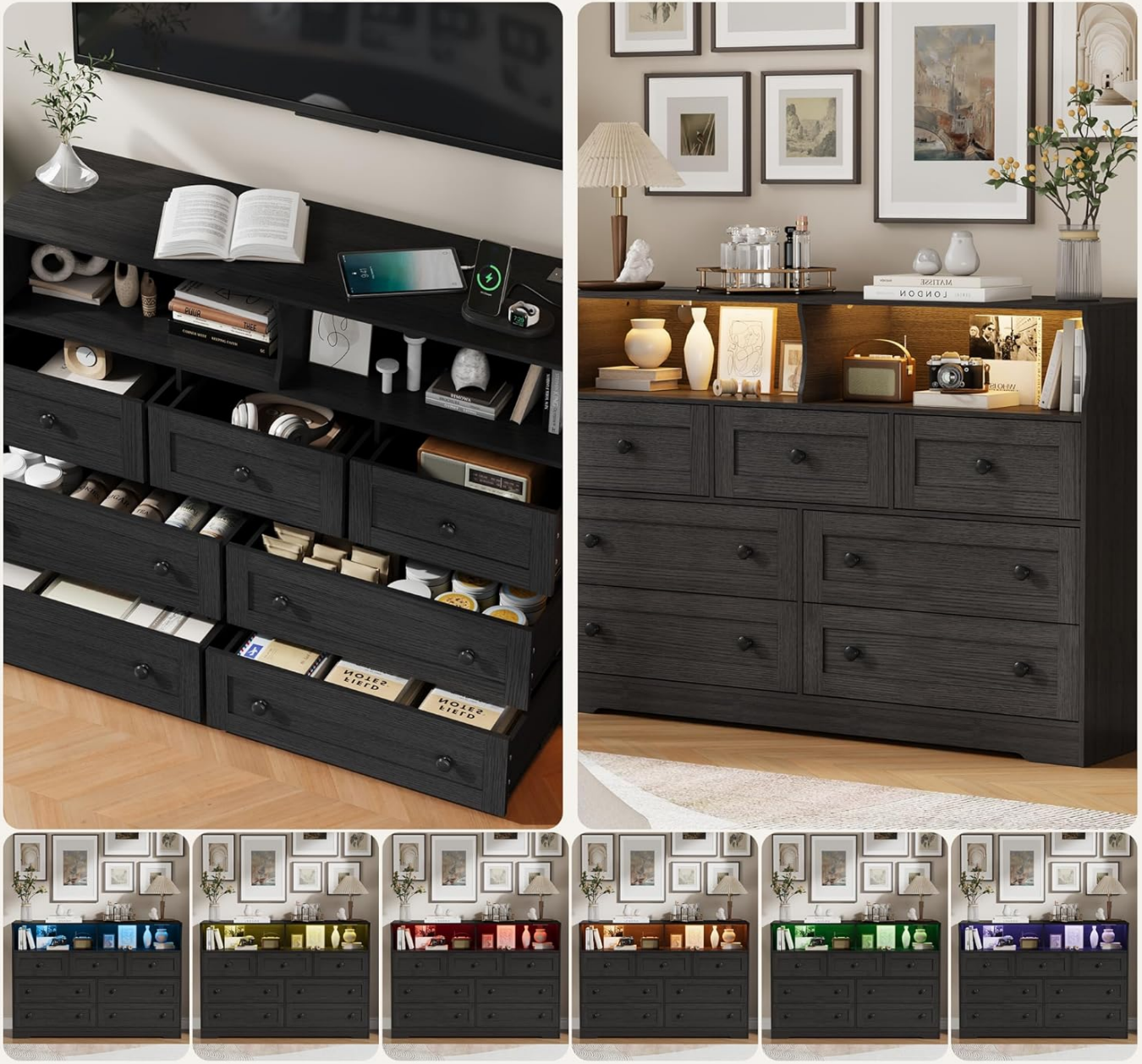
Figure 4: The adjustable RGB light strips allow for customization of the lighting ambiance.