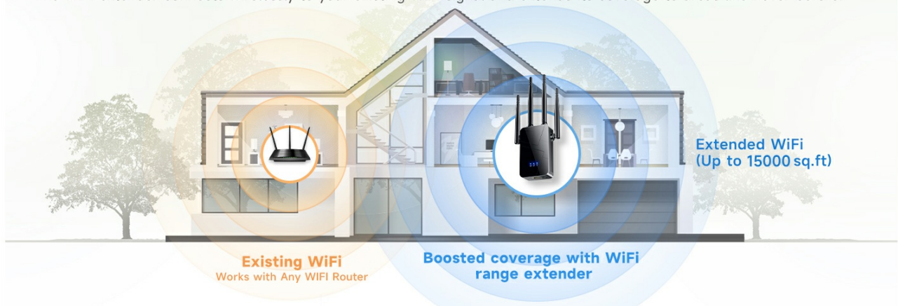
Image: A diagram illustrating how the WiFi booster extends the signal coverage within a house, reaching areas previously without strong WiFi.

No more worrying about low signal areas and enjoy a WiFi signal that can cover your entire home or office. The WiFi extender connects wirelessly to your existing WiFi signal and extends its coverage to areas like never before.