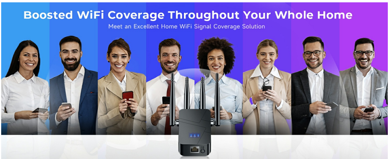
Image: People using various devices with a Baetaey WiFi Booster in the center, illustrating boosted WiFi coverage throughout a home.

The Baetaey WiFi Booster is designed to extend the coverage of your existing wireless network, eliminating dead zones and improving signal strength throughout your home or office. This device acts as a repeater, taking your current WiFi signal and rebroadcasting it to reach areas that previously had weak or no signal. It supports a 2.4 GHz radio frequency for reliable connectivity.