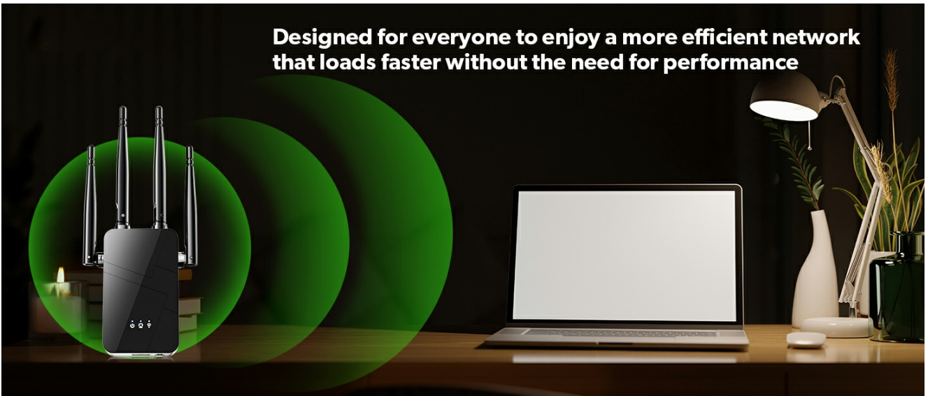
Image: A close-up of the Baetaey WiFi Booster, highlighting its design and antennas, ready for initial setup.

Designed for everyone to enjoy a more efficient network that loads faster without the need for performance