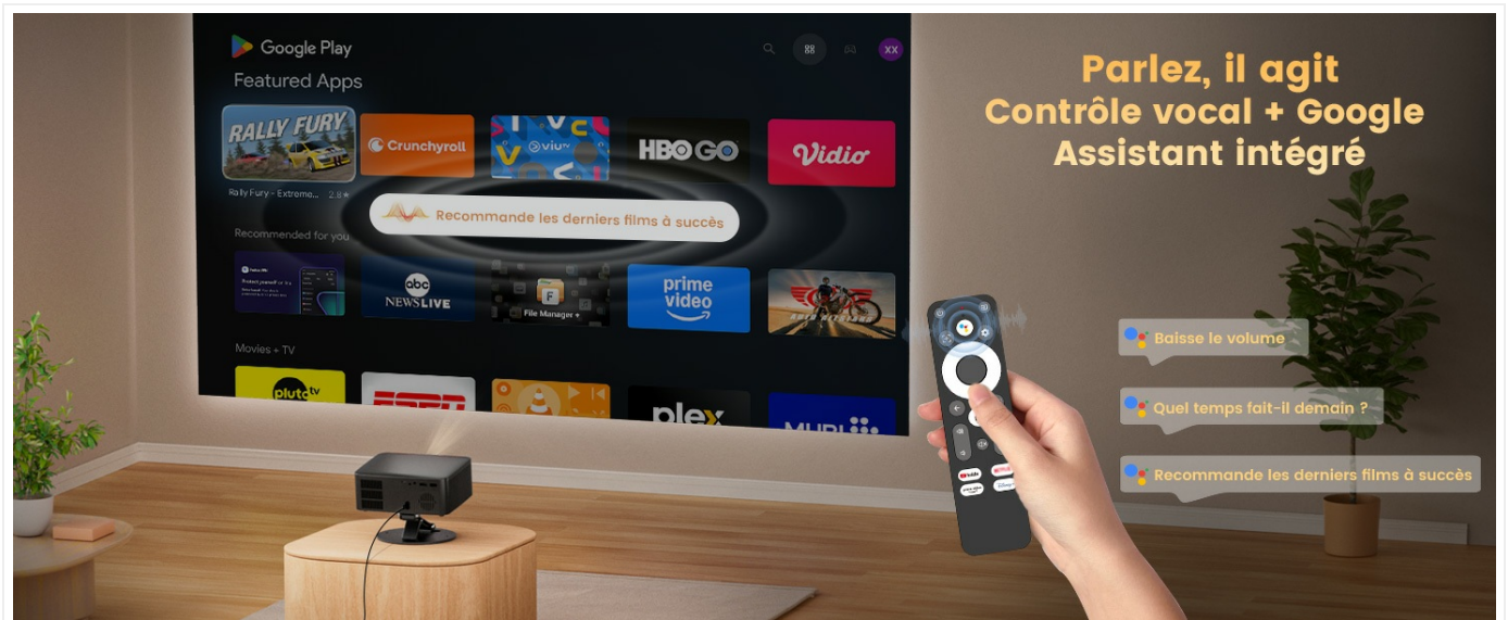
Image: The Jimveo J01Pro projector's Google TV interface with the remote control, highlighting voice control capabilities via Google Assistant.