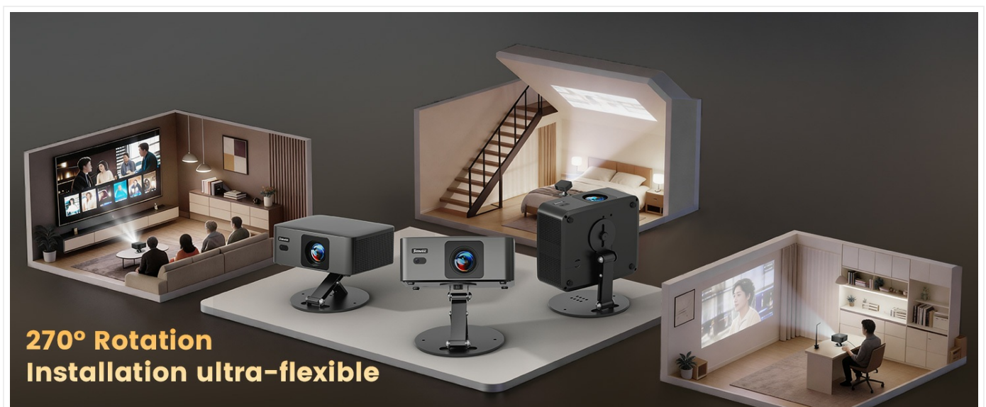
Image: The Jimveo J01Pro projector demonstrating its 270° rotation capability for ultra-flexible installation in various environments.