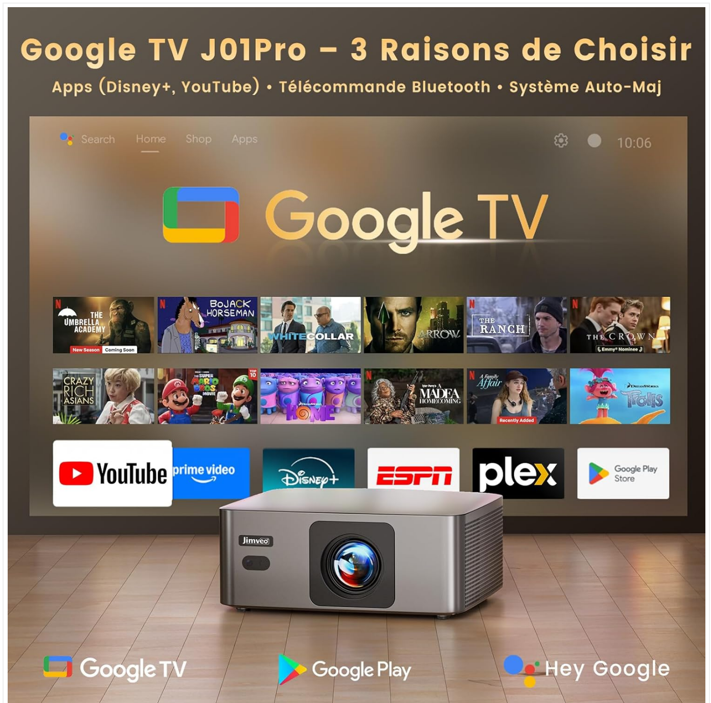
Image: Front view of the Jimveo J01Pro Projector mounted on its adjustable stand.