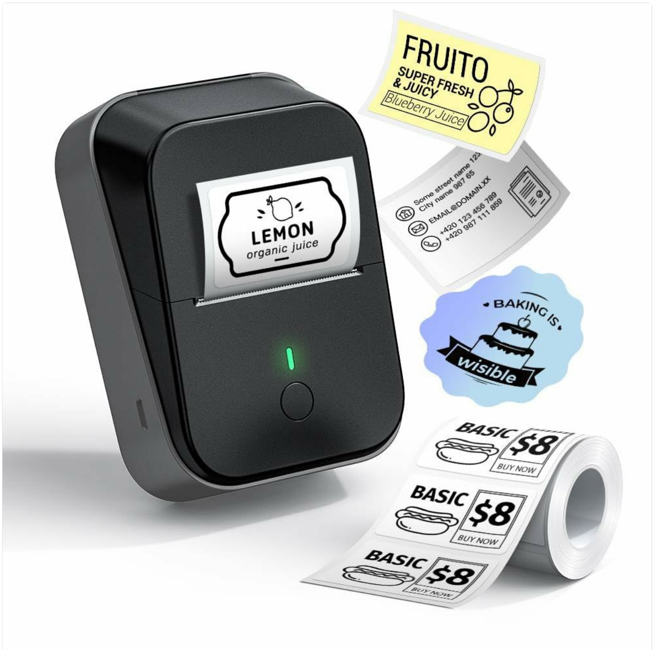
Image 1: CHIVALZ PM260 Wireless Label Maker Machine. This image displays the compact, dark grey label maker with its power button and label output slot.