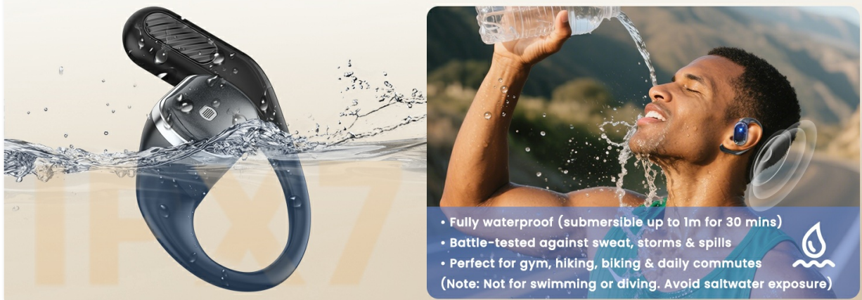
Figure 8.1: IPX7 Waterproof features.