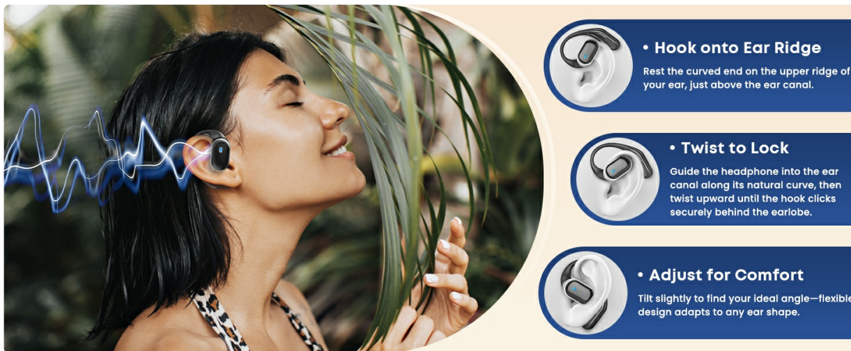
Figure 5.3: Open Air Conduction design for comfort.