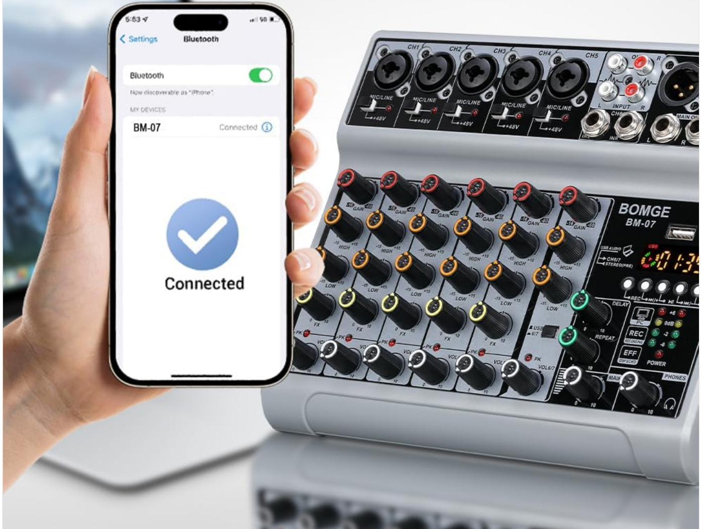
Image: The mixer's display indicating Bluetooth mode and a smartphone successfully paired with the BM-07.