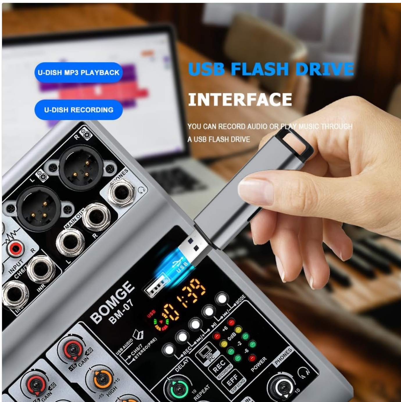
Image: The mixer's USB-A port with a flash drive connected, illustrating its function for both music playback and audio recording.