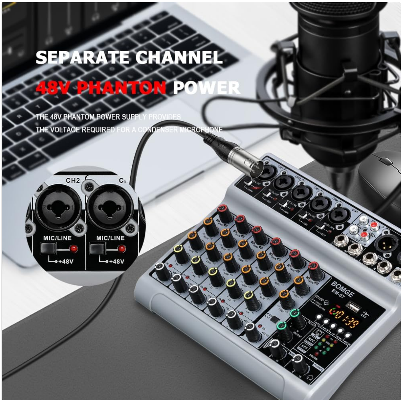
Image: Detail of the mixer's input section, highlighting the XLR/6.35mm combo jacks and the 48V phantom power switches for individual channels.

THE 48V PHANTOM POWER SUPPLY PROVIDES THE VOLTAGE REQUIRED FOR A CONDENSER MICROPHONE