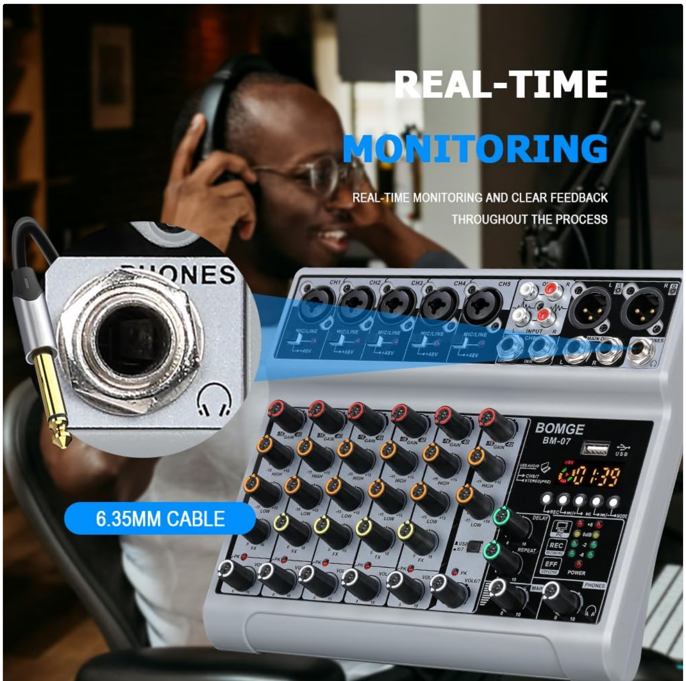
Image: The mixer's headphone output, showing a 6.35mm cable connected for real-time monitoring.