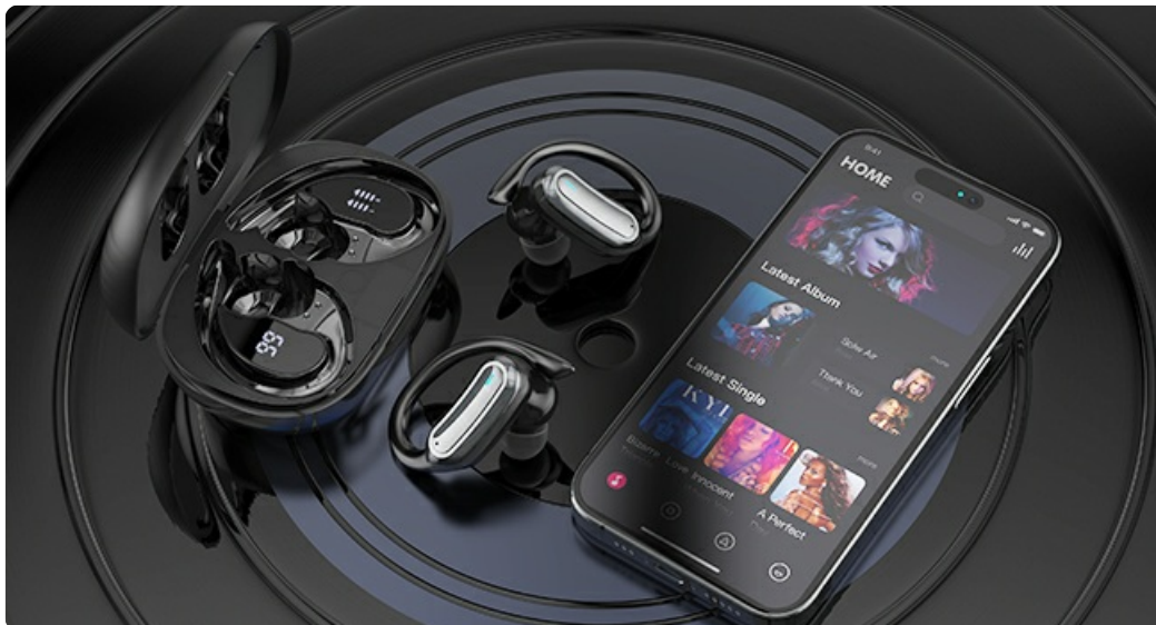
Image: Illustration of the earbuds and charging case, highlighting 54 hours total playtime with the case, 6 hours single earbud playtime, and Type-C fast charging.