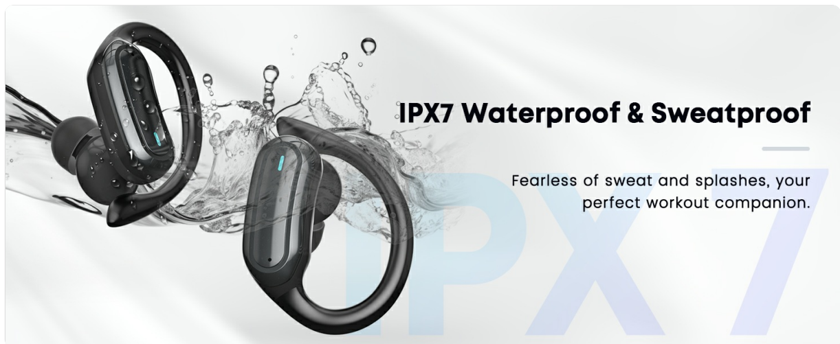
Image: The TRAUSI i27 earbuds shown with water splashes, indicating their IPX7 waterproof and sweatproof capabilities.

Important Note: IPX7 rating does not mean the earbuds are suitable for swimming, showering, or prolonged submersion in water. The charging case is not waterproof.