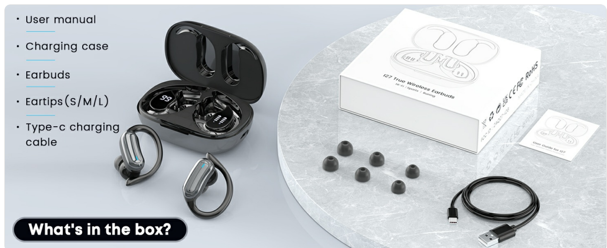
Image: Contents of the TRAUSI i27 Wireless Earbuds package, including earbuds, charging case, Type-C cable, and various eartip sizes.