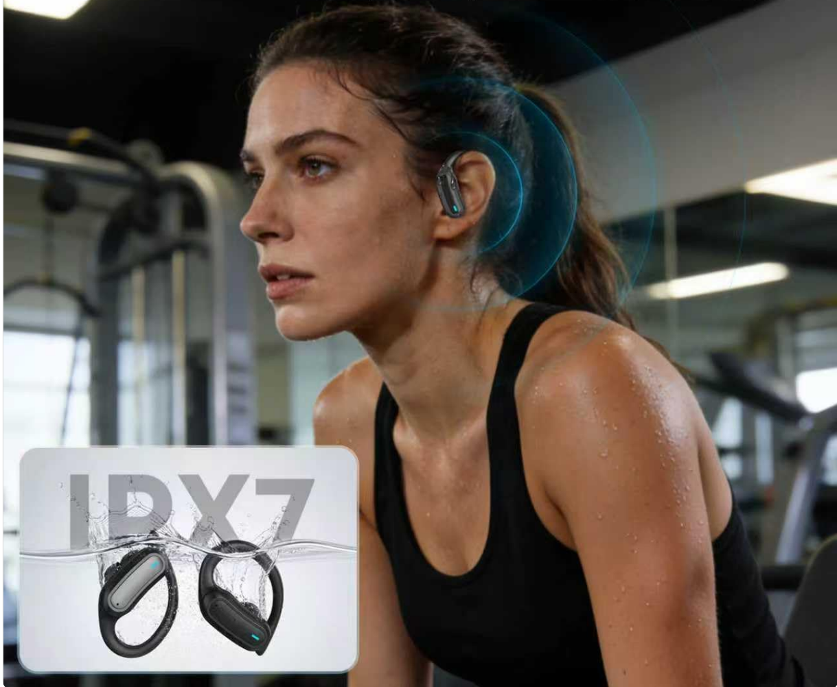
Image: The TRAUSI i27 earbuds partially submerged in water, illustrating their IPX7 water resistance.

IPX7 defense against sweat, rain, and splashes — perfect for workouts and daily use