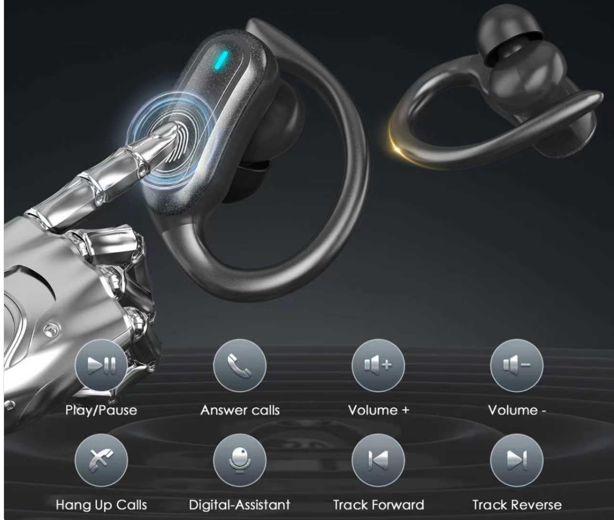
Image: A detailed view of the TRAUSI i27 earbud, indicating the smart touch control area for various functions.

Enjoy Effortless Listening with Stable Connection & Smart Touch