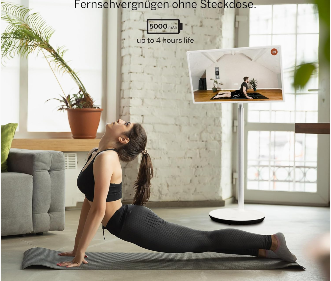
Image: A woman performing yoga, with the THOMSON Go TV in the background displaying an exercise video. An overlay indicates '5000 mAh' and 'up to 4 hours life', highlighting the TV's portability and battery duration.

The integrated battery provides up to 4 hours of viewing time, allowing you to enjoy entertainment anywhere without a power outlet. The base wheels facilitate easy movement between rooms.