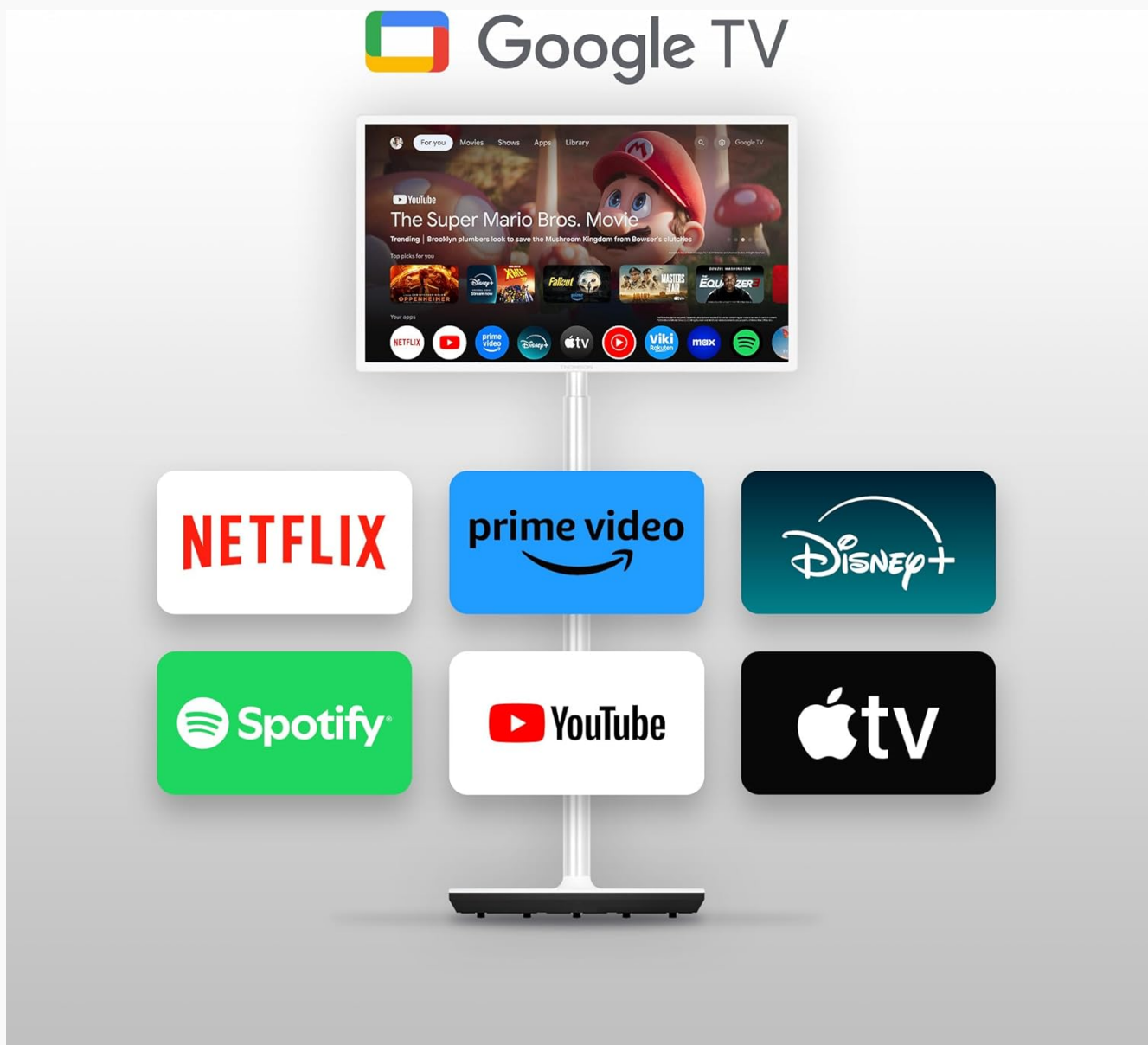
Image: The THOMSON Go TV screen showing the Google TV home screen with various streaming service icons like Netflix, Prime Video, Disney+, Spotify, YouTube, and Apple TV.

Google TV organizes content from your streaming services into a unified, personalized interface. You can create multiple user profiles, each with customized recommendations.