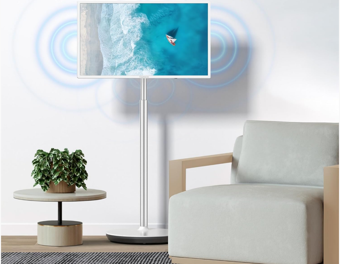
Image: The THOMSON Go TV displaying a beach scene, with the Dolby Audio logo and animated sound waves emanating from the screen, illustrating its audio capabilities.

Experience high-quality sound with integrated 16W speakers and Dolby Audio support.