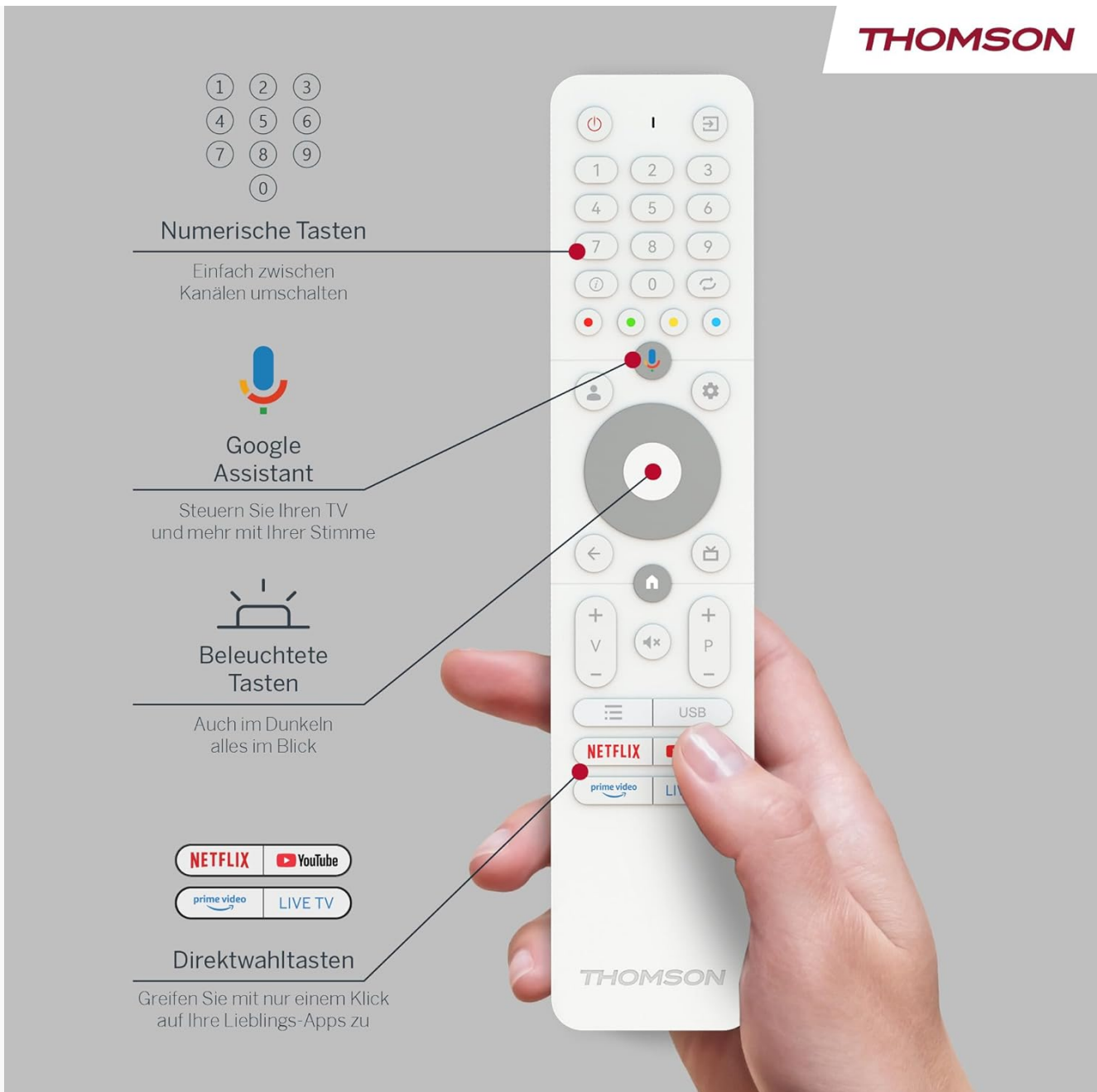
Image: The remote control for the THOMSON Go TV, showing numeric keys, Google Assistant button, illuminated keys, and direct access buttons for streaming services.

The remote control allows full navigation and control of your TV. It features: