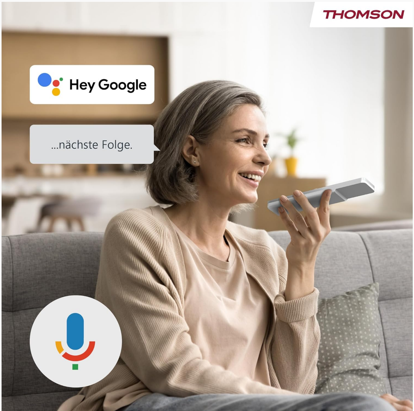
Image: A woman speaking into the remote control, with a 'Hey Google' speech bubble and the Google Assistant logo, demonstrating voice control functionality.

Press the Google Assistant button on your remote control and speak your commands. You can search for content, ask for recommendations, control smart home devices, and more.