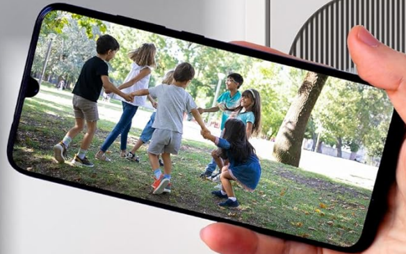
Image: A smartphone screen showing content being cast to the THOMSON Go TV, with the Google Cast logo indicating the feature. Use Google Cast to wirelessly stream content from compatible devices (smartphones, tablets, computers) directly to your TV screen.