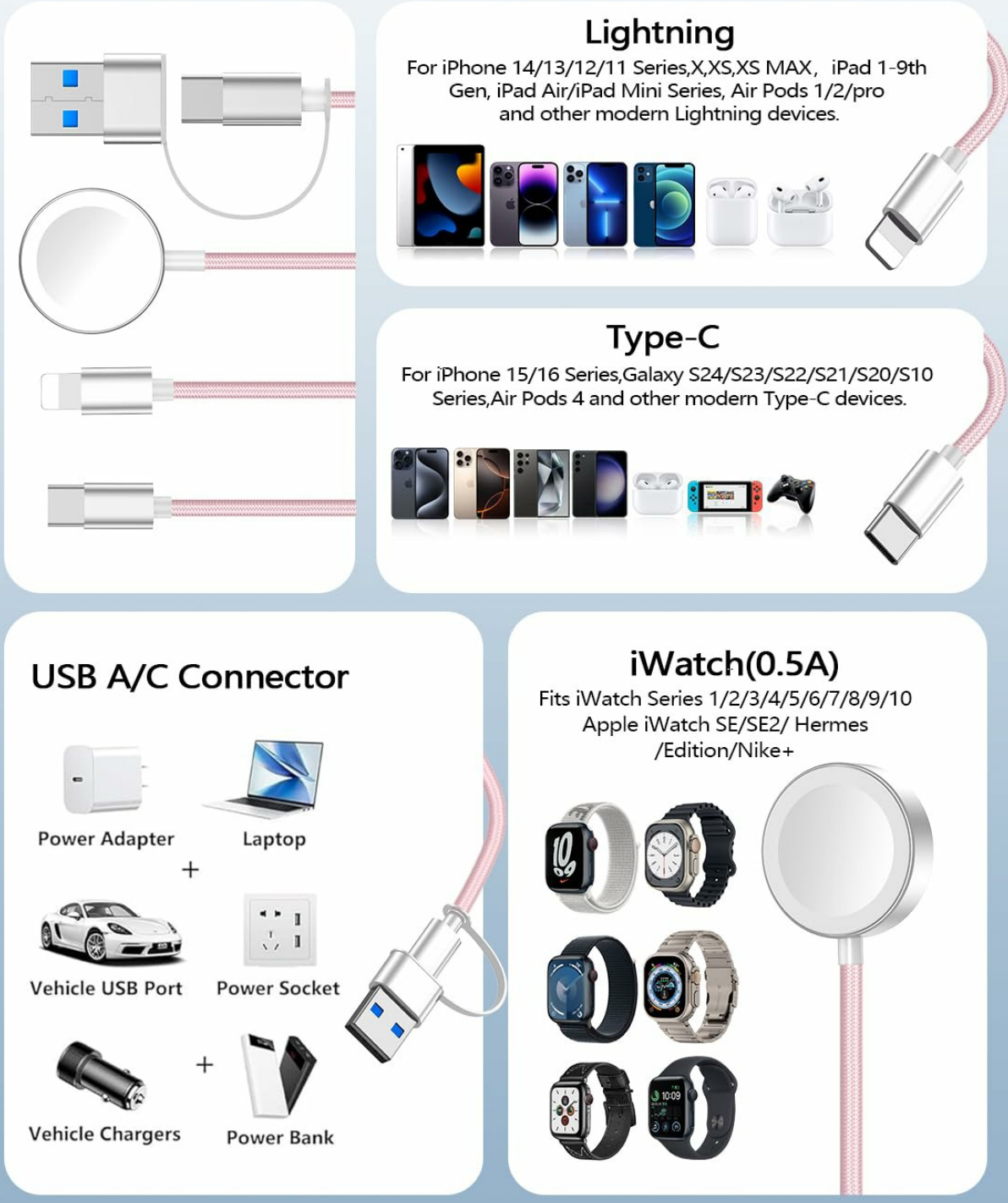
Figure 4: Connecting the cable to various power sources.

4 Different Output for Charging Share with All Devices