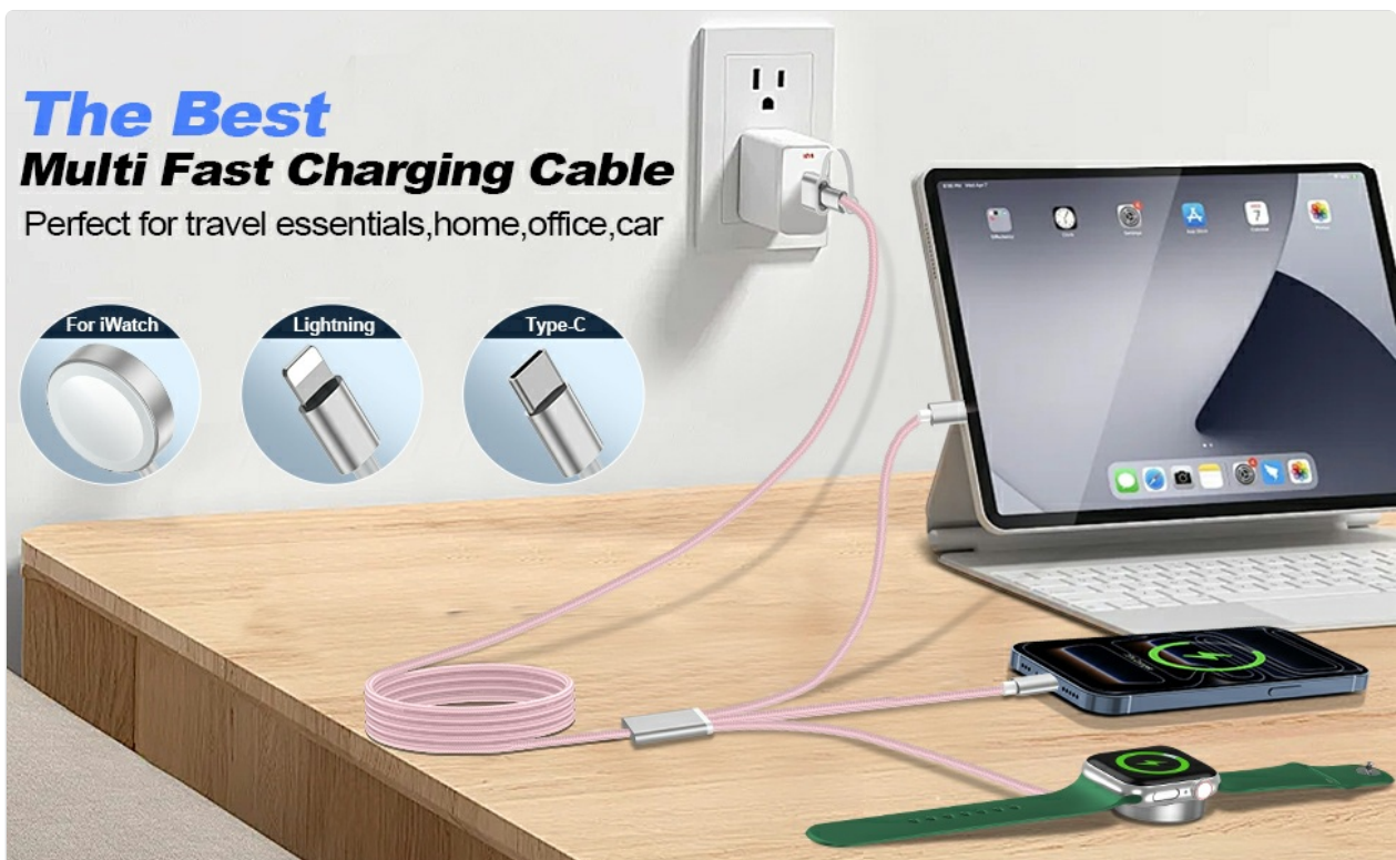
Figure 1: Overview of the xiwxi 3-in-2 Multi-Charging Cable outputs and dual input.

The xiwxi 3-in-2 Multi-Charging Cable (Model: iw96458) is a versatile and portable charging solution designed to power multiple devices simultaneously. This cable features a USB-A/USB-C input and provides Lightning, Type-C, and magnetic Apple Watch charging outputs. It is ideal for travel, home, office, and car use, offering convenience and reducing cable clutter.