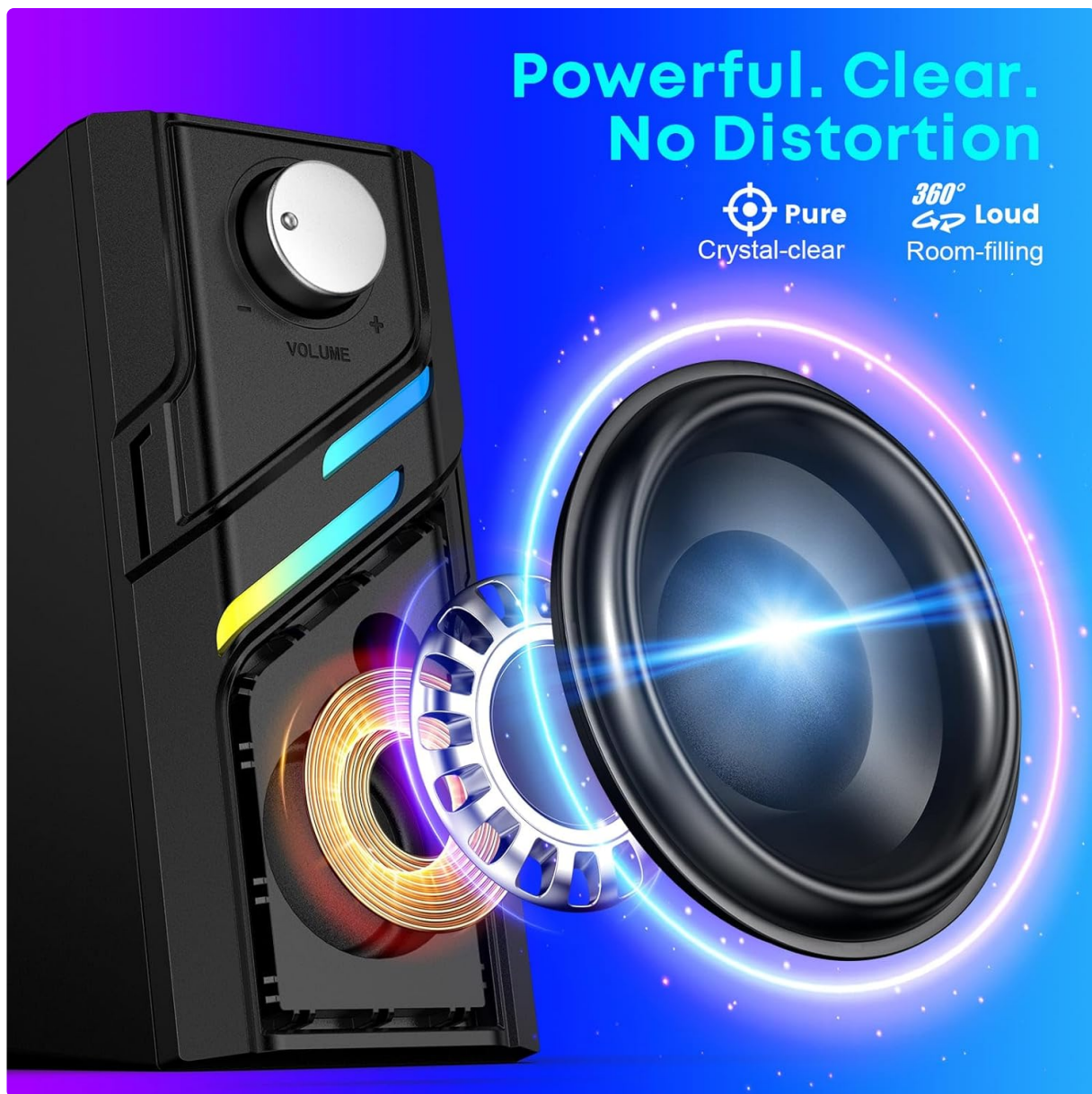
Diagram illustrating the internal components of the LENRUE E66 speaker, highlighting its powerful and clear sound output.