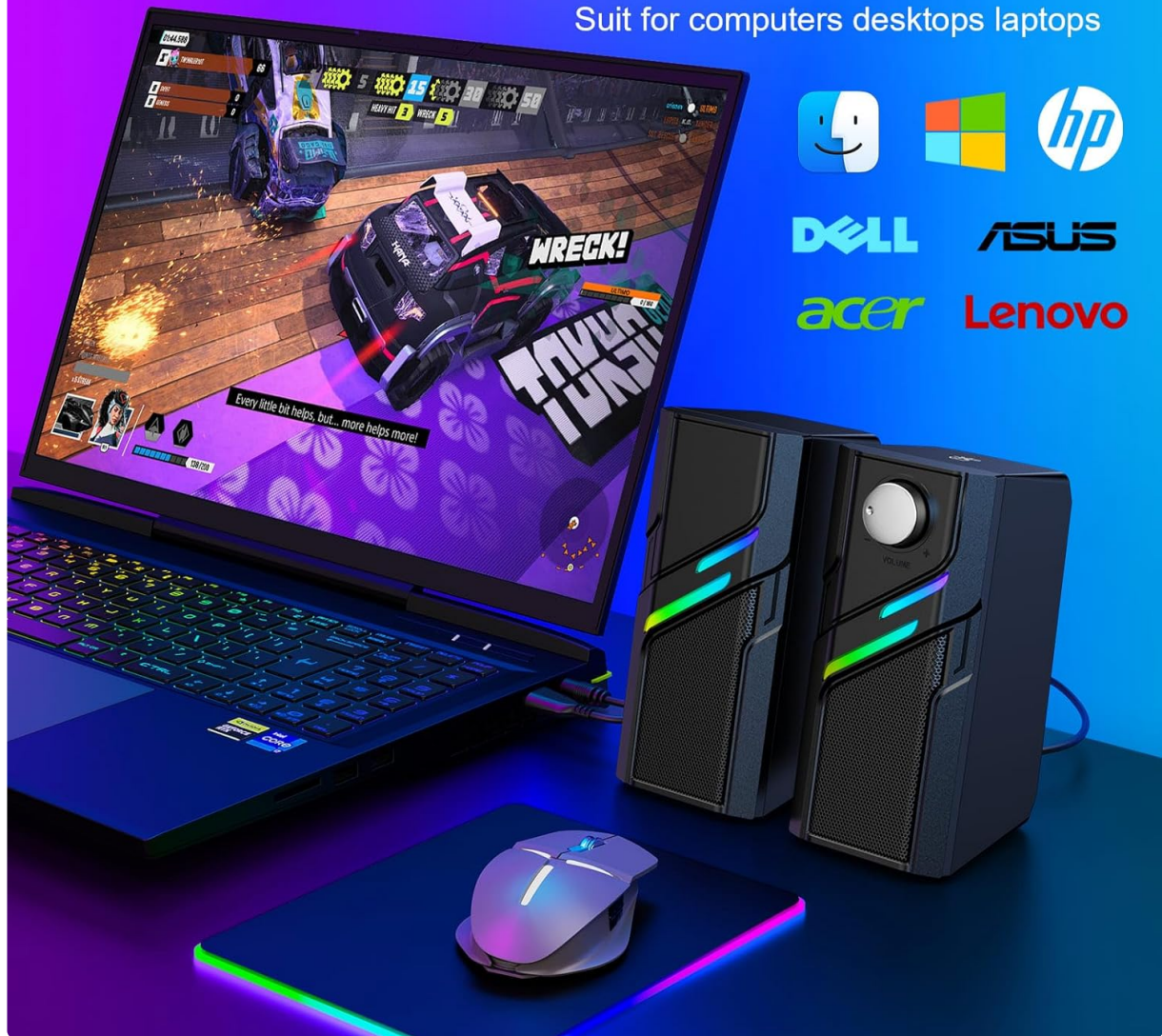
Illustration of connecting the LENRUE E66 speakers to a laptop via USB and AUX cables for a simple plug-and-play setup.