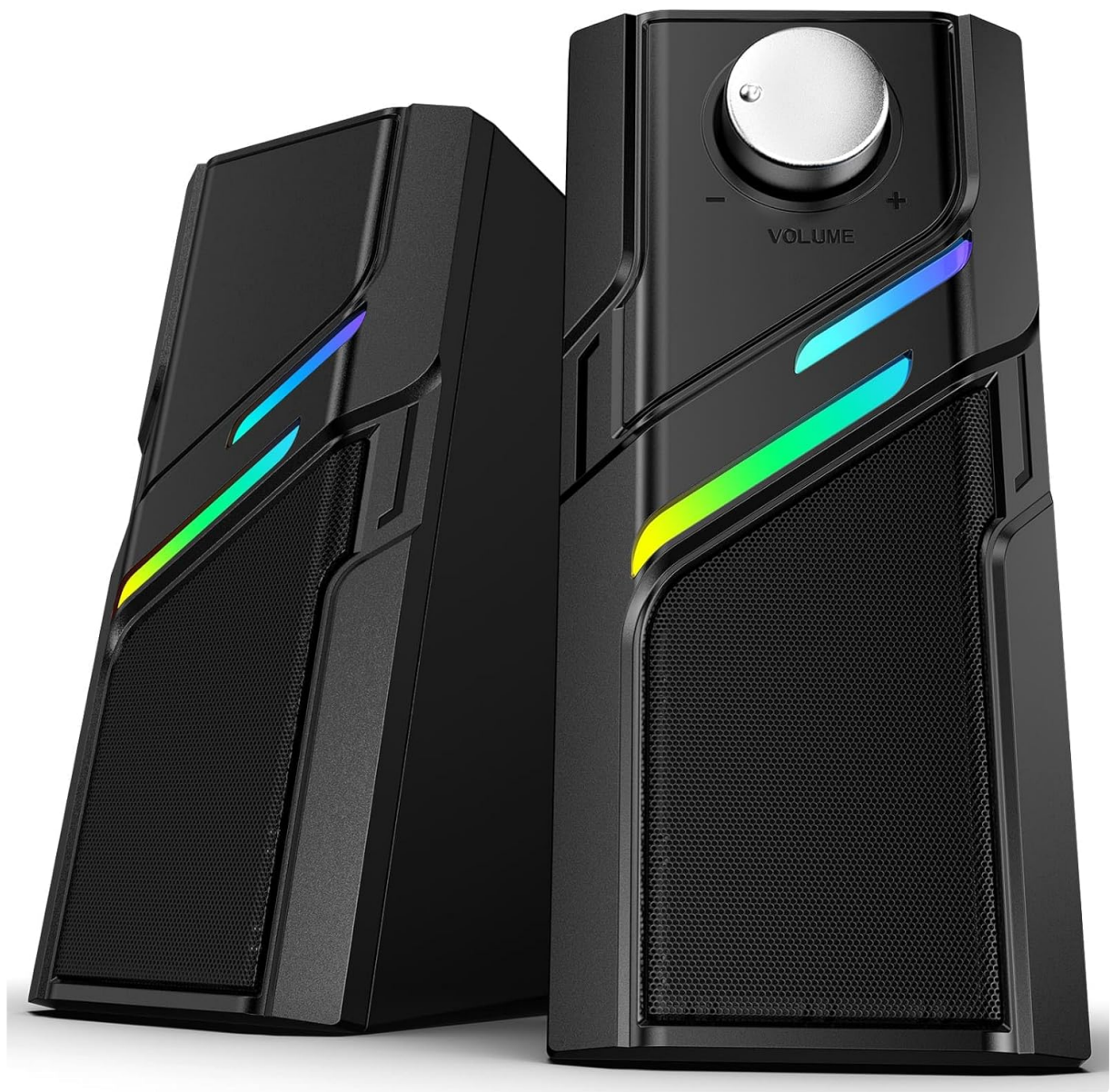
Front view of the LENRUE E66 Computer Speakers, showcasing their sleek black design and dynamic RGB lighting.