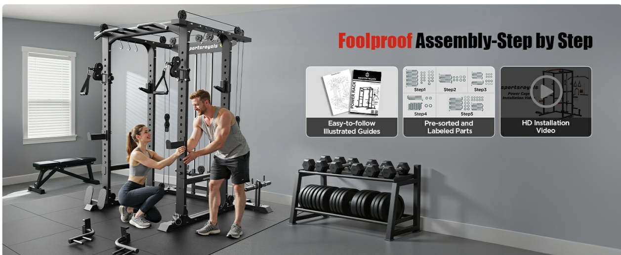
Image: Two individuals assembling the power cage, highlighting the easy-to-follow guides and pre-sorted parts.

Assembly of the Sportsroyals Power Cage requires careful attention to detail. It is highly recommended to have at least two people for the assembly process.