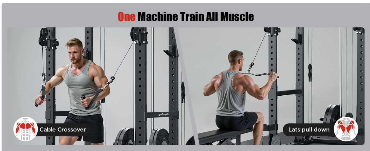
Image: Examples of Cable Crossover and Lat Pulldown exercises.