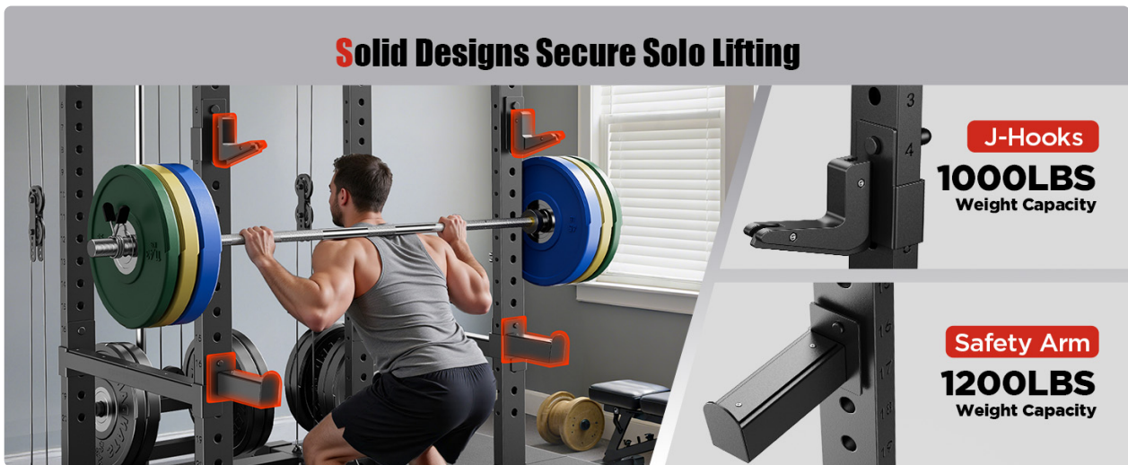
Image: Proper use of J-hooks and safety arms for barbell exercises.