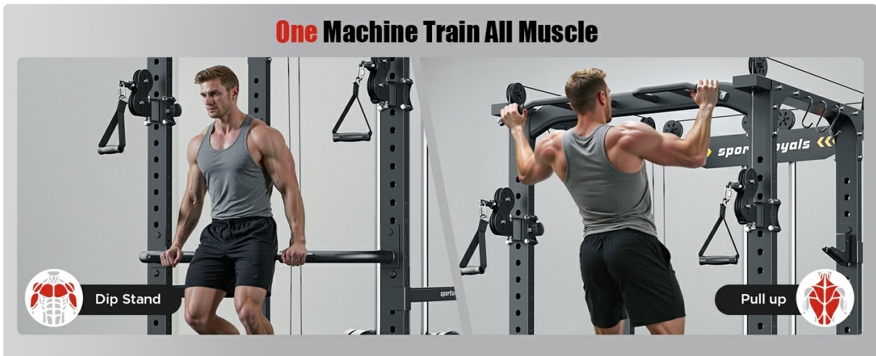
Image: Examples of Dip Stand and Pull Up exercises.