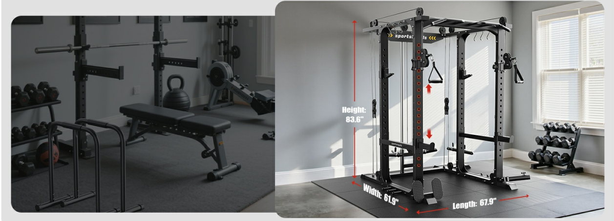
Image: Dimensions of the Sportsroyals Power Cage.