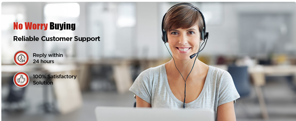
Image: Sportsroyals customer support representative.

Sportsroyals is committed to providing reliable products and excellent customer service.