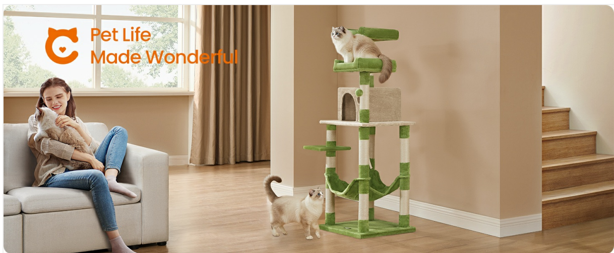
Figure 1: Overview of the Feandrea Multi-Level Cat Tree components.