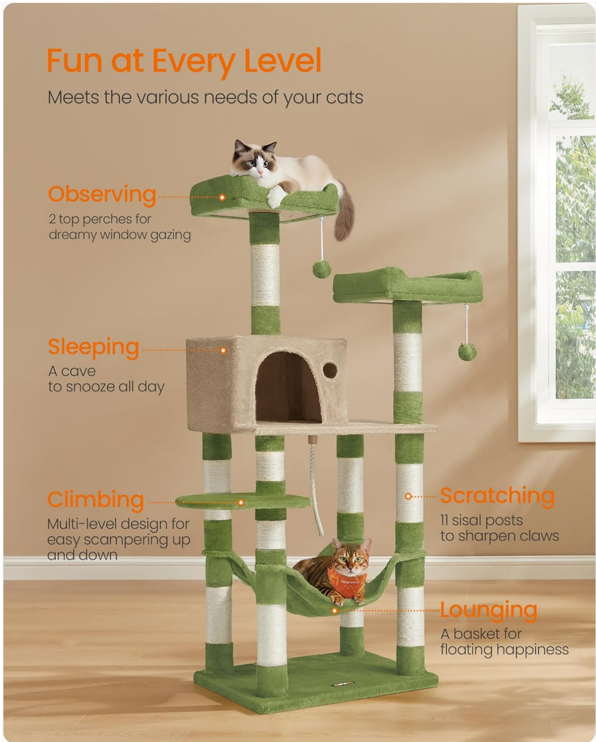
Figure 4: Illustrates the multi-level design with areas for observing, sleeping, climbing, scratching, and lounging.