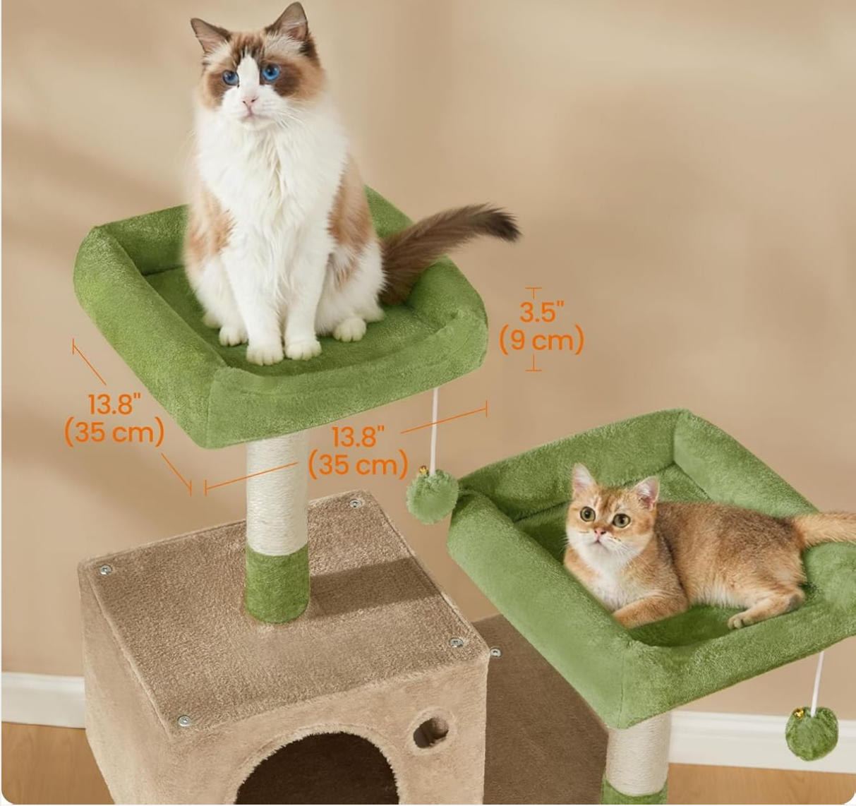
Figure 3: Close-up of the double top perches, ideal for observation or rest.

Comfortable for cats to observe or sleep