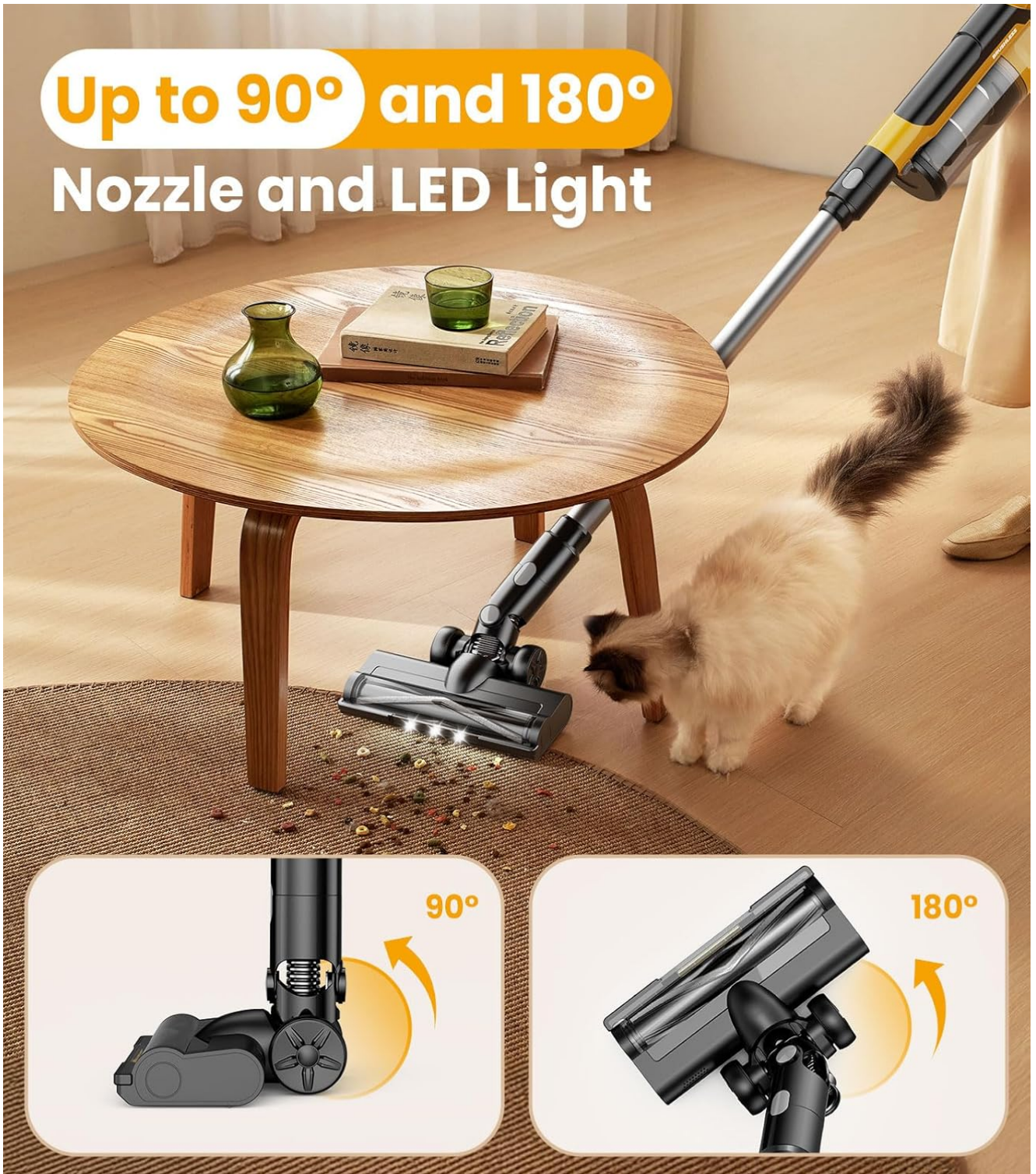
Figure 4: Demonstrating the versatility of the vacuum with different attachments.