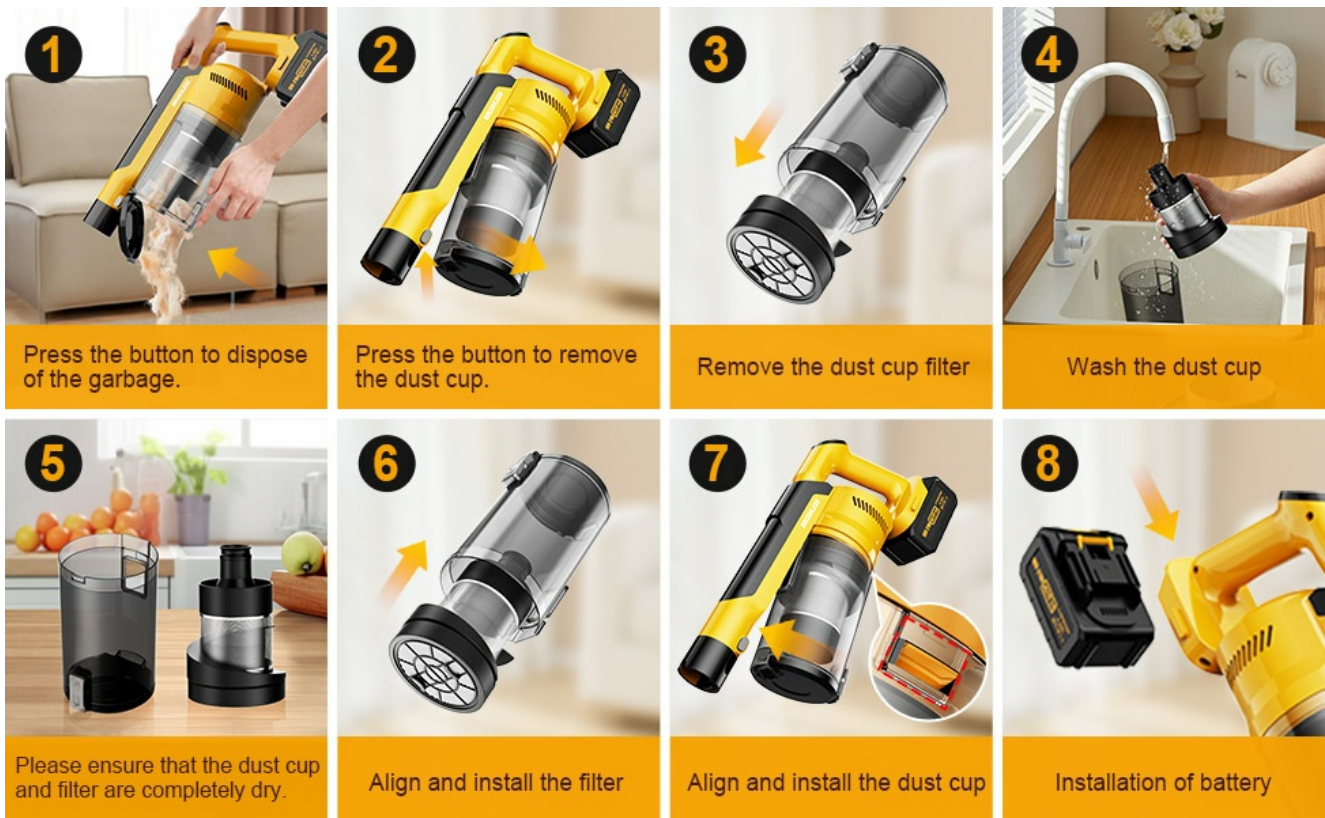
Figure 7: Steps for removing and cleaning the dust cup and filter.