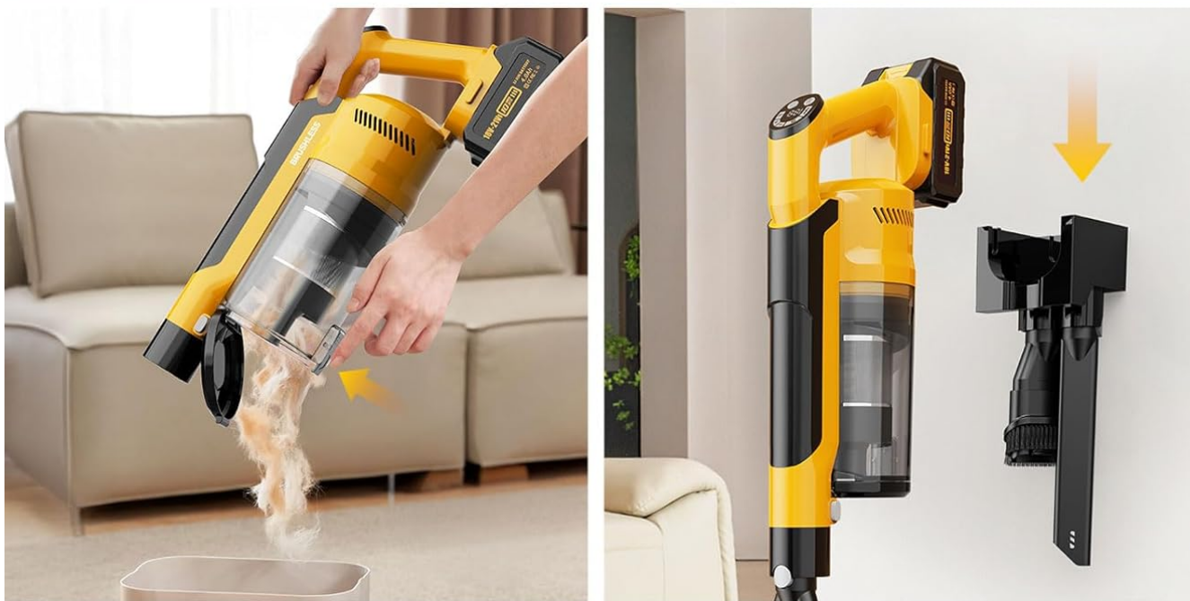
Figure 1: All components of the qimedo RD-101 Cordless Stick Vacuum Cleaner.