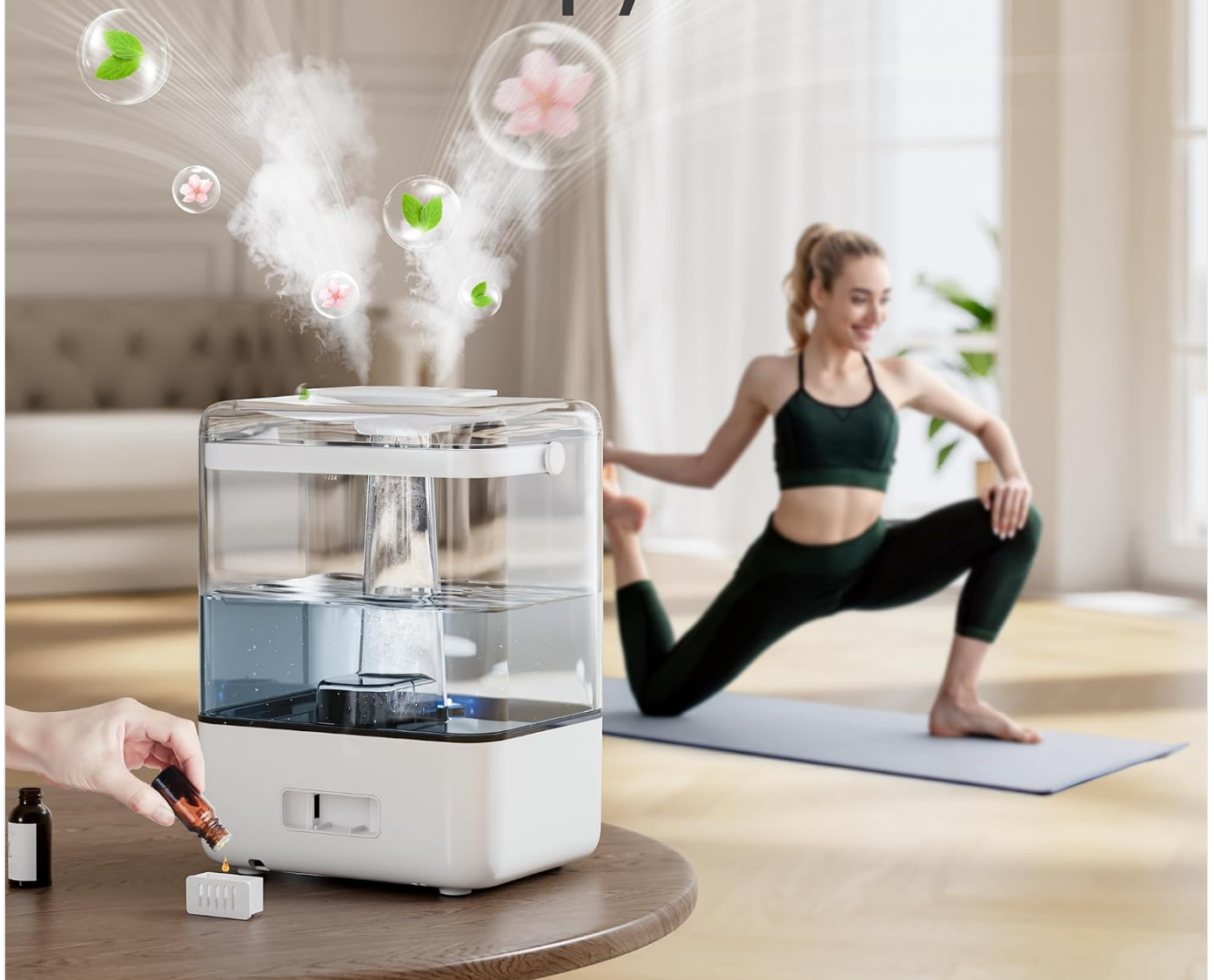
Figure 4: Using the essential oil diffuser tray.