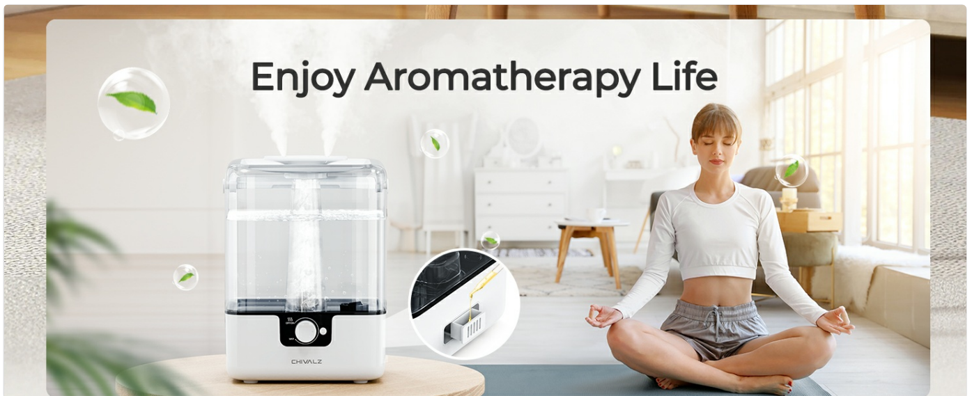
Figure 2: Humidifier components and features.

Familiarize yourself with the components of your humidifier: