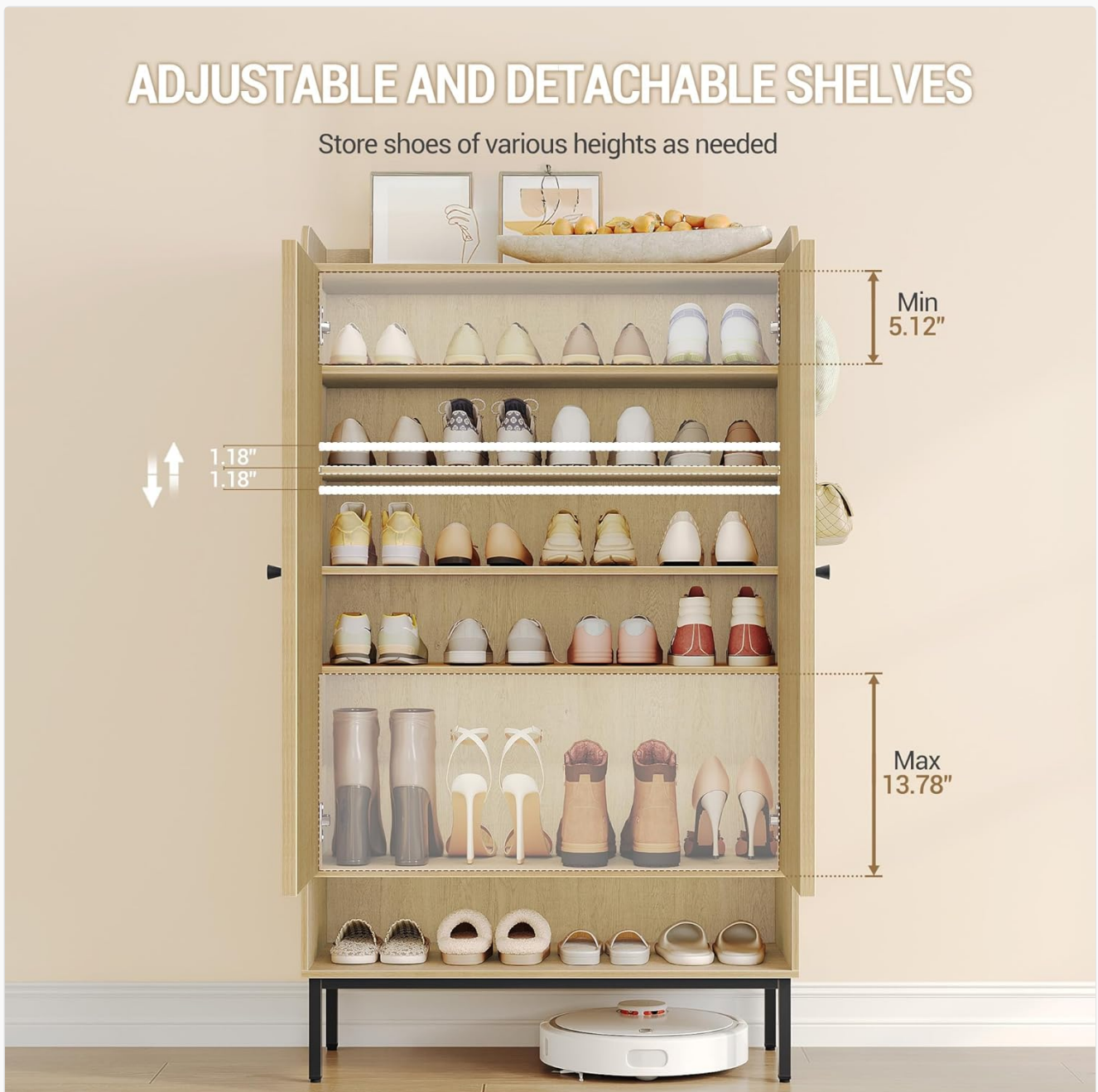
Figure 2: Adjustable Shelf Configuration. This image demonstrates the flexibility of the adjustable shelves, showing how they can be positioned to accommodate different shoe sizes and types, from flats to high boots. Minimum and maximum height adjustments are indicated.