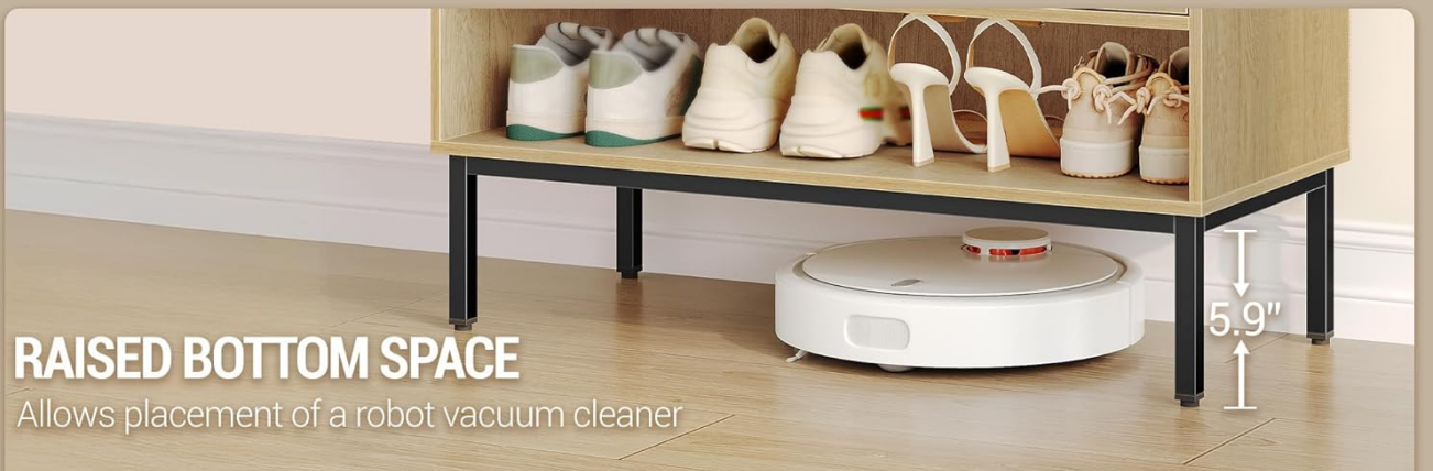
Figure 4: Cabinet Features. This image highlights the practical features of the cabinet, including the top fencing for securing items, convenient side hooks for hanging, and the raised bottom space designed to accommodate a robot vacuum.

Allows placement of a robot vacuum cleaner