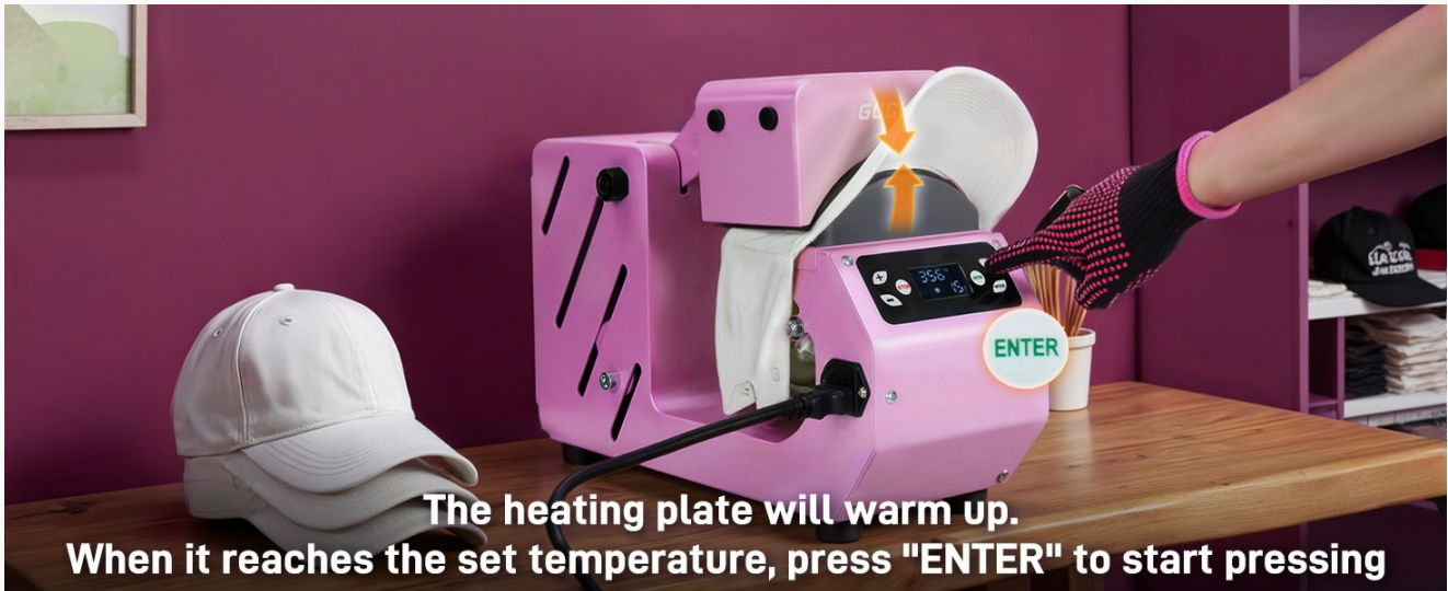
Figure 5.3: Starting the heat press operation.