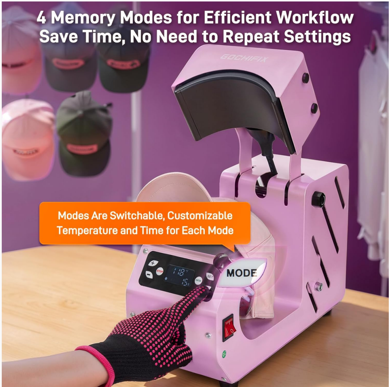
Figure 5.2: The control panel with memory mode selection.