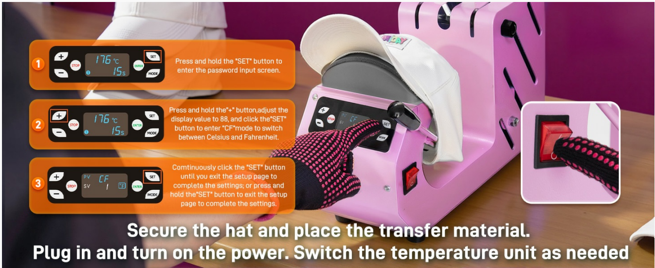
Figure 4.1: Initial setup showing power connection and hat placement.