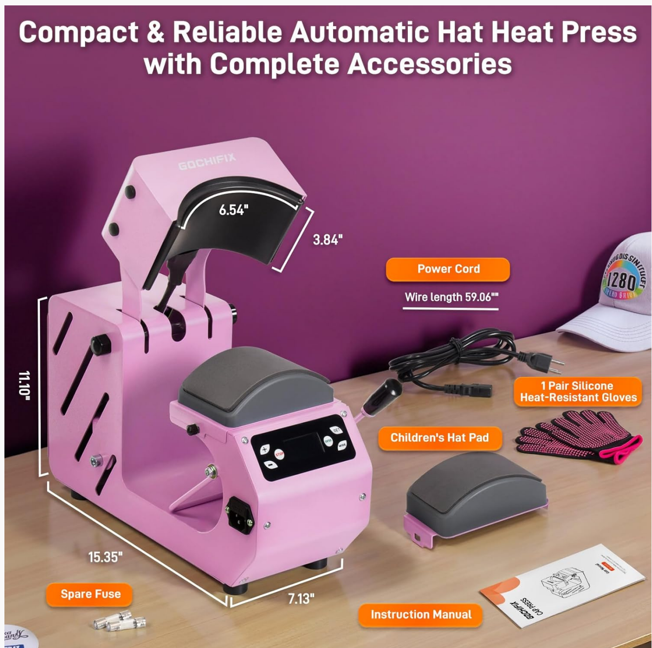
Figure 3.1: Included accessories with the heat press machine.