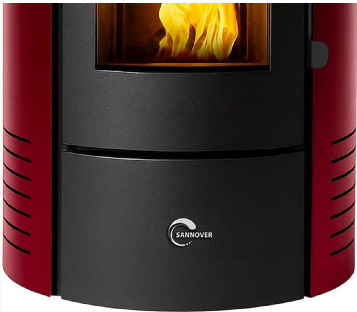
Image 7.1: Front view of the Sannover Azora 11.6 kW Sealed Pellet Stove, highlighting its design.