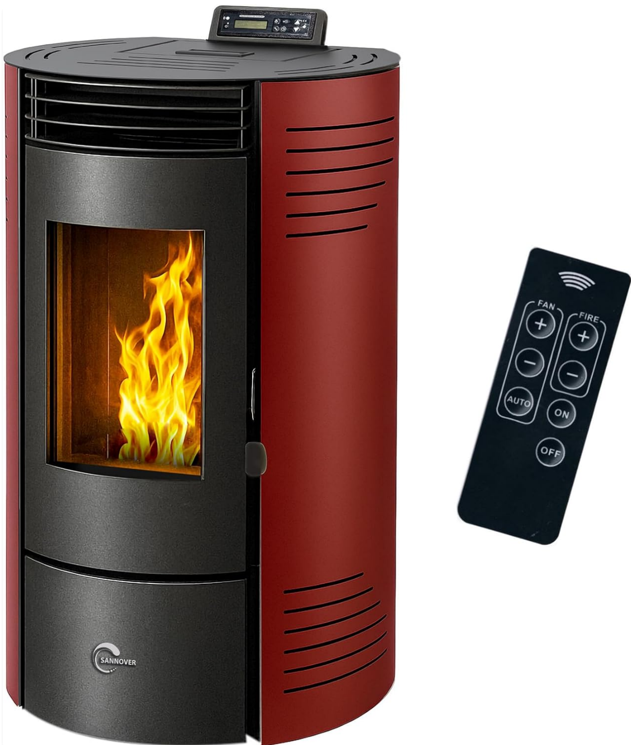
Image 1.1: The Sannover Azora 11.6 kW Sealed Pellet Stove, shown with its remote control.

The Azora model features a robust 11.6 kW absorbed power and an impressive 88.8% efficiency, capable of heating up to 240 m 3 effectively while managing energy consumption. Its large 15kg pellet tank ensures extended autonomy, up to 19 hours, for continuous comfort. User-friendly features include 5 power levels, weekly programming, an energy-saving mode, and integrated safety mechanisms. A cast iron brazier is incorporated to minimize noise during pellet drop, enhancing comfort, especially in living room installations.