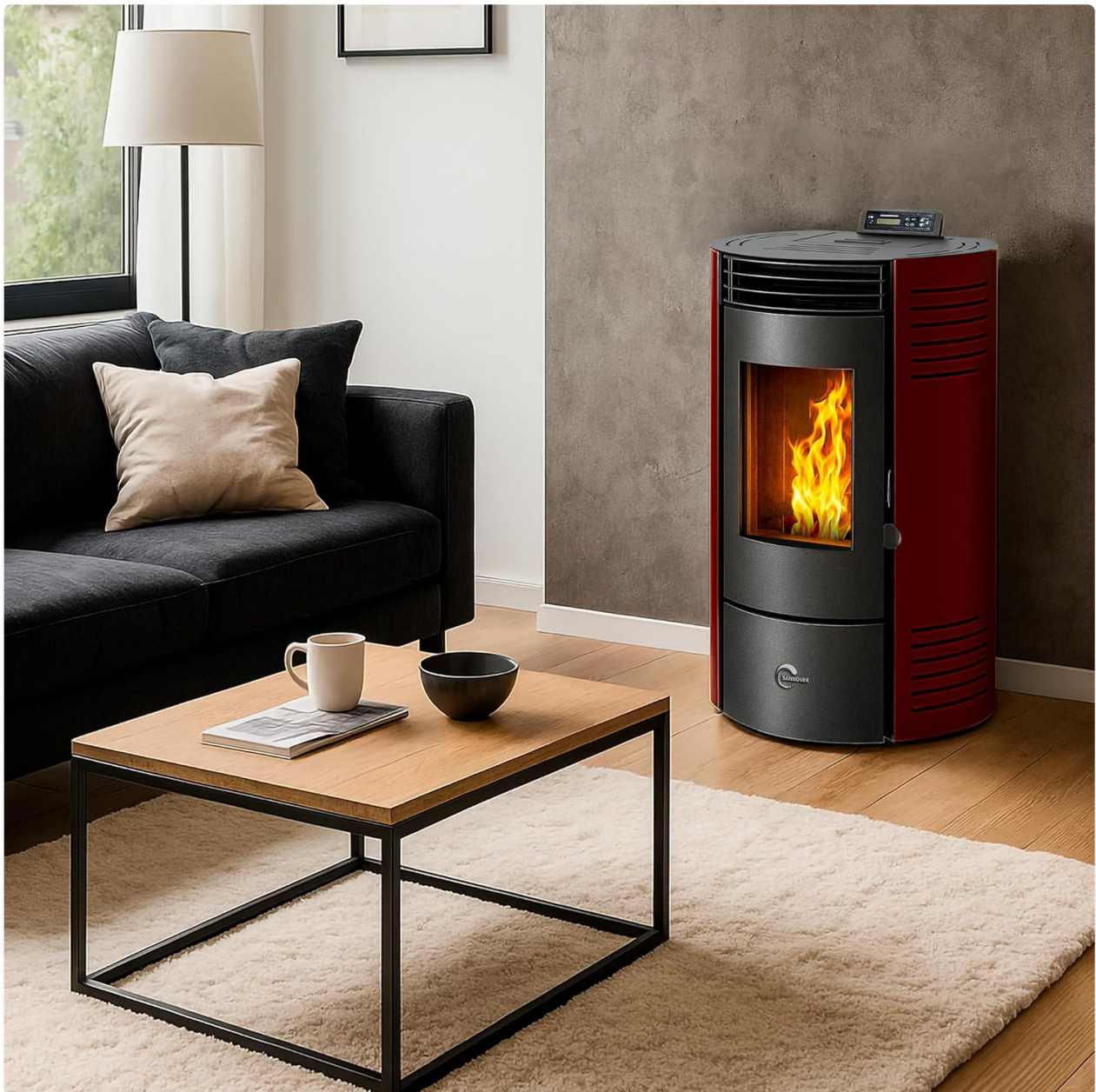
Image 3.1: The Sannover Azora 11.6 kW Sealed Pellet Stove positioned in a living room, demonstrating typical placement.

Proper placement and installation are critical for the safe and efficient operation of your Sannover Azora pellet stove. Always ensure the stove is installed on a non-combustible surface or with appropriate floor protection, and maintain adequate clearances from combustible materials as specified in local building codes and the detailed installation guide (not provided here, but typically included with the product).