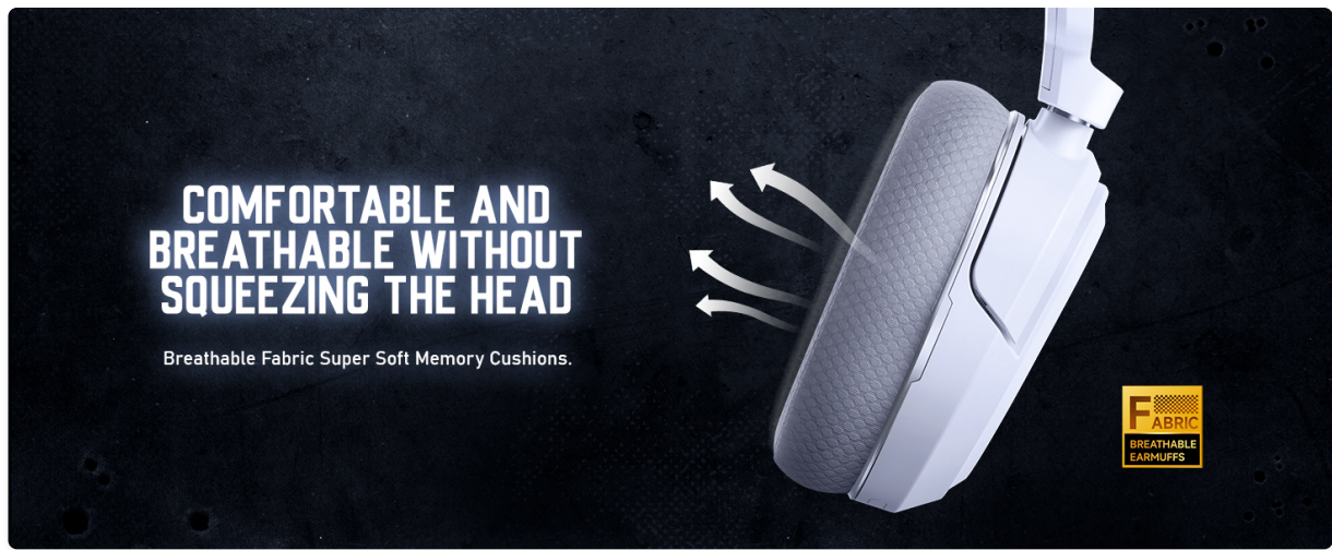
Image: Comfort Features