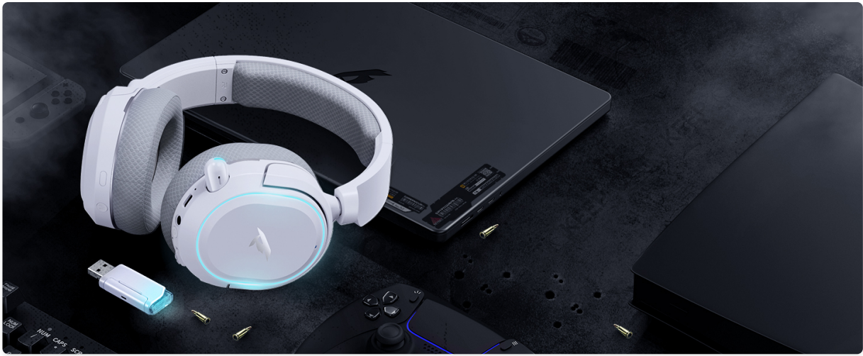
Image: Multiple Connection Options