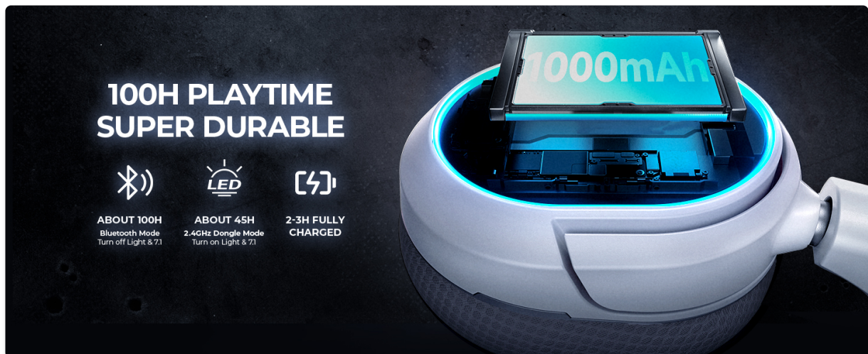
Image: Battery Life and Charging