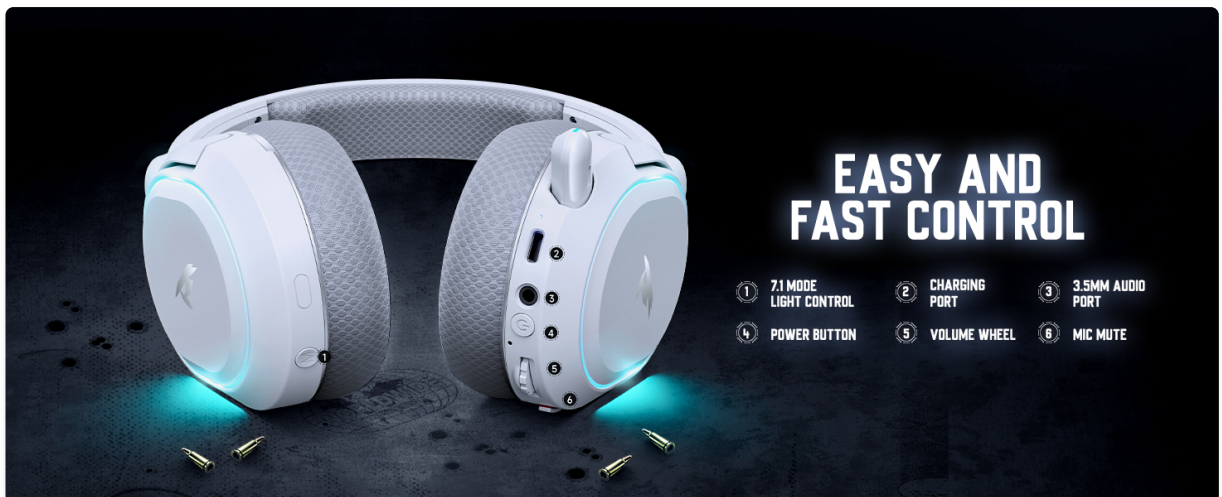
Image: Headset Controls Diagram

Familiarize yourself with the various components and controls of your Picun G2 headset.