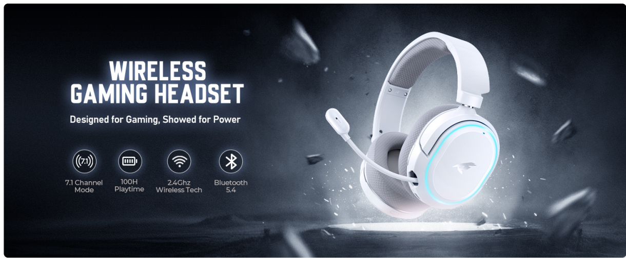
Image: 7.1 Surround Sound Activation