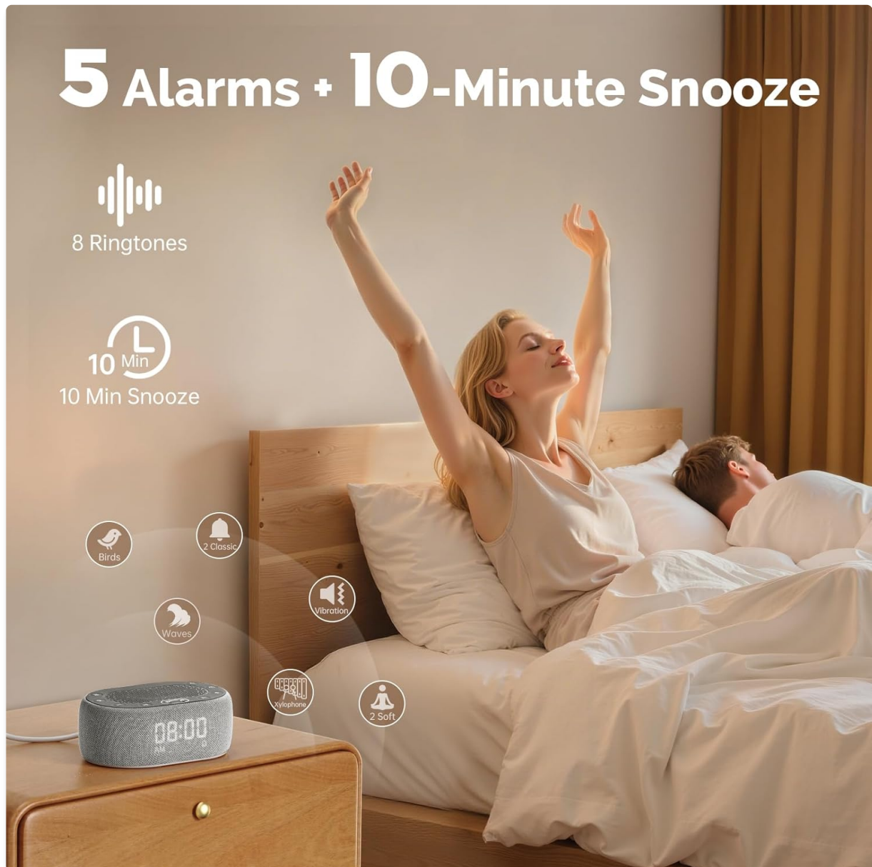
Image: A person stretching in bed, indicating a refreshed wake-up, with the 1Mii R3 alarm clock displaying 8:00 AM on a nightstand.

Your browser does not support the video tag.