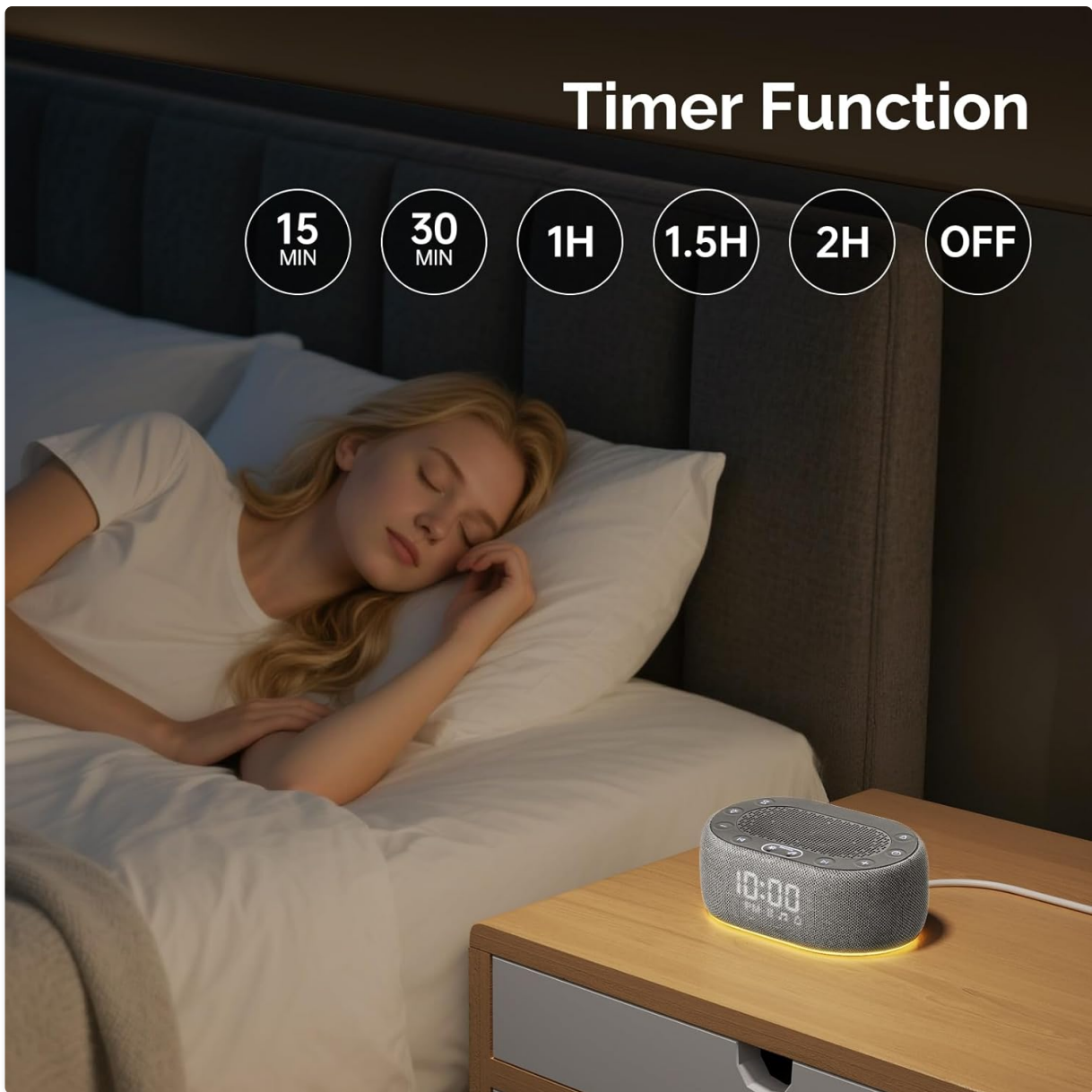
Image: A person sleeping soundly in bed, with the 1Mii R3 sound machine on a nightstand, highlighting the customizable sleep timer function.

Your browser does not support the video tag.