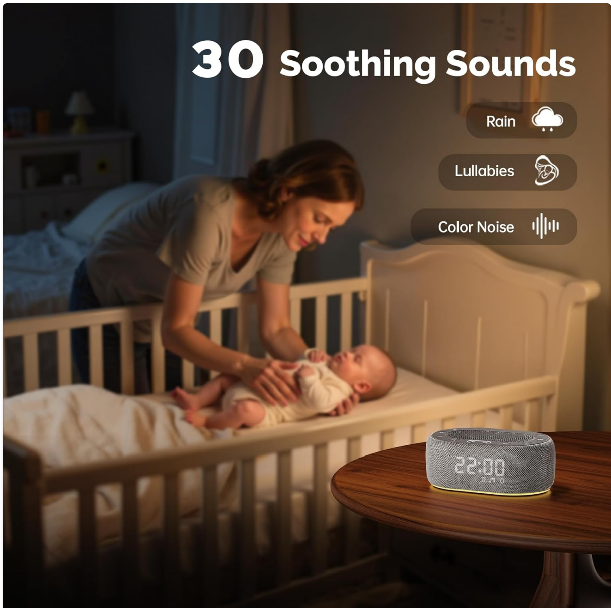
Image: A baby sleeping peacefully in a crib, with the 1Mii R3 sound machine on a nearby table, highlighting the product's 30 soothing sounds feature for sleep.

Your browser does not support the video tag.