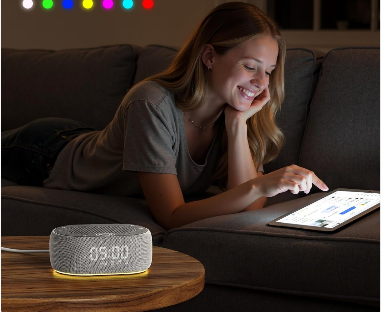
Image: A person relaxing on a couch, with the 1Mii R3 sound machine on a coffee table, showcasing its 7-color night light feature.

Your browser does not support the video tag.