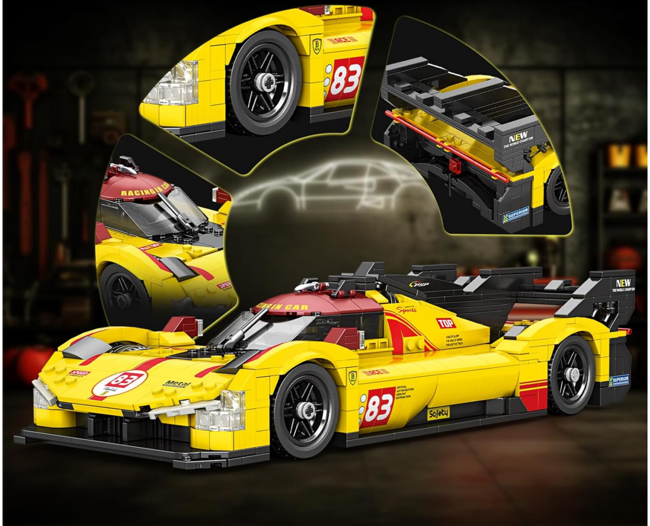
Figure 3: An intricate view highlighting the detailed cockpit, engine, and aerodynamic elements of the Reobrix Super Sports Car Kit 11042.