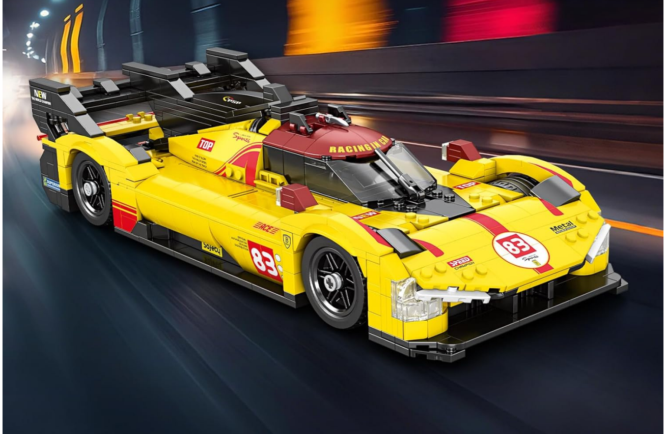
Figure 1: The fully assembled Reobrix Super Sports Car Kit 11042, showcasing its detailed design and yellow livery.

SPEED Sports CLIMBING PEAK ACE Metal WORKSHOP