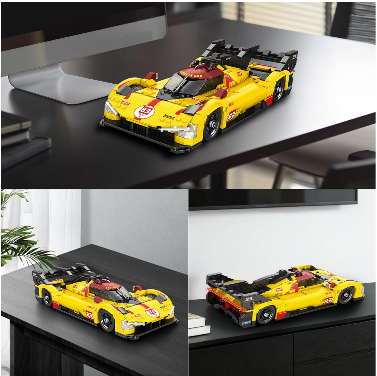
Figure 4: The completed Reobrix Super Sports Car Kit 11042 showcased as a decorative item on a desk, highlighting its aesthetic appeal.