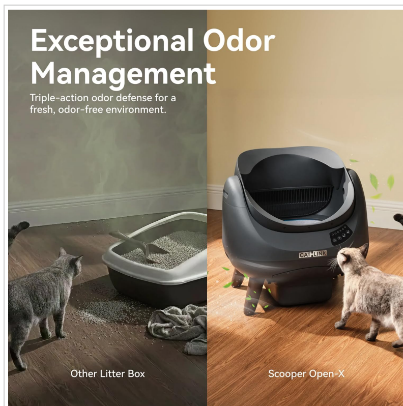
Image: The spacious open-top design of the CATLINK Open-X, allowing cats to enter and exit comfortably.

including bentonite, mineral, tofu, and mixed litter. Ensure the litter level does not exceed the 'MAX' line indicated inside the globe.