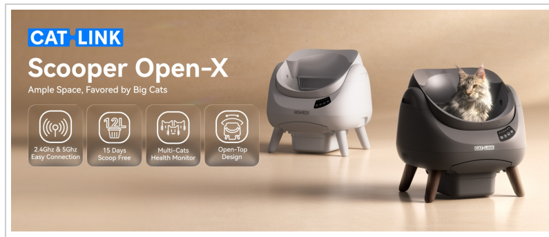
Image: CATLINK Open-X Self-Cleaning Litter Box and included accessories.