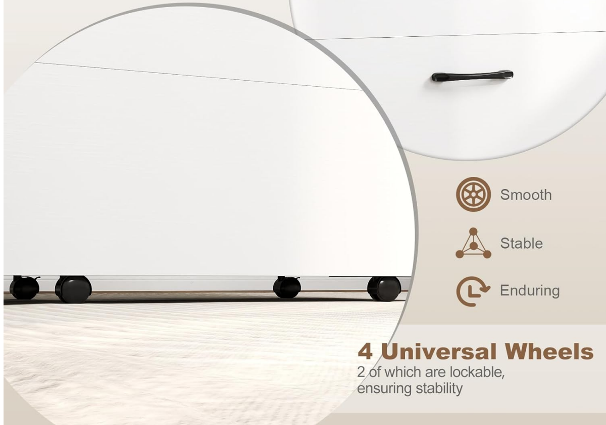
Image 4.2: Details of the dual handles and universal wheels for easy movement.

Make it simple for you to manage the bed