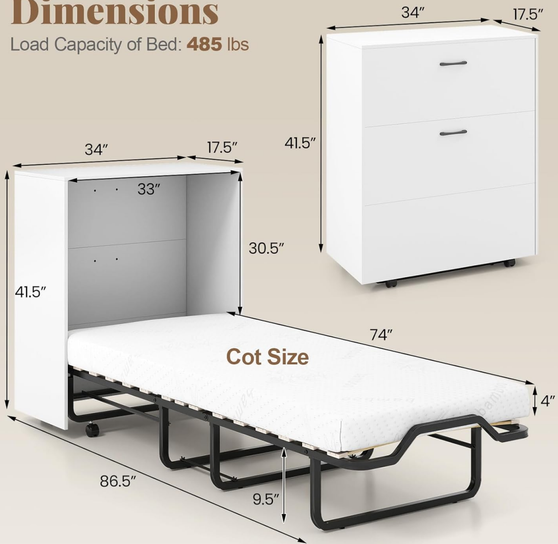
Image 3.2: Detailed dimensions of the Murphy Bed Cabinet, folded and unfolded.