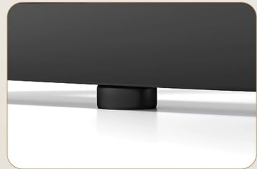
Anti-Slip Foot Pads Avoid scratching the floor