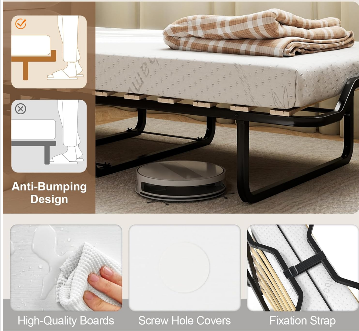
Image 7.1: User-friendly design details including anti-bumping features.