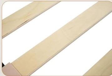
15 Birch Wood Slats Ensure a stable platform