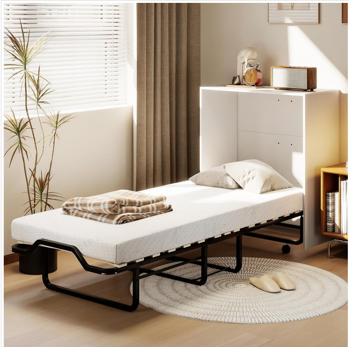
Image 3.1: The KOMFOTT Murphy Bed Cabinet unfolded, ready for use.

Follow the provided assembly manual for detailed instructions on constructing the cabinet and bed frame. Pay close attention to diagrams and fastener types.