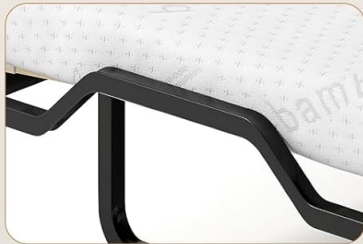
Mattress Stopper Keep your mattress in place