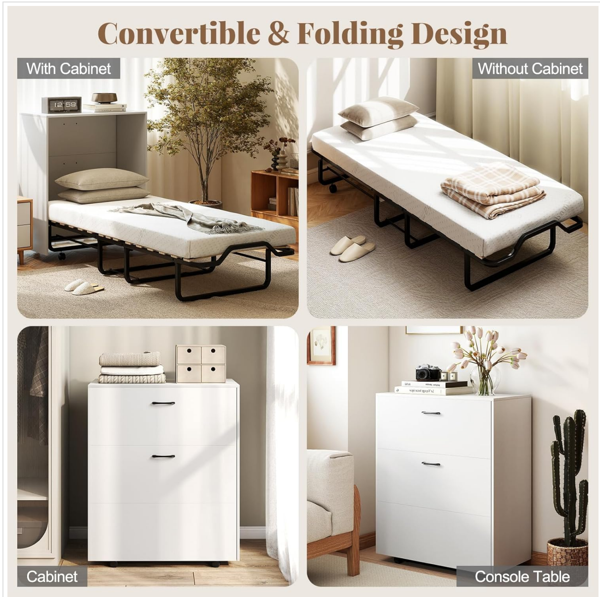
Image 4.1: The convertible and folding design of the Murphy Bed Cabinet.