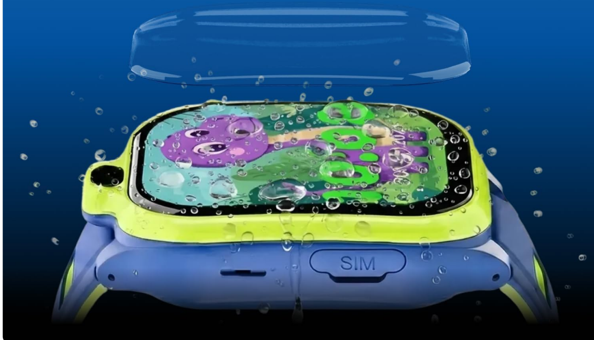
Image 4.5: Advanced features including the Jarvis app, safety filters, and voice commands.

2.0" IPS display Stunning detail and colours.