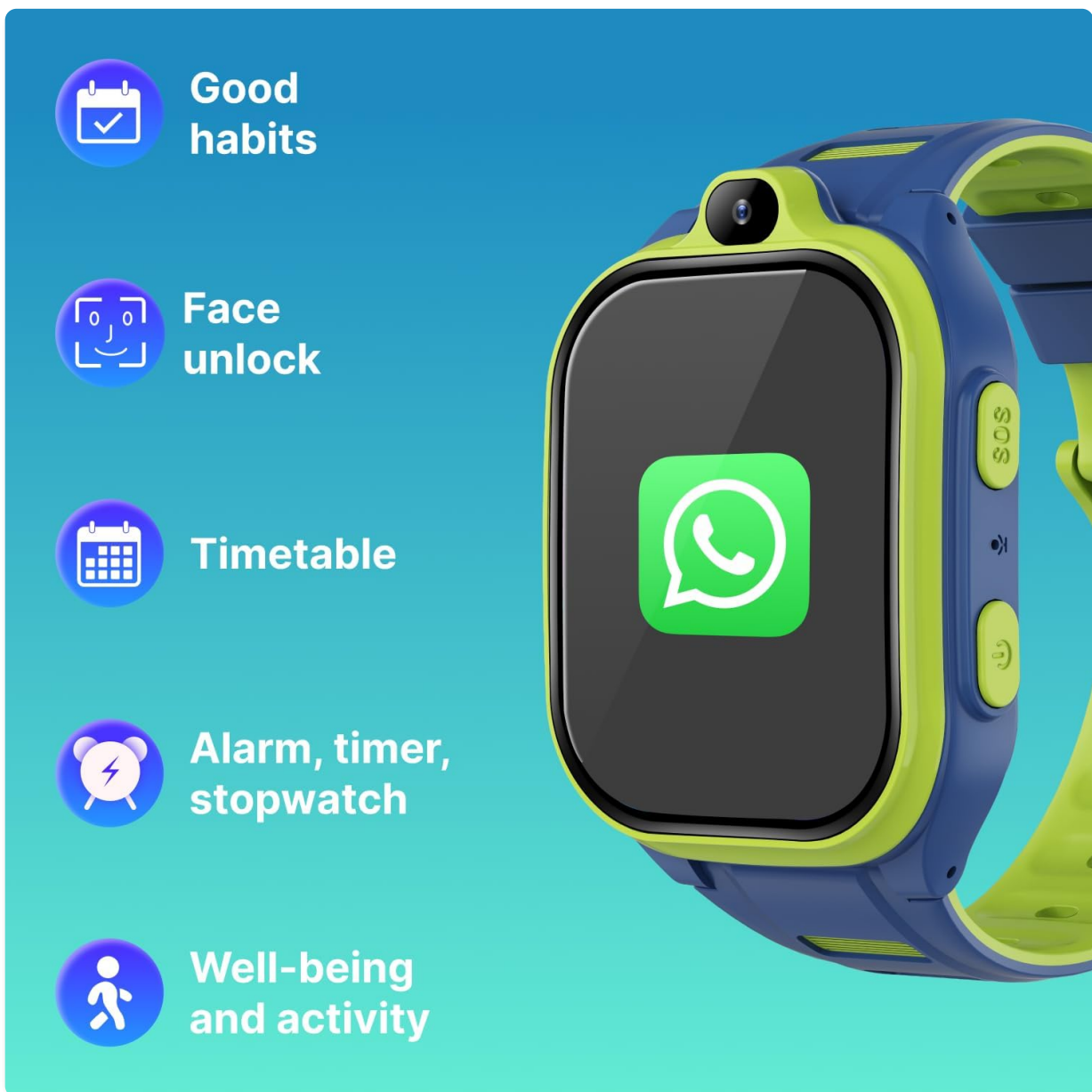
Image 4.3: Overview of health and organizational features available on the smartwatch.