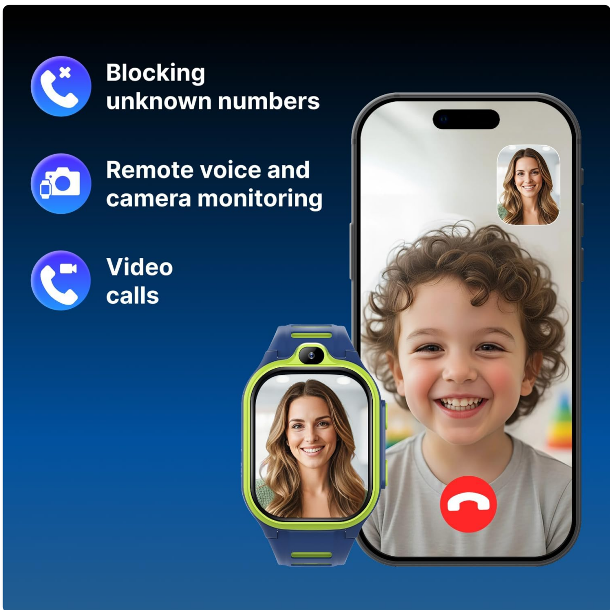
Image 4.1: Illustration of video call capabilities on the FOREVER KW-530 Smartwatch.