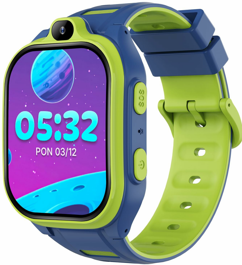
Image 1.1: The FOREVER KW-530 Smartwatch, displaying the time and date on its screen.