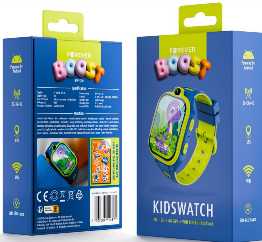
Image 2.1: Product packaging for the FOREVER KW-530 Smartwatch, illustrating key features and contents.