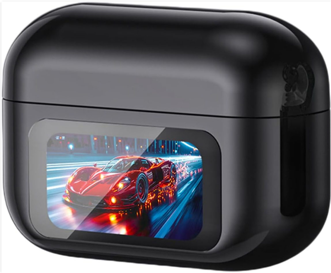
Image: The XG42 Open Ear Wireless Earbuds shown inside their charging case. The case features a display screen.