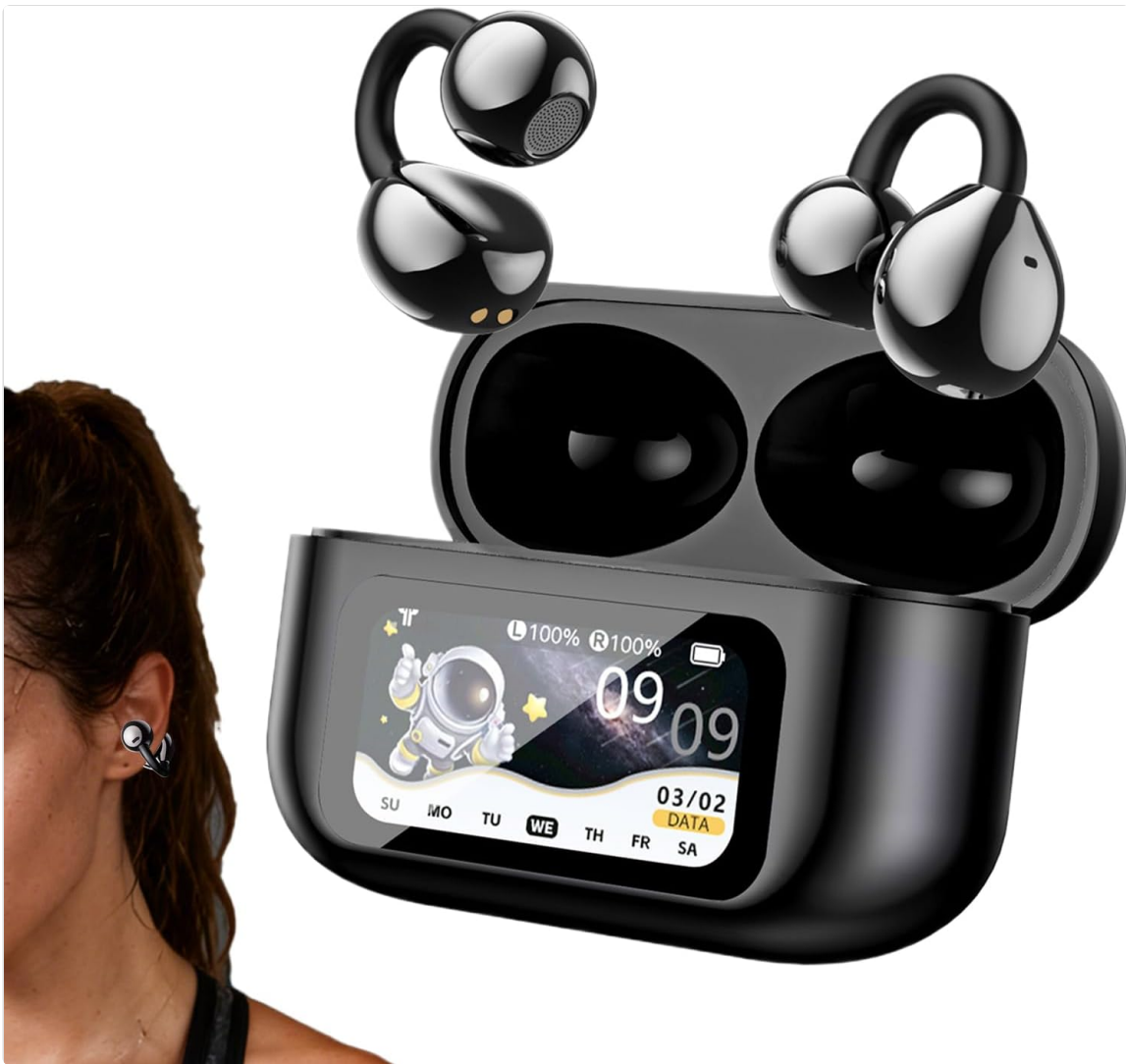
Image: The charging case display showing battery levels for both earbuds and the case, along with the current date.