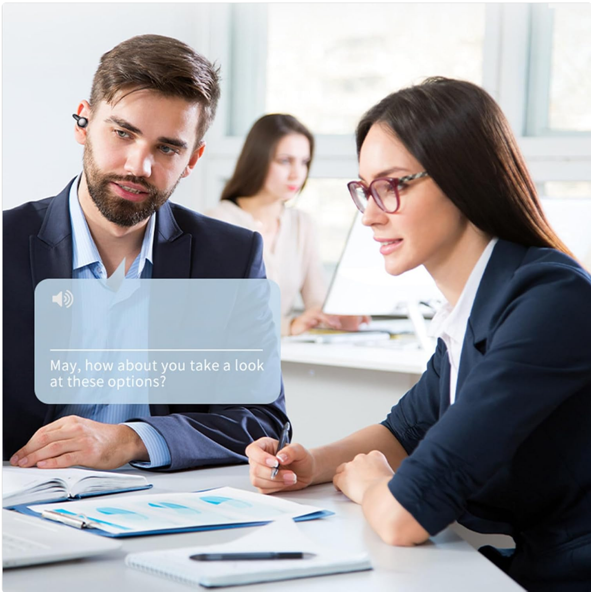
Image: A person wearing an XG42 earbud in an office environment, with a speech bubble suggesting clear communication, illustrating the optimized call clarity feature.