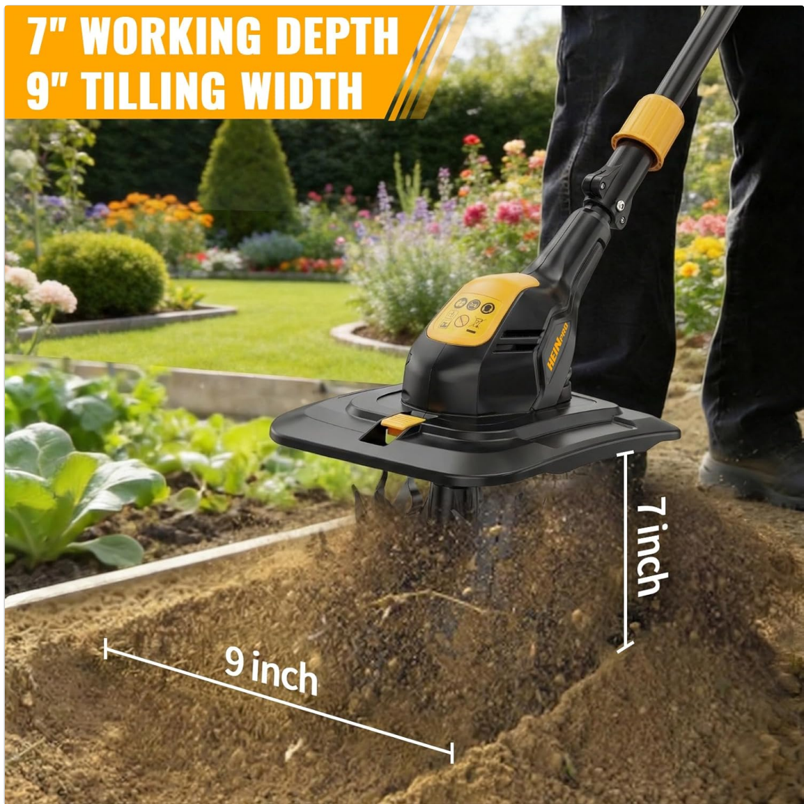
Figure 3: The tiller in action, demonstrating its 9-inch tilling width and 7-inch depth.