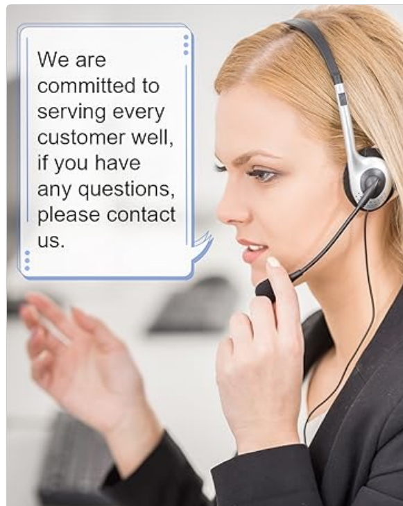
Figure 5: HEINPRO customer support is available for assistance.

HEINPRO is committed to providing reliable solutions and customer satisfaction. While specific warranty details are not provided in this manual, the manufacturer offers 24-hour after-sales service support. For any questions, concerns, or support needs, please contact HEINPRO customer service.