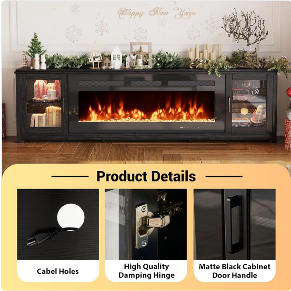
Image: Detailed view of cable holes for wire management, high-quality damping hinges for cabinet doors, and matte black cabinet door handles.