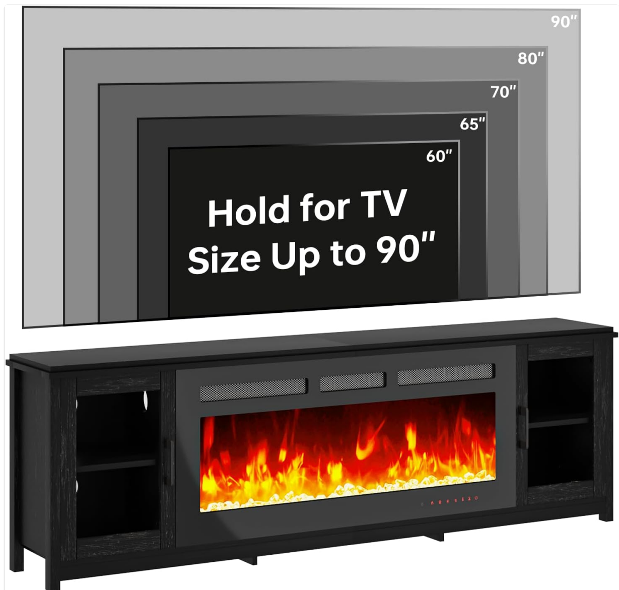
Image: Visual representation of TV size compatibility, demonstrating that the stand can safely support televisions up to 90 inches.

The MXV 80-inch Fireplace TV Stand is designed to accommodate televisions up to 90 inches in size. Ensure the TV's base fits securely on the top surface and does not exceed the stand's weight capacity.