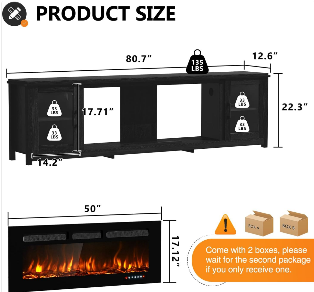
Image: Product dimensions diagram indicating the product ships in two boxes. If only one box is received, please wait for the second package.

Your MXV Fireplace TV Stand is shipped in two separate boxes. Please ensure you have received both packages before beginning assembly.