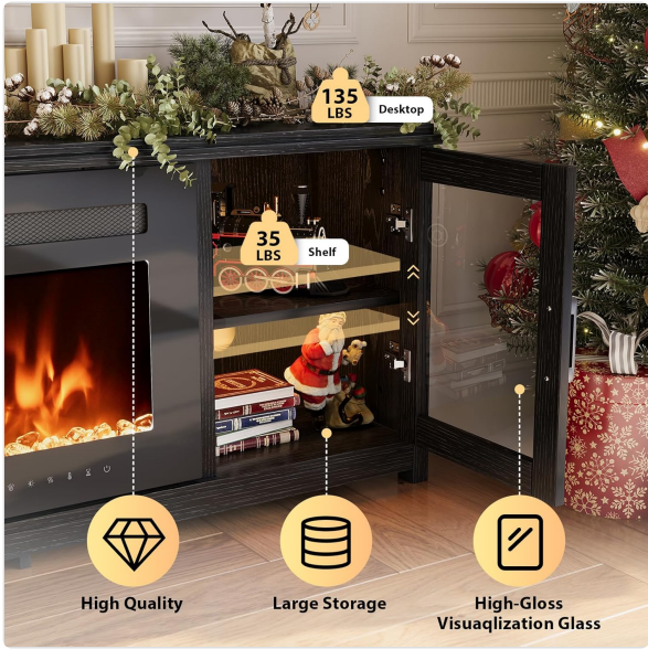
Image: A cabinet with a glass door, illustrating the adjustable shelf feature and storage capacity. The desktop supports up to 135 lbs, and each shelf supports up to 35 lbs.