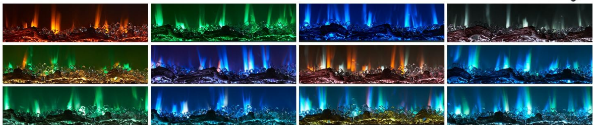
Image: Visual demonstration of the electric fireplace's flame effects, showcasing both the traditional log effect and the modern crystal stone effect, along with the range of 12 color options and 5 brightness levels.