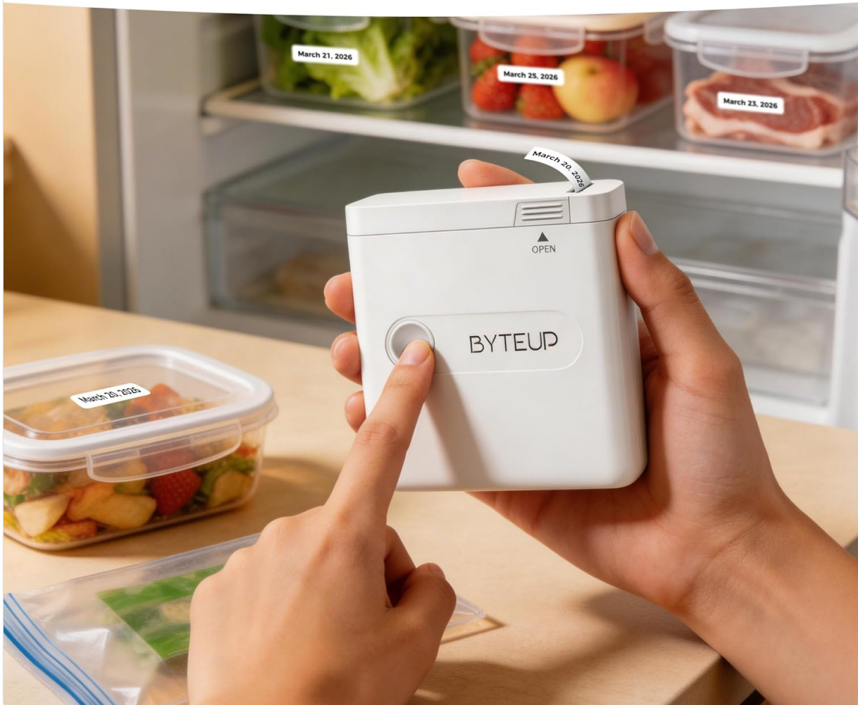
Figure 5.2: Using the One-Touch Date/Time Stamp.

Label leftovers & meal prep in seconds Auto-sync time when you open the app