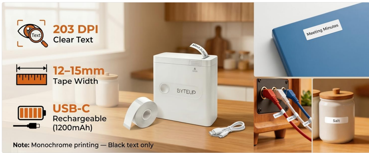
Figure 3.1: Key Features of the D12 Pro Label Maker.