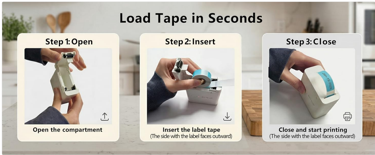
Figure 4.2: Loading Label Tape.