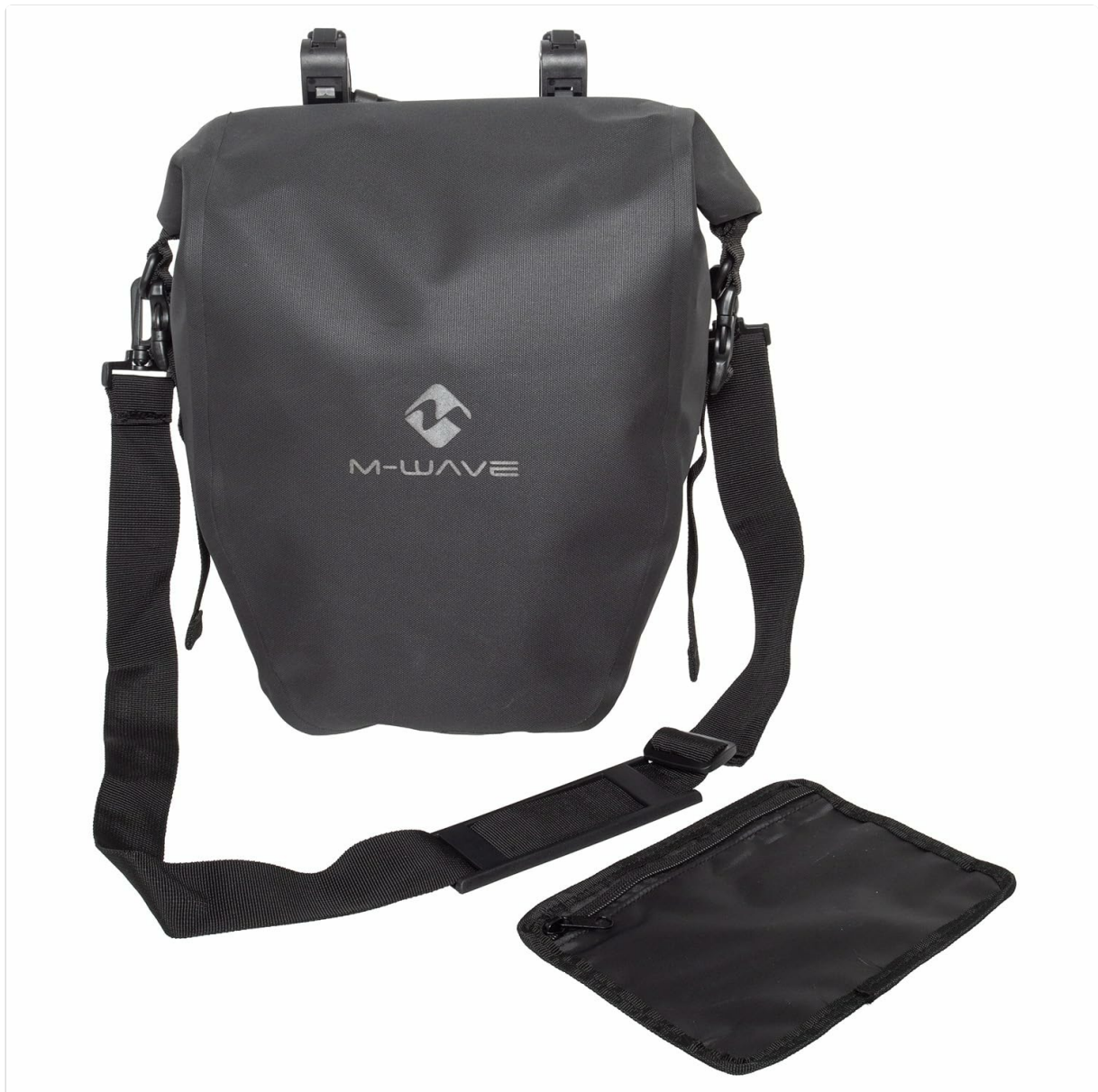
Figure 5: The pannier bag with its roll-top closure properly rolled down and clipped, ensuring waterproof sealing.

To ensure the bag remains waterproof, fill the bag and then roll the top edge down at least three times. Secure the rolled top by clipping the buckles together, either over the top of the bag or to the side straps, depending on the model. This creates a tight seal, protecting your contents from water and dust.