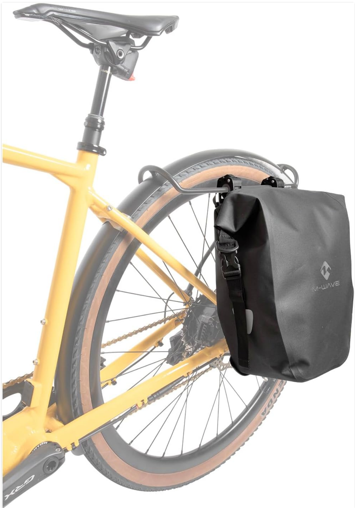
Figure 4: The pannier bag correctly installed on a bicycle rack, demonstrating proper positioning and clearance.

Once the upper hooks and lower attachment are adjusted, carefully place the bag onto your bicycle rack. Ensure both upper hooks are securely clipped onto the top rail and the lower attachment is fastened. Verify that the bag does not interfere with the wheel, pedals, or your riding posture.