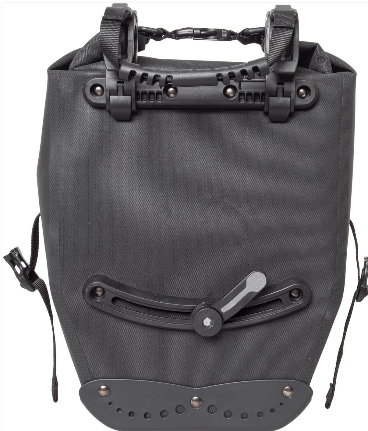
Figure 1: Rear view of the pannier bag, highlighting the upper clip-on hooks and the adjustable lower attachment.

Before installation, familiarize yourself with the bag's rear mounting system. It consists of two upper hooks and an adjustable lower attachment point designed to secure the bag to your bicycle rack.