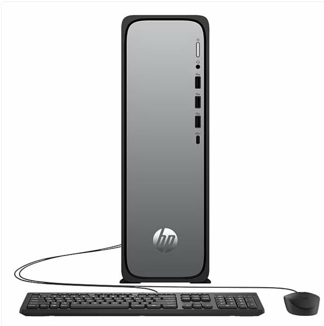
Figure 3.2: Front and rear port layout of the HP OmniDesk Slim Desktop PC. Front ports include a headphone/microphone combo jack, USB Type-A 5Gbps ports, and a USB Type-C 10Gbps port. Additional ports (typically rear) include 4 USB 2.0 Type-A, 1 RJ-45 (Ethernet), 1 HDMI Out, and 1 DisplayPort 1.4.