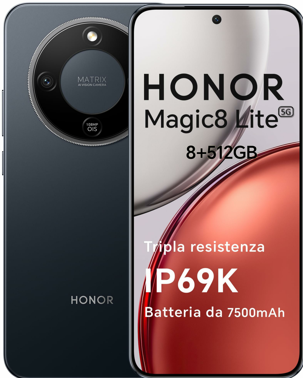
Figure 1: HONOR Magic8 Lite 5G Smartphone, Midnight Black variant.