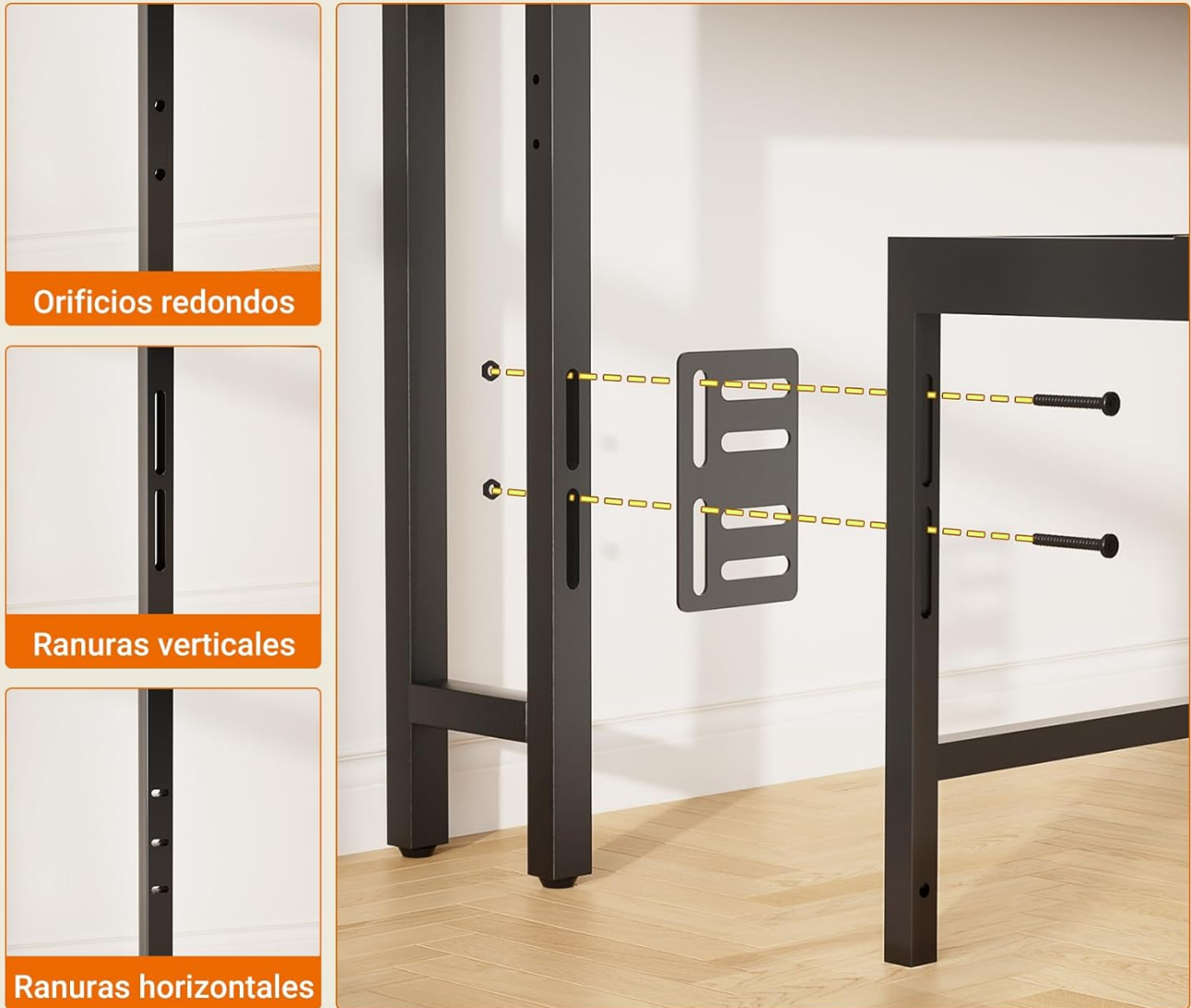
Image: This image illustrates the adjustable feet and the bed frame adapters. The adapters are designed to connect to bed frames with various hole types, including round holes, vertical slots, and horizontal slots, ensuring broad compatibility and stability.

El adaptador es adecuado para estructuras de cama con ancho insuficiente