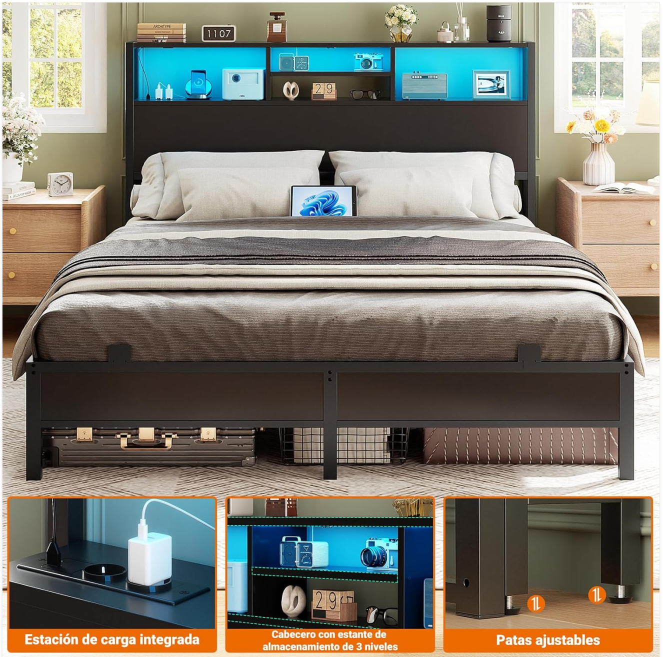
Image: The integrated charging station provides easy access to power with two AC outlets, one USB port, and one Type-C port, allowing multiple devices to be charged conveniently from your bedside.

The headboard is equipped with a convenient charging station, featuring 2 AC outlets, 1 USB port, and 1 Type-C port. This allows you to power up to four devices simultaneously. The power cable for the charging station is 150 cm long.