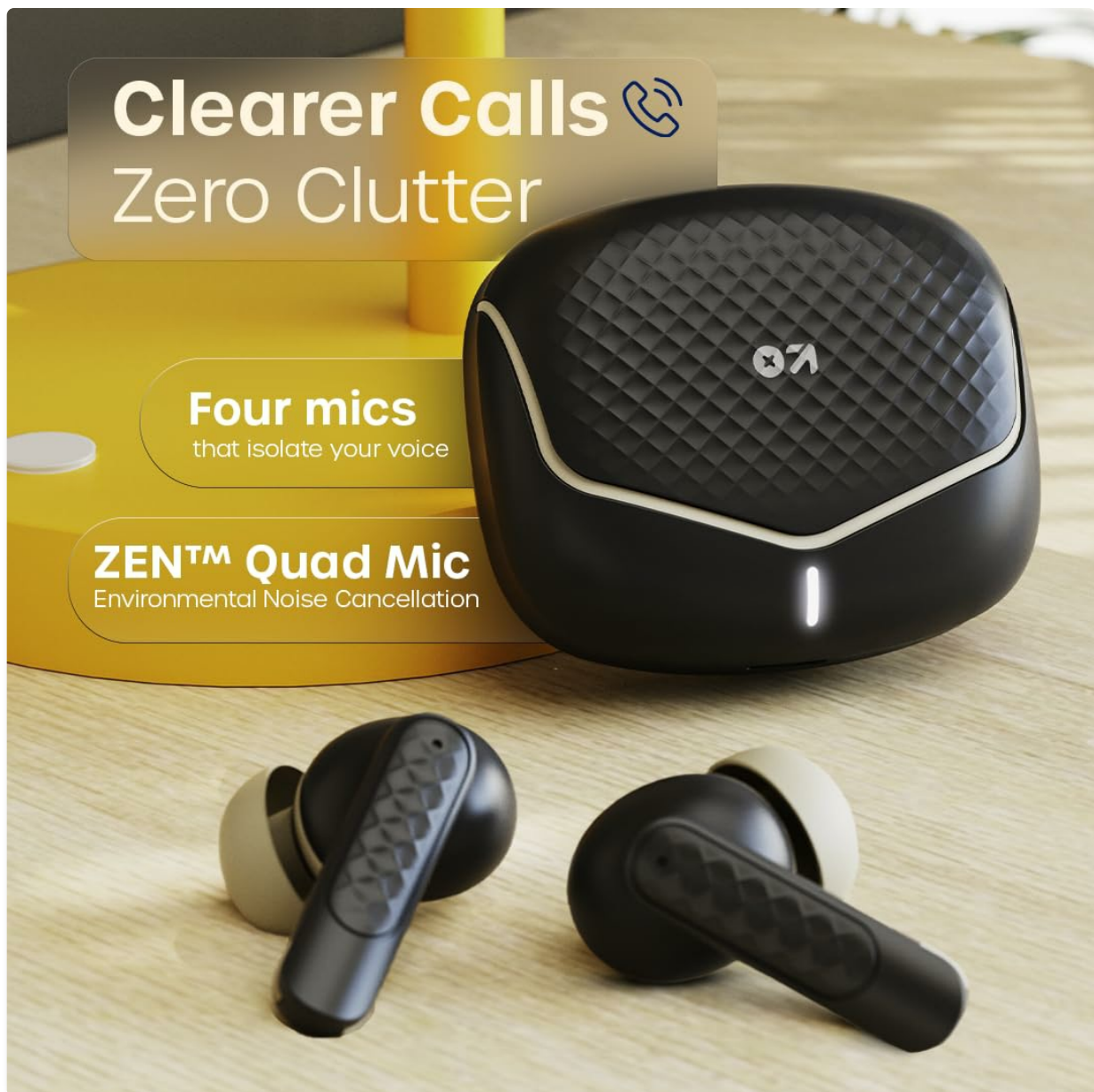
Image: The charging case and earbuds, emphasizing the ZEN™ Quad Mic Environmental Noise Cancellation for clearer calls.