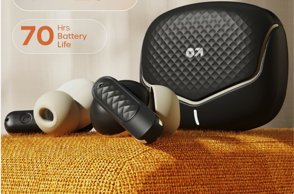
Image: Visual representation of the charging case and earbuds, highlighting 70 hours battery life and fast charging capability (10 mins charge = 120 mins playtime).