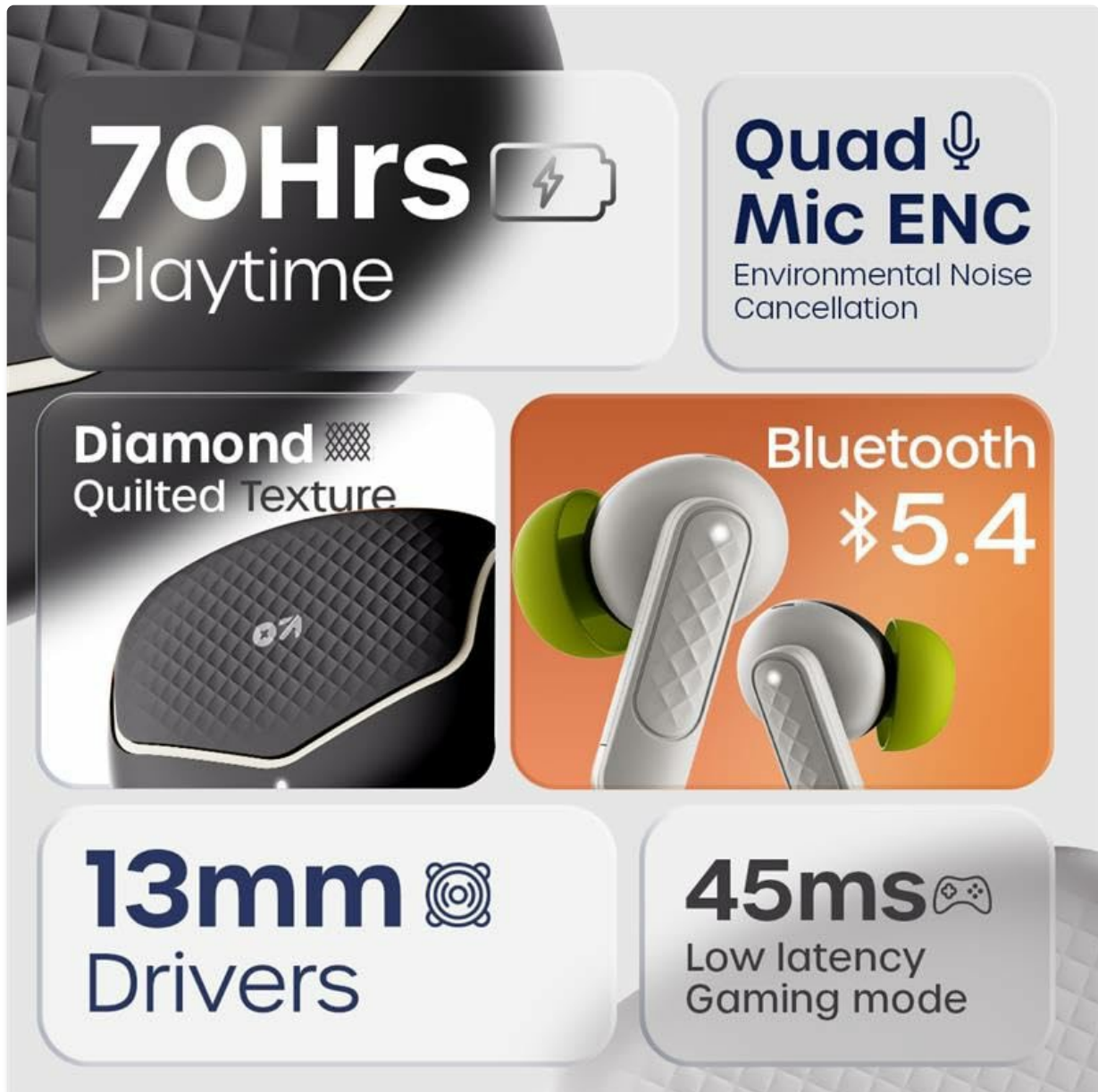
Image: An infographic highlighting key features such as 70 hours playtime, Quad Mic ENC, Bluetooth 5.4, 13mm drivers, and 45ms low latency.