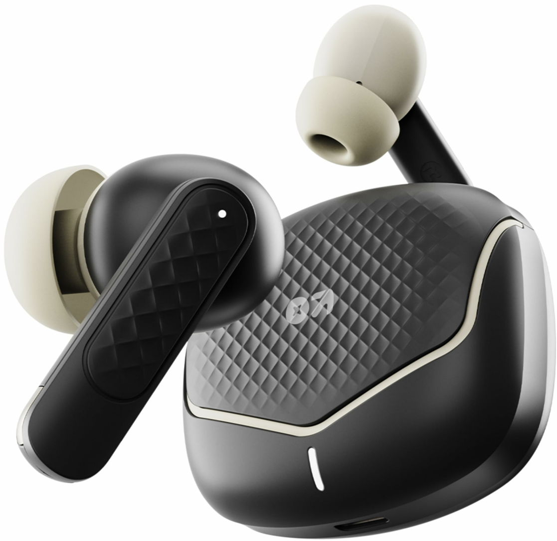
Image: The GOBOULT Z40 V2.0 earbuds with their charging case, showcasing the sleek design.