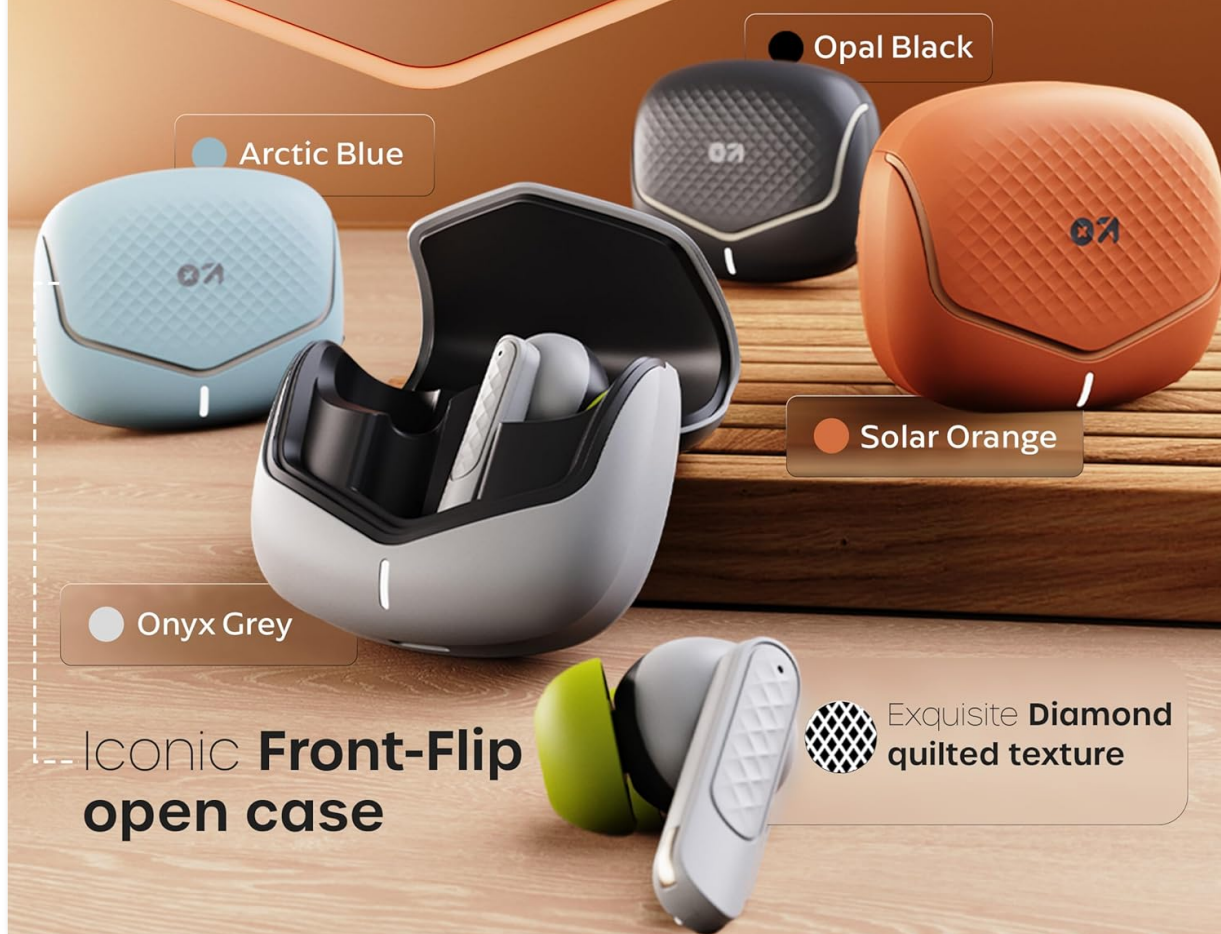
Image: The iconic V-Flip charging case and earbuds displayed in Opal Black, Onyx Grey, Solar Orange, and Arctic Blue color options.