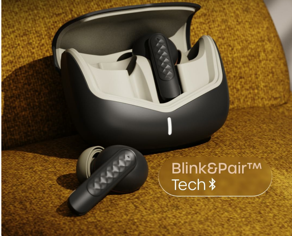
Image: The charging case open with earbuds, illustrating the upgraded Bluetooth v5.4 for quicker pairing and higher reliability with Blink&Pair™ Tech.