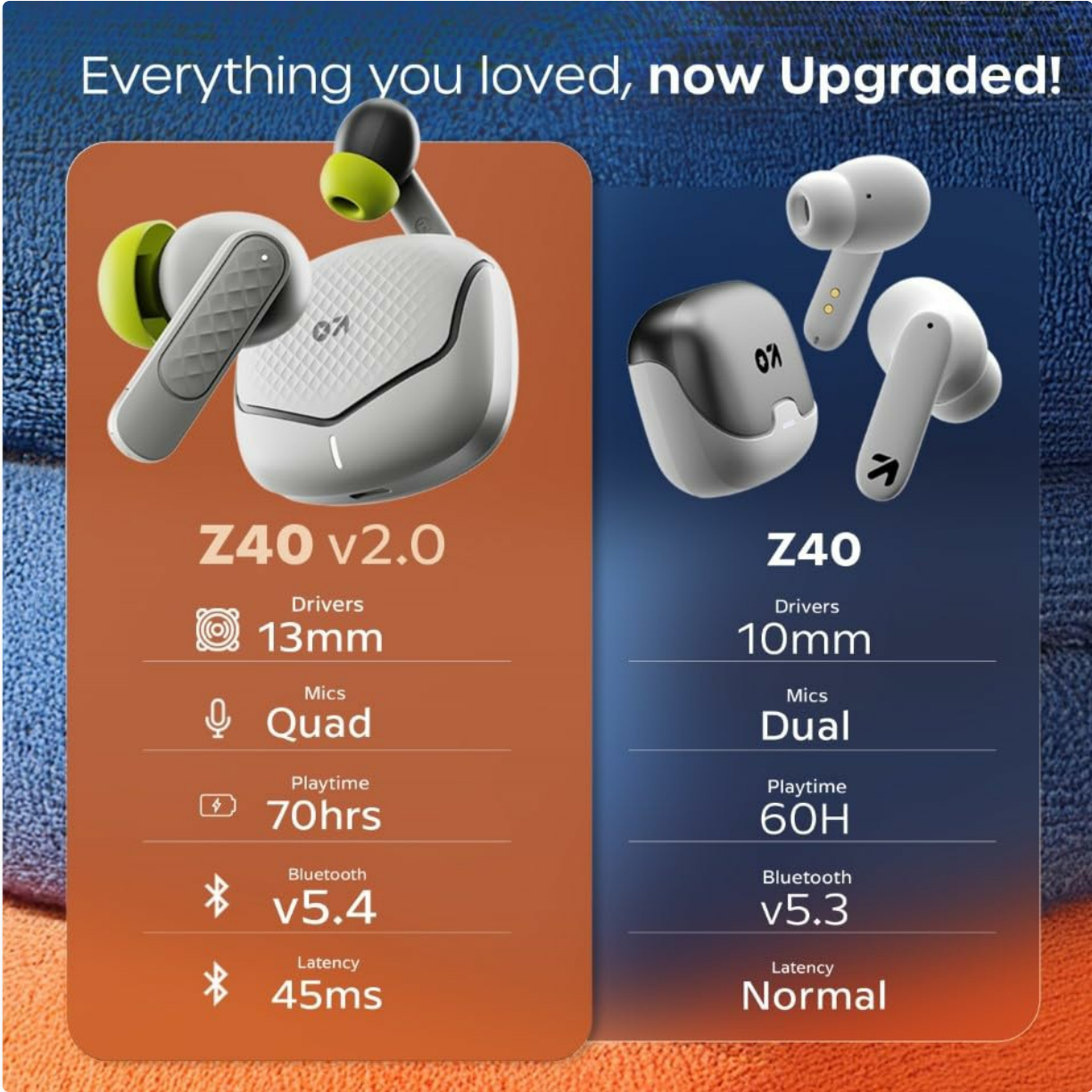
Image: A comparison table showing upgrades from Z40 to Z40 V2.0, including 13mm drivers, Quad Mics, 70hrs playtime, Bluetooth v5.4, and 45ms latency.