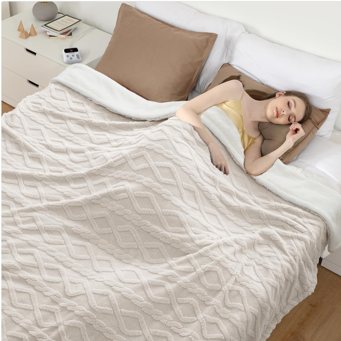
Figure 5: Comfortable Use. This image depicts a person enjoying the warmth of the MilleLoom heated blanket, illustrating its intended use for comfortable sleep.

Each control unit operates one half of the King Size blanket independently. This allows two users to customize their warmth without affecting the other side.