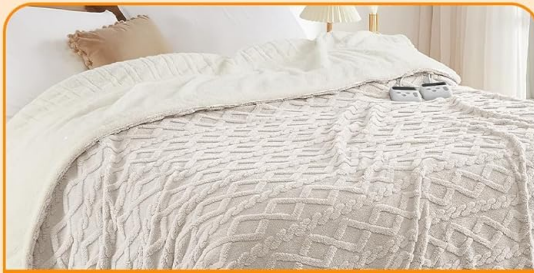
Faster Heating Rate