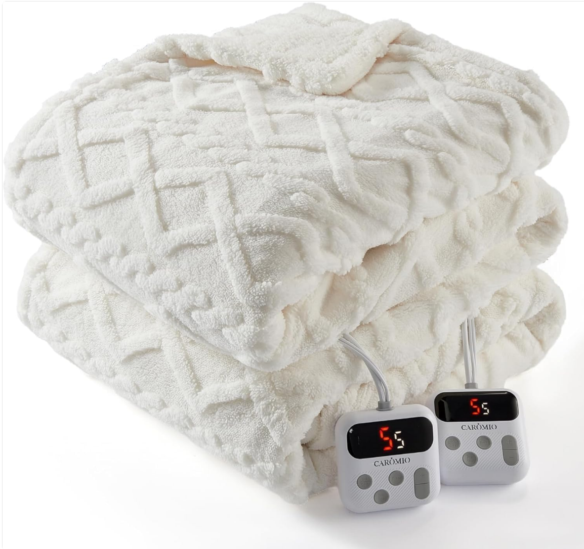
Figure 2: MilleLoom King Size Heated Electric Blanket. This image displays the blanket folded, showcasing its plush texture and the two independent digital control units.