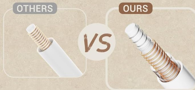
Figure 1: Internal Structure and Safety Features. This diagram illustrates the construction of the MilleLoom heated blanket, highlighting the integrated PTC/NTC heating wires designed for enhanced stability, safety, and rapid heating, preventing overheating.

Upgraded PTC/NTC heating wires, safer and more reliable. Overheat Protection & Fast Heating.