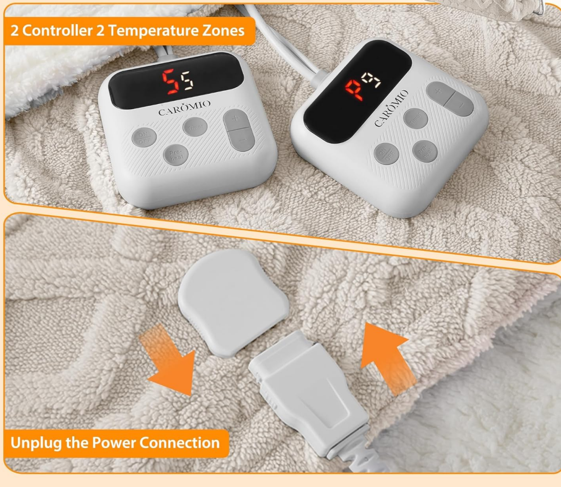
Figure 4: Controller Connection. This image shows the two digital controllers and illustrates the process of connecting and disconnecting the power cord from the blanket.