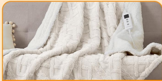
Higher Temperature Range