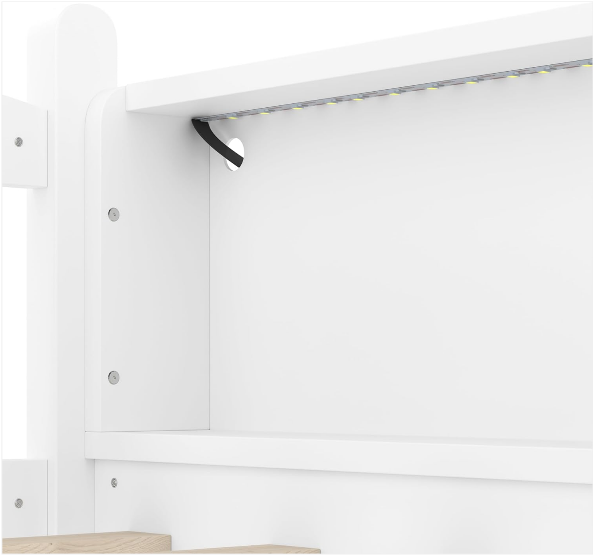
Image: A detailed view of the LED light strip installed within the storage shelf area of the Bellemave Twin Loft Bed.