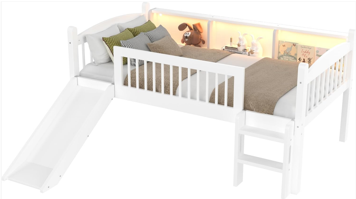
Image: The Bellemave Twin Loft Bed with its integrated LED lights illuminated, showcasing the lighting feature and storage shelves.

The integrated LED lights provide ambient lighting. To operate the LED lights, connect the power adapter to a standard electrical outlet. The lights are typically controlled via a switch or remote (if included). Refer to the specific LED light kit instructions for detailed operation.