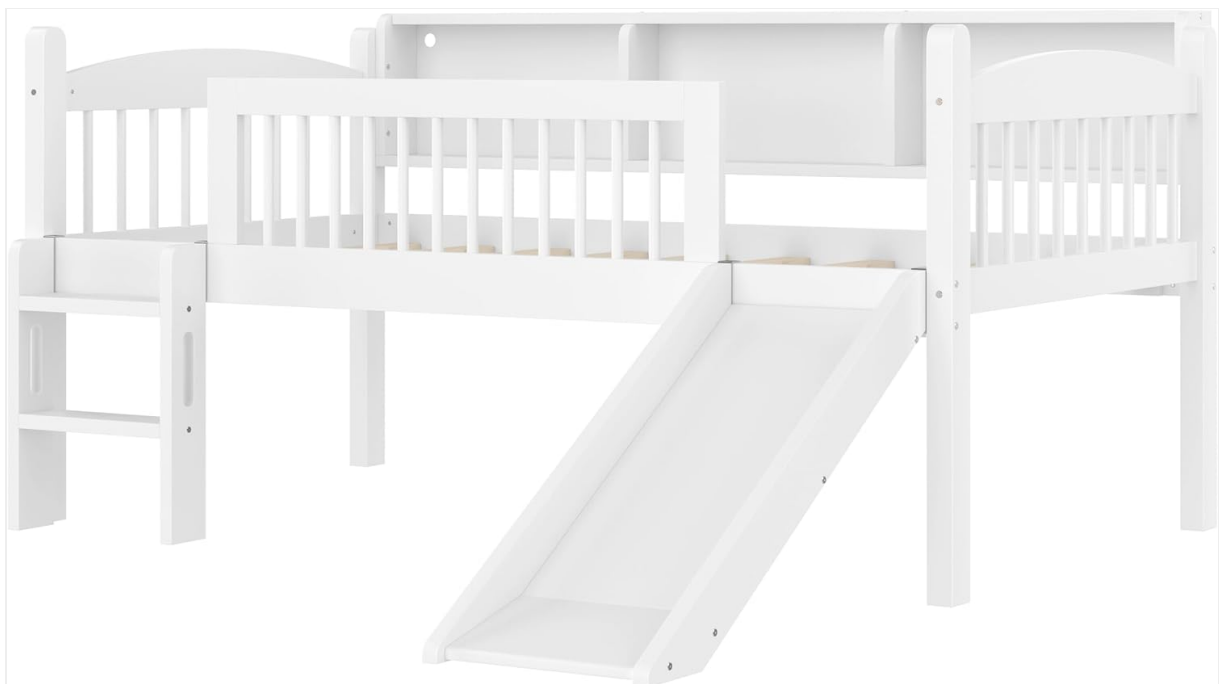
Image: An angled view of the Bellemave Twin Loft Bed, illustrating the overall structure with the ladder and slide attached,