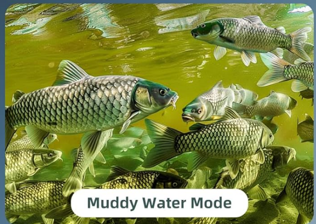
Image: Examples of various display modes, including normal, infrared, monochrome, and muddy water, demonstrating the camera's adaptability.