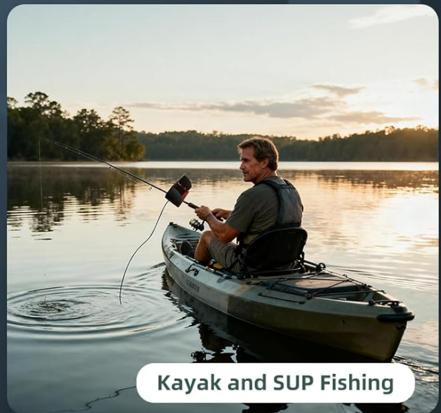
Kayak and SUP Fishing

Image: Collage showing the camera being used in diverse fishing environments such as ice fishing, night fishing, sea fishing, and kayak fishing.