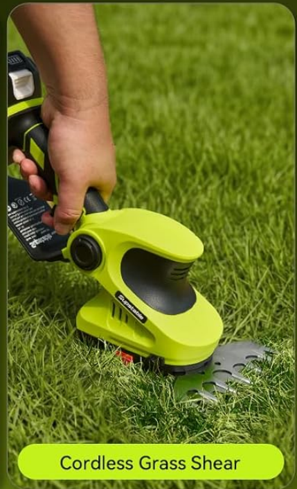
Cordless Grass Shear

The Supstable S5 Combo kit, showcasing all components for its versatile 6-in-1 functionality.