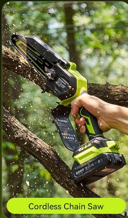
Cordless Chain Saw