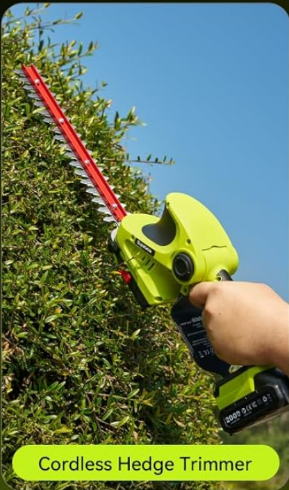
Cordless Hedge Trimmer